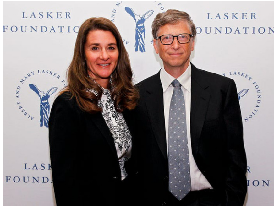
Billionaire Bill Gates and his wife - Melinda Gates