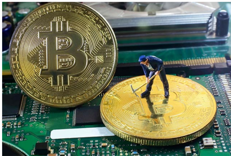
The battle against cryptocurrency activities has not yet been concluded

Although the value of cryptocurrencies has been declining after a short time with signs of prosperity, illegal cryptocurrency mining activity has never been 'hot'. Global cyber crime community. The fight against the criminal activities in the field of cryptocurrencies in particular and global cyber security in general has been, is, and will still be very tough.