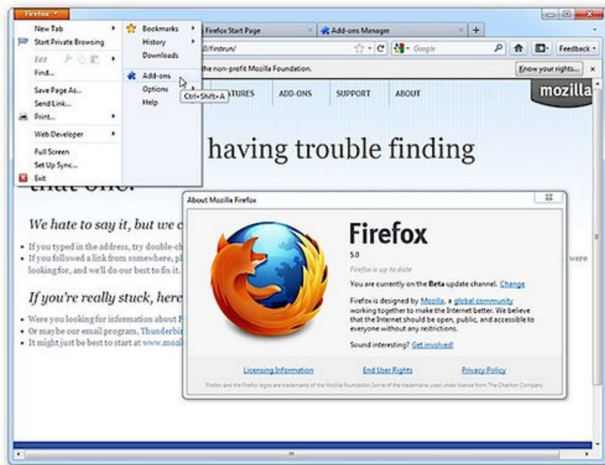
Mozilla FireFox web browser 5

After installing FireFox 5, it is not surprising that users do not realize any special improvements outside of the upgrade from FireFox 3 to FireFox 4. However, Mozilla has made some significant improvements. Notice in FireFox 5, including: