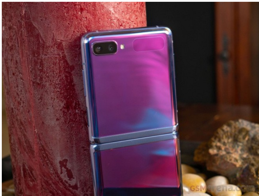
Galaxy Z Flip

The total score that DxOMark has for Samsung Galaxy Z Flip is 105 points. This is a not bad score compared to a phone released in . 2018.