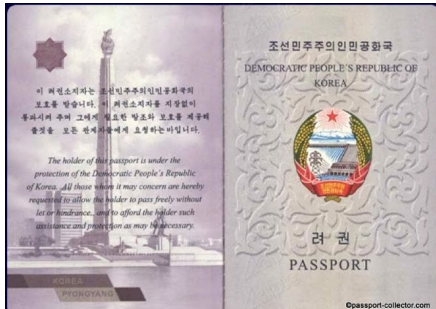
First page in Korean passport

According to the Passport Index, the Korean passport is the world's weakest passport because it is only exempted from visa in 41 countries.