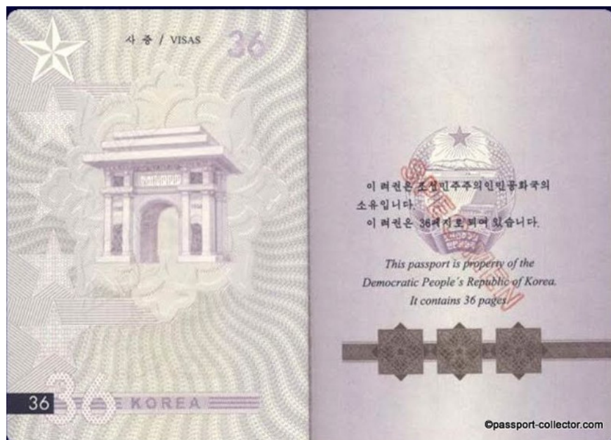
Last page of Korean passport.

A Korean citizen spent $ 3,000 and spent more than six months waiting to have a passport.