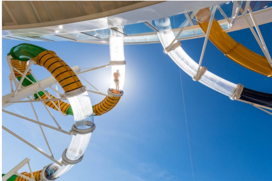
This is the top of the Ultimate Abyss, from this player can slide up to 28 meters high.