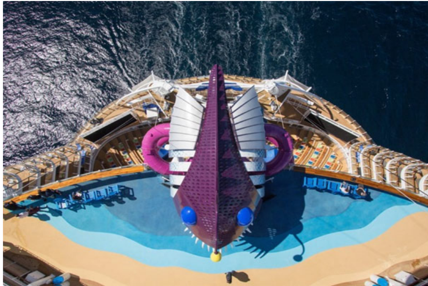
Splashaway Bay water park with many exciting games.