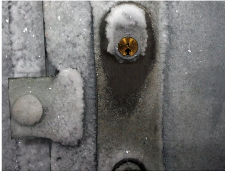
The inner door from the main chamber enters one of the three rooms of the basement.

Seeds are transferred to the main room of the cellar with a trolley