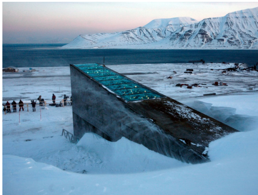
The Svalbard Global Seed Vault - Global seed tunnel

Deep in a mountain in the remote Svalbard Islands between Norway and the Arctic, the base "The Svalbard Global Seed Vault - the global seed tunnel" was built for the purpose of becoming "savior" "of humanity if the apocalypse comes.