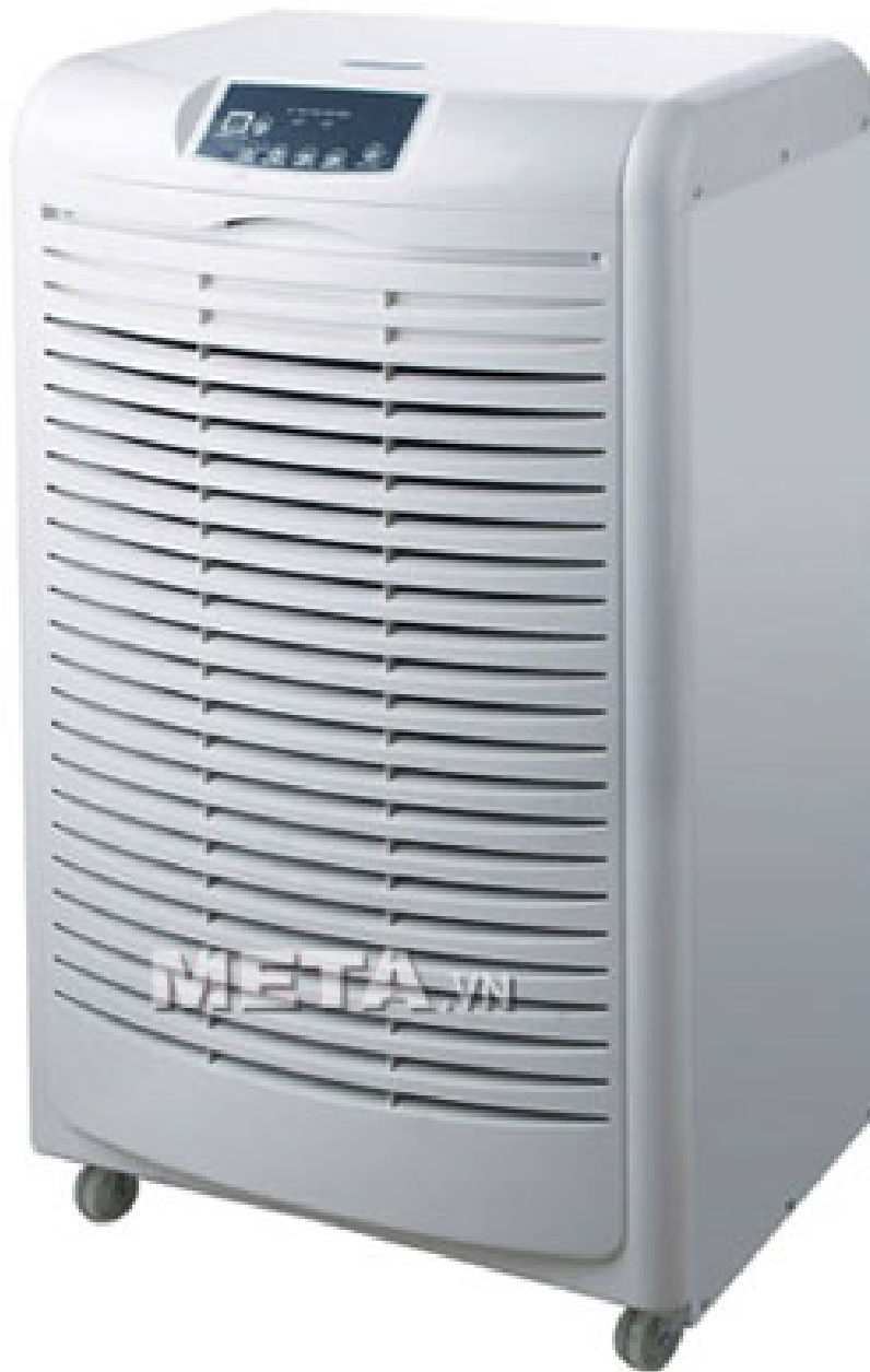
Electronic control dehumidifier