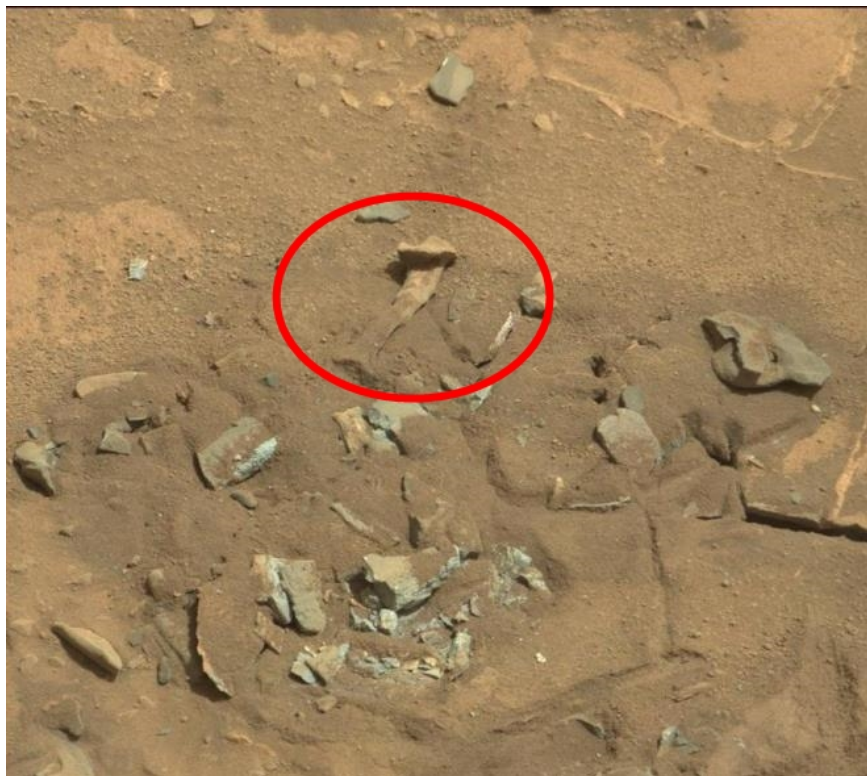
The rock is suspected to be human bone on the surface of Mars.

At the time, some people who believed in conspiracy theories considered this to be the clearest evidence of the existence of life on the Red Planet. After 6 years, the image reappeared and was quickly shared multiple times on social networks and several online forums, according to ScienceAlert.