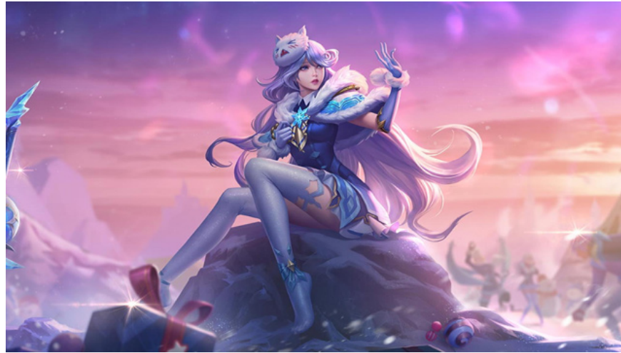
Sinestrea Miss Ice

You finished reading the article " Collection of Arena of Valor Splash Art, high-quality full HD Arena of Valor wallpapers. " edited by the TipsMake team. We hope this article has provided you with many useful tech tips and tricks. You can search for similar articles on tips and guides. Thank you for reading and for following us regularly.