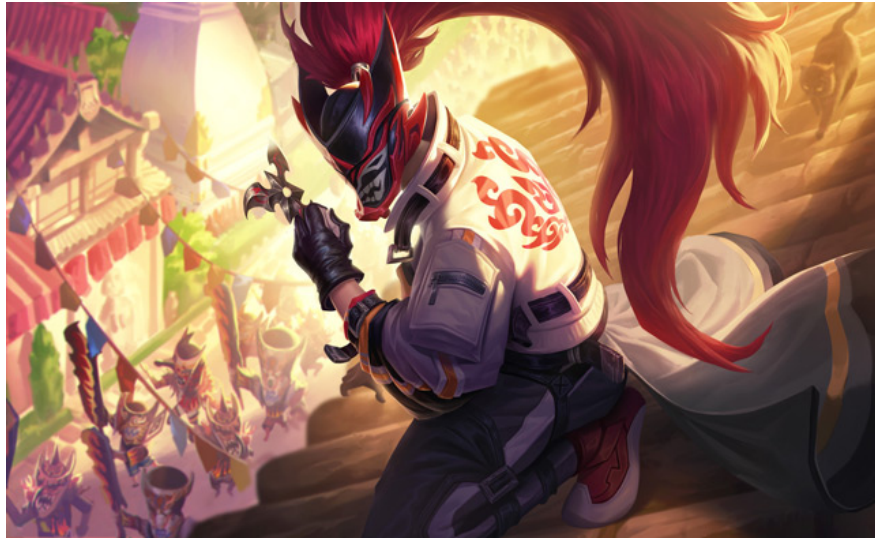
Hayate Demon Face