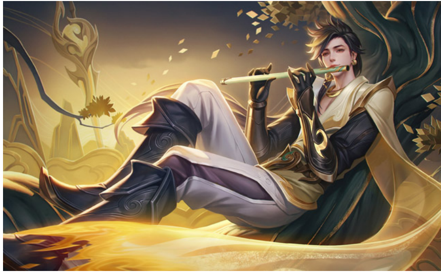
Murad Supreme Divine Sword