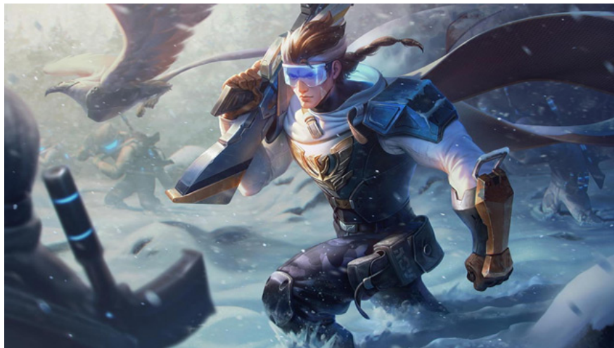
Elsu Snow Eagle