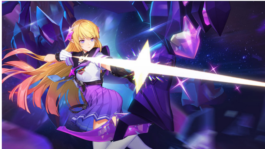
Tel'Annas Dimensional Guardian