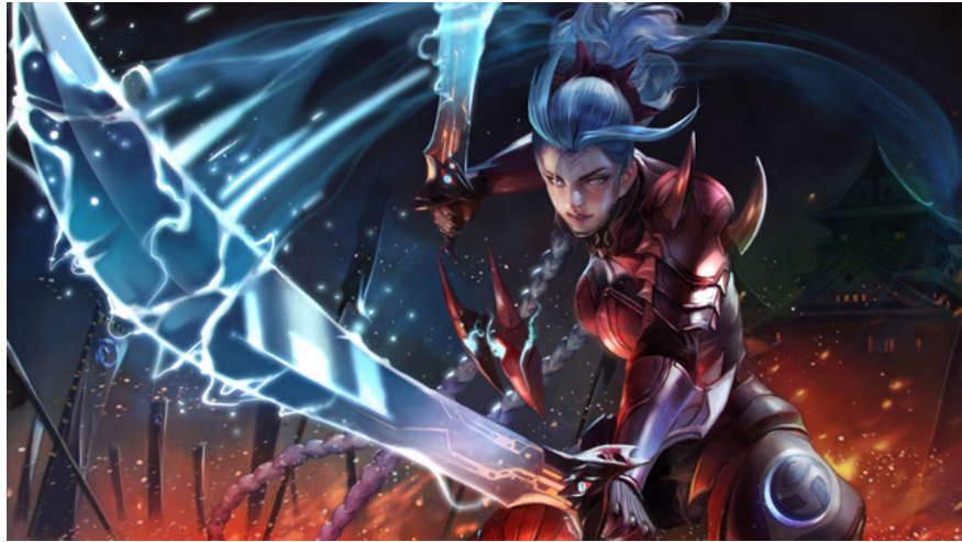
Airi, Moon Clan Forbidden Guard