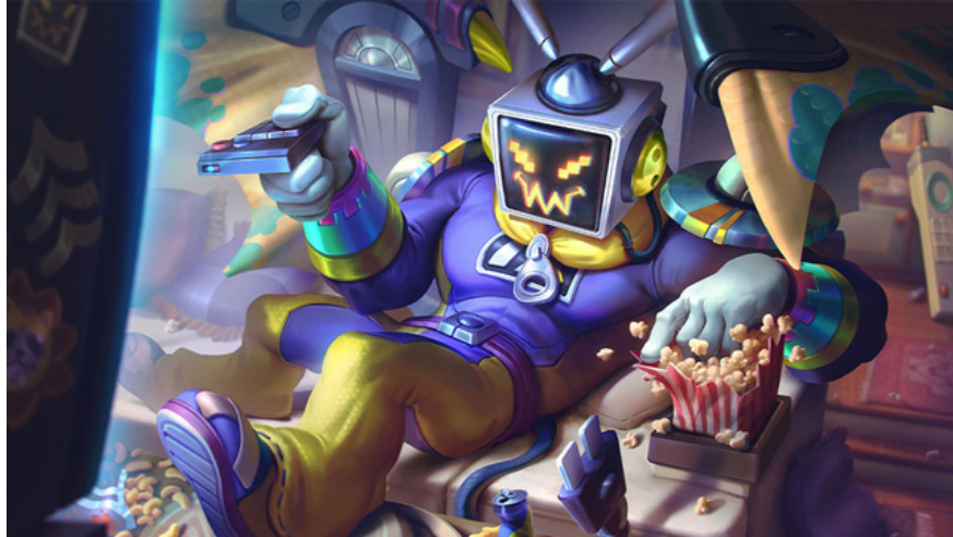
Florentino, the Evil Dragon Swordsman