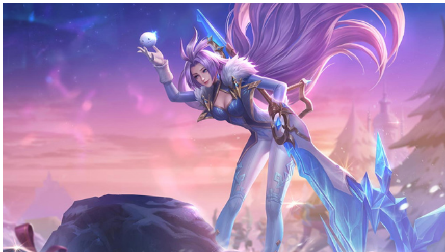
Snow Princess Dextra