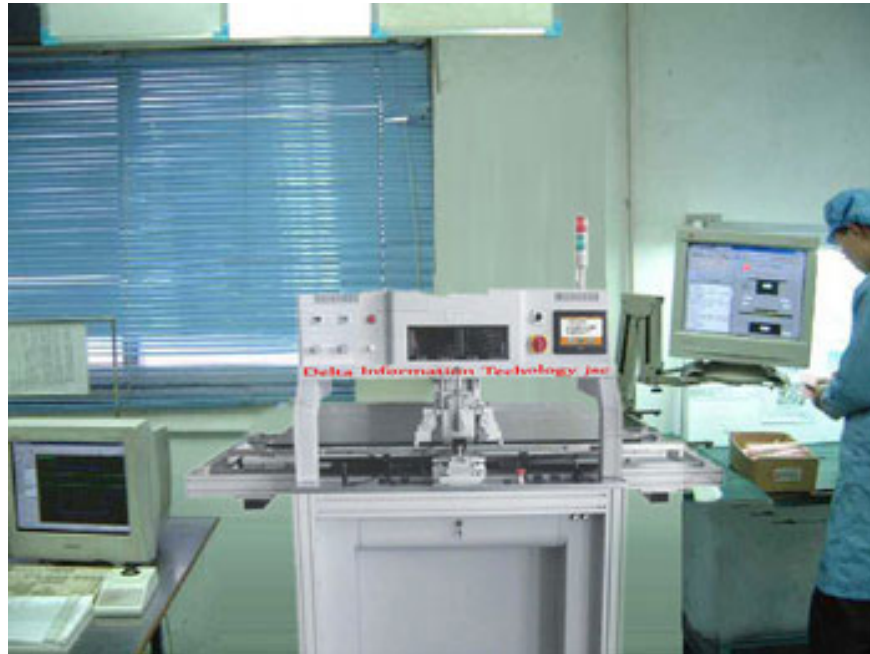
TAB welding machine.

Typically, a laptop's LCD screen has an average life of 10,000 hours. However, depending on the model as well as usage, they have different durability. Therefore, the user should open and close gently, avoid causing the cable break between the mainboard and the screen. The screen should open the most appropriate angle from 90 to 120 degrees and should not be opened and closed repeatedly for a short time.