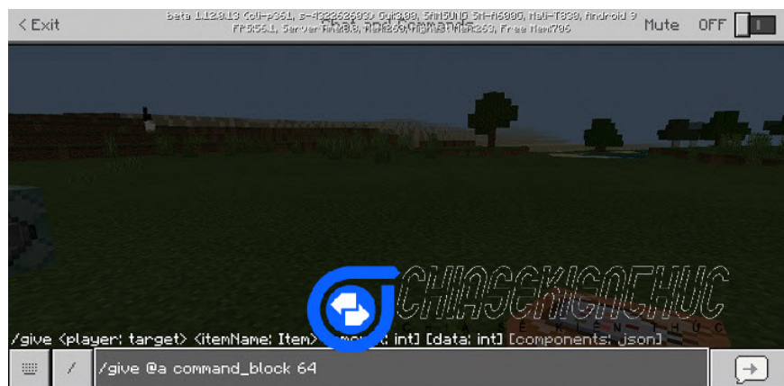
Picture 3 of Comamand block and some codes in Minecraft game