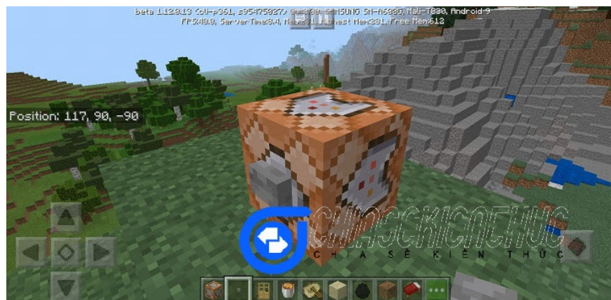
Picture 7 of Comamand block and some codes in Minecraft game

Note that you have to sit down to place levers or buttons on Command blocks. When you're done, just press the button, lever, . to turn them on.