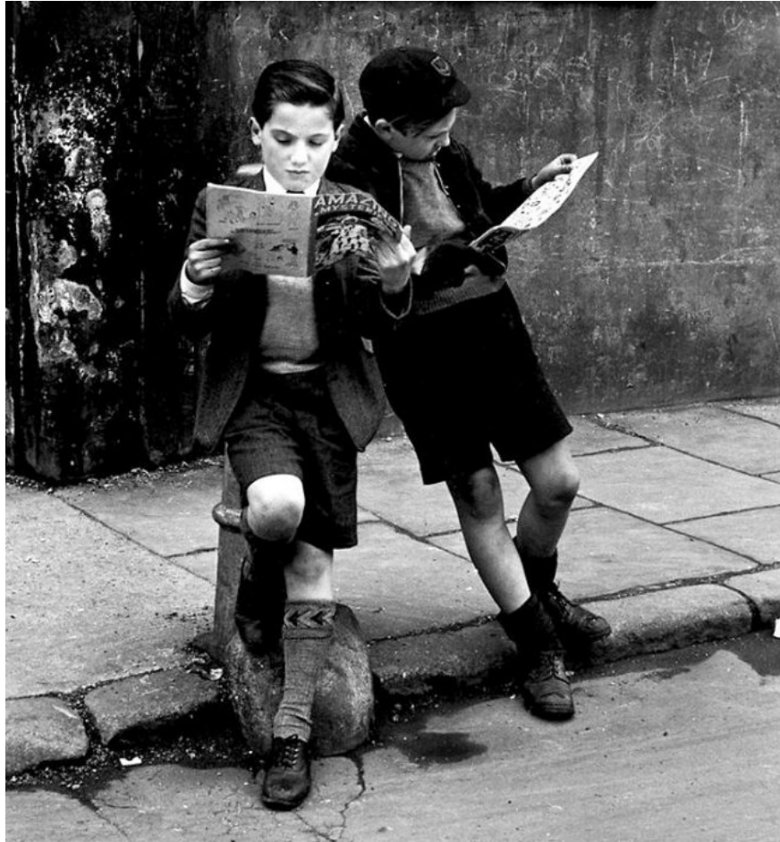
"Get into the rain"