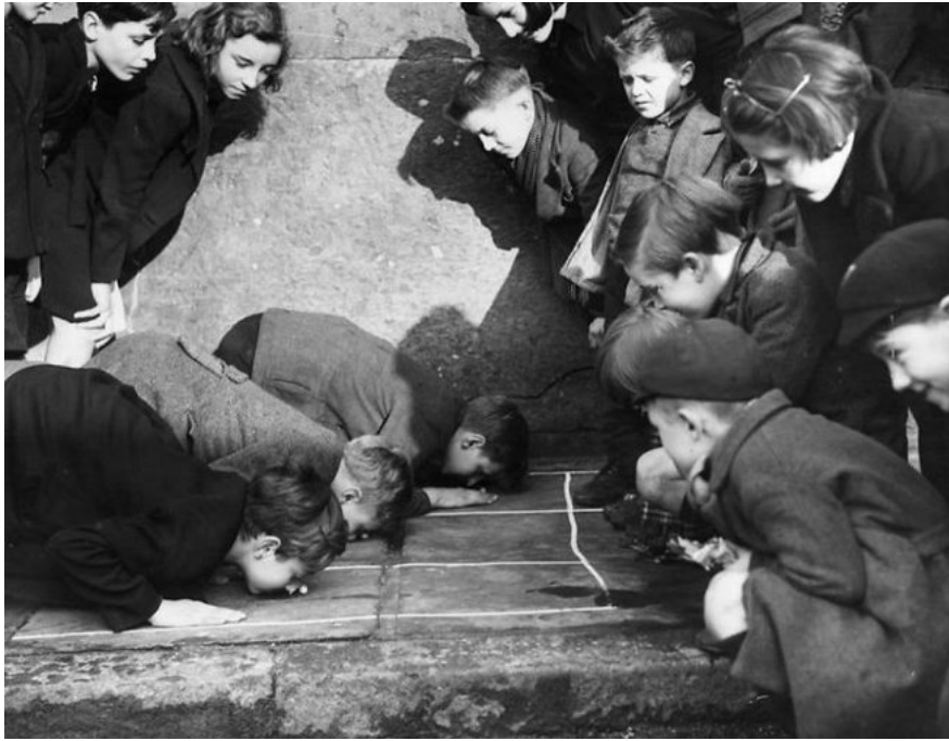
Two children are playing with their "best friend"