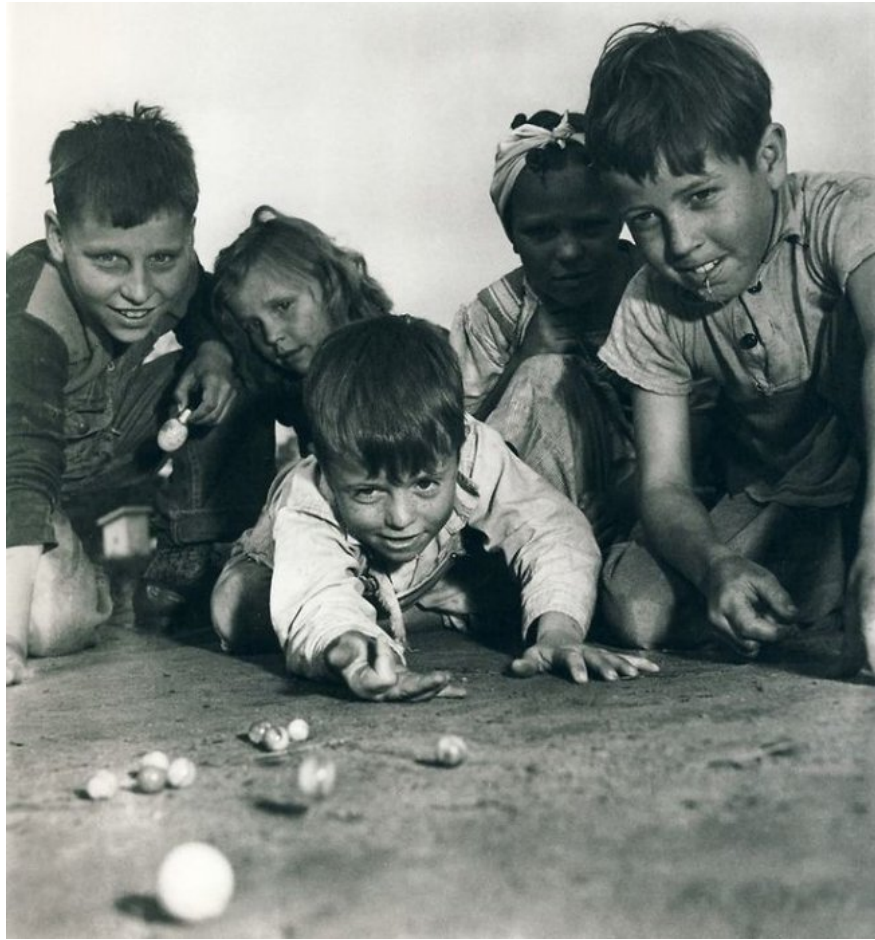
The children played under the Eiffel Tower in Paris