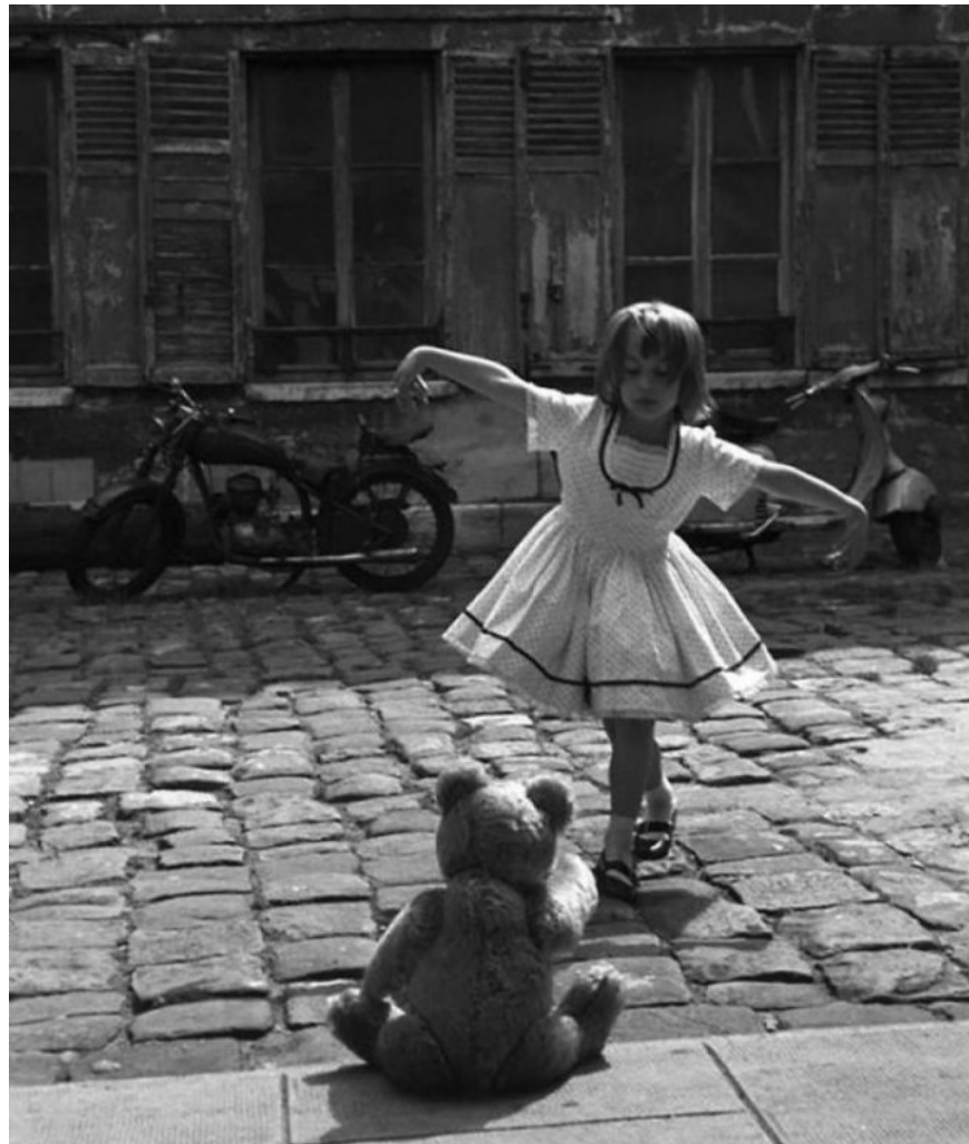
The young dancers are practicing on New York streets in the 1940s