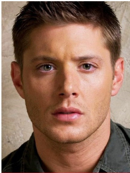
Mặt trái xoan

Recent psychological research shows that men with oval faces will make women feel attractive. Meanwhile, men like to watch women with heart-shaped faces.