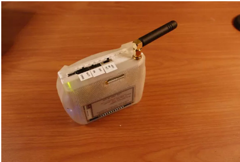
A number of toggle switches are located on the side of the phone.