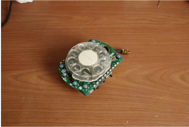
Homemade circuit board with modern mobile connection chip.