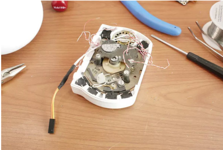
Case with nostalgic dialing mechanism.