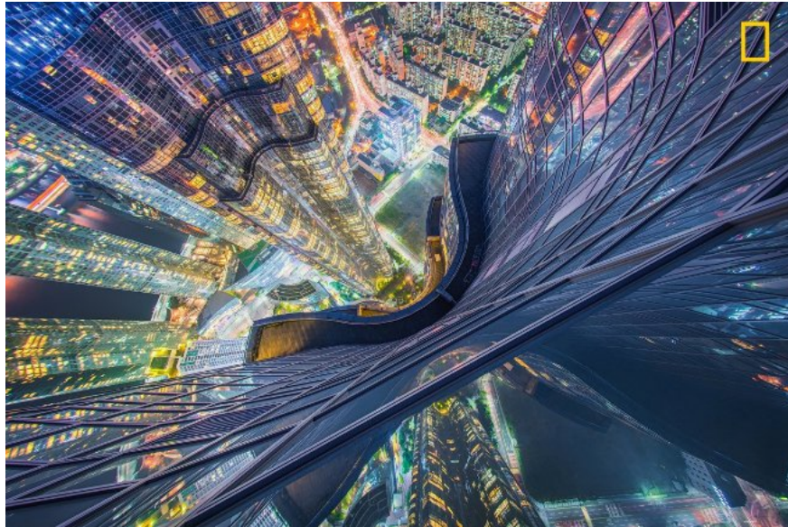
Gifu Prefecture, Honshu, Japan