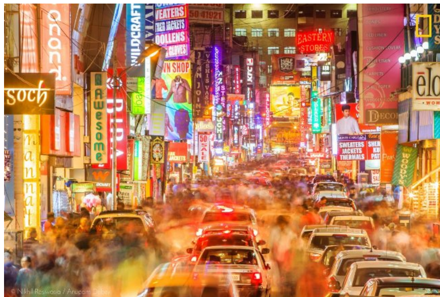
Photo source: Nikhil Rasiwasia / National Geographic Travel Photographer of the Year Contest Nagasaki, Kyushu, Japan