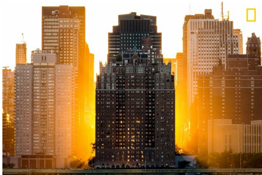
Frankfurt, Germany