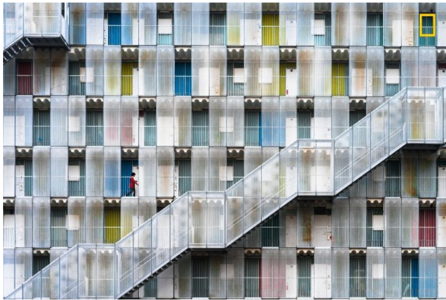
Al Ain, United Arab Emirates