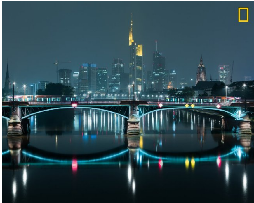
New York City, USA