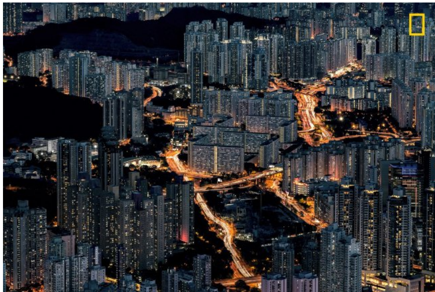
Jujing, China