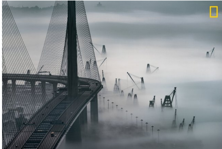
See more: 15 photos of the world today make viewers startled to ponder