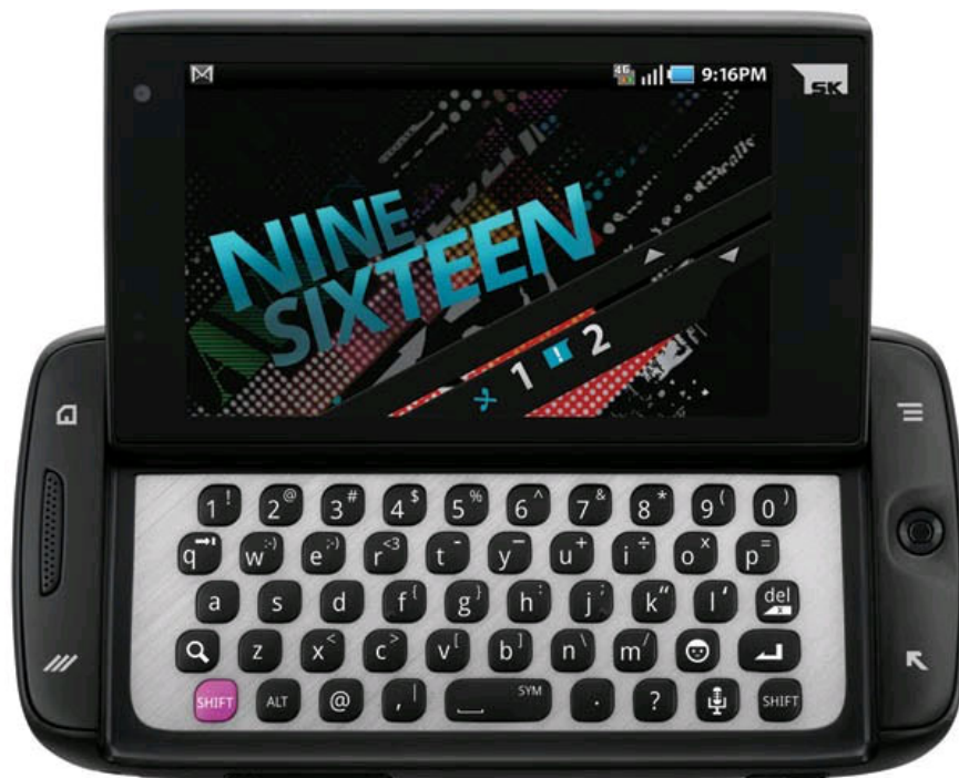
T-Mobile's Sidekick phone

However, a software engineer has a different way of thinking, it's Andy Rubin . First, he worked on an operating system designed specifically for digital cameras, but then he developed for the phone. His career began as a robot engineer in Carl Zeiss , but he later moved to work on the handheld operating system and is known for a project called Danger for phones. T-Mobile's Sidekick.