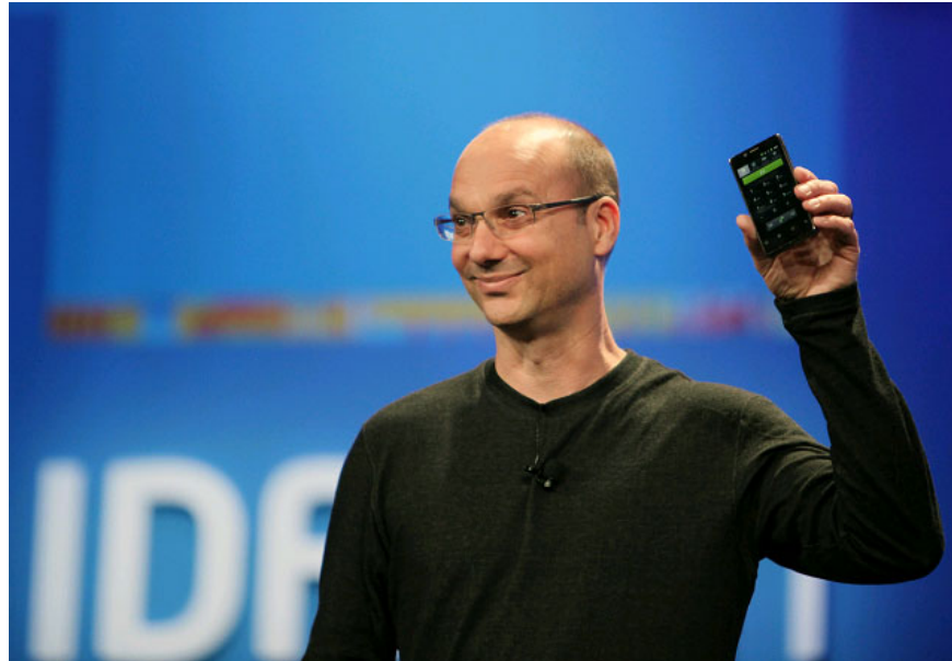
Andy Rubin, the father of Android

However, a software engineer has a different way of thinking, it's Andy Rubin . First, he worked on an operating system designed specifically for digital cameras, but then he developed for the phone. His career began as a robot engineer in Carl Zeiss , but he later moved to work on the handheld operating system and is known for a project called Danger for phones. T-Mobile's Sidekick.