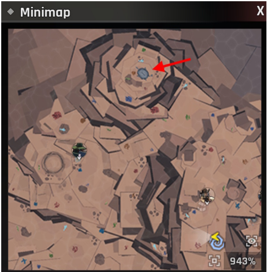
Here, you can find the second fish-shaped ruins located on a rock structure right next to Gumpy Hank Tower.