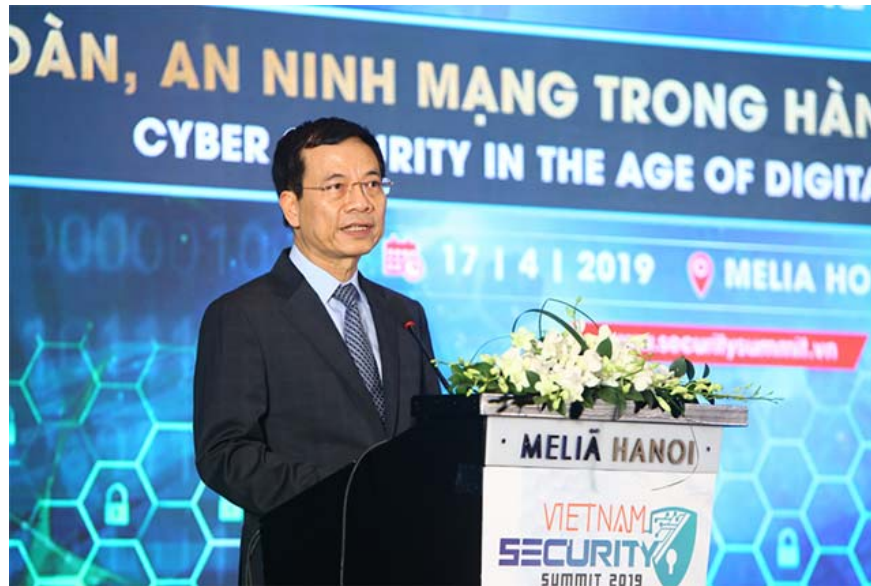
Minister of Information & Communications Nguyen Manh Hung

1. The 5 most notable cyber security conferences in the world take place throughout the year