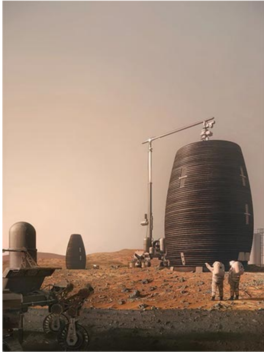
MARSHA simulation when built on Mars

Thanks to the optimal design for construction, it will only take about 30 hours to complete 3D printing of the house. The house will be divided into 4 floors, with a garage containing equipment, exploratory machinery on the ground floor, laboratory and central kitchen located on the 2nd floor, personal bedroom and floor hydroponic pond 3, and finally a common entertainment room on the 4th floor. It can be said that the prospect of a '3-star hotel' set up on Mars will no longer be an impossible task.