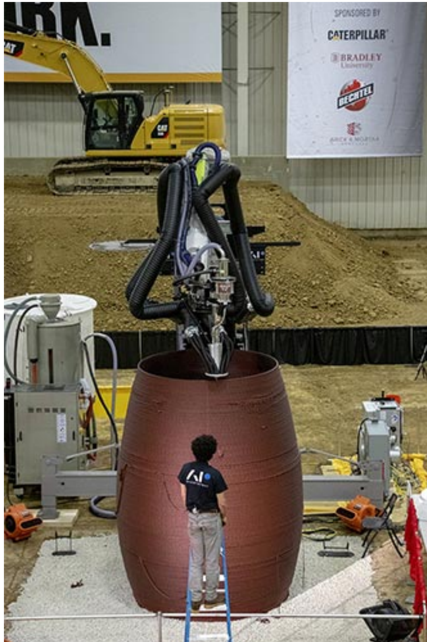
MARSHA model of AI SpaceFactory won the first prize in 3D-Printed Habitat Challenge

According to NASA experts, MARSHA was chosen because this project not only met all basic requirements from the organizers as it was suitable for 3D printing, ensuring the requirements of composite materials, Leakage resistance, durability and resistance levels in environmental conditions in Mars, and need to be made from recycled materials as well as materials that can be found in space such as the Moon and Mars. . but also contains advantages that exceed the expectations of experts such as smart design that allow optimization of atmospheric pressure and other spatial pressures, as well as help maximize floor space. use, ensure absolute safety for pre-radiation astronauts, use biological light to reproduce light like on Earth, helps ease feelings of stress and isolation .