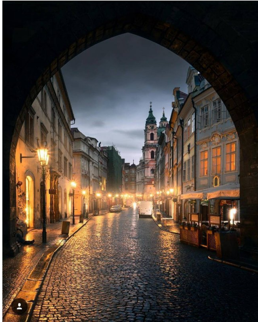
4. The historic street The Shambles in York City