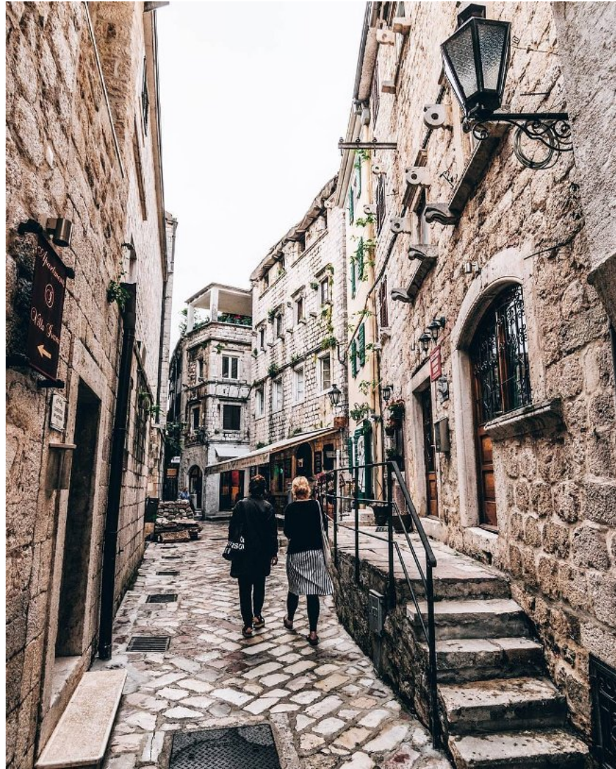
18. A warm, romantic setting in the town of Hallstatt, Austria