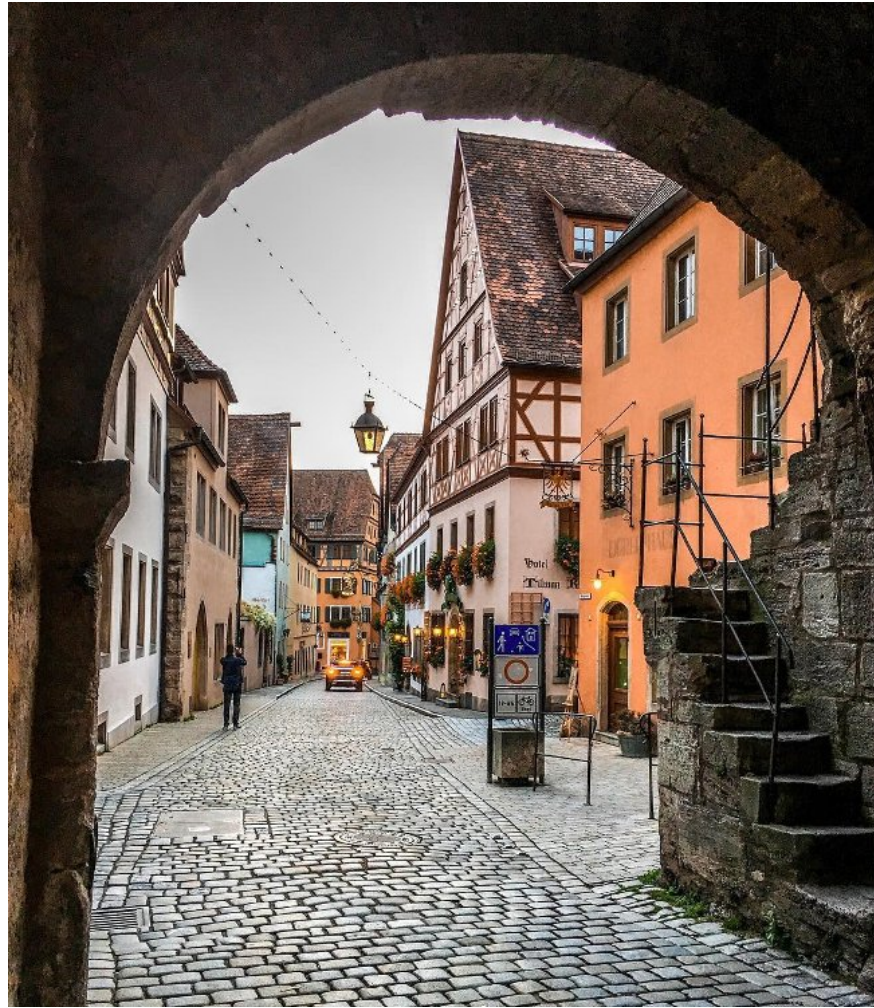
14. A shady and grand Grand Rue in the town of Colmar, France