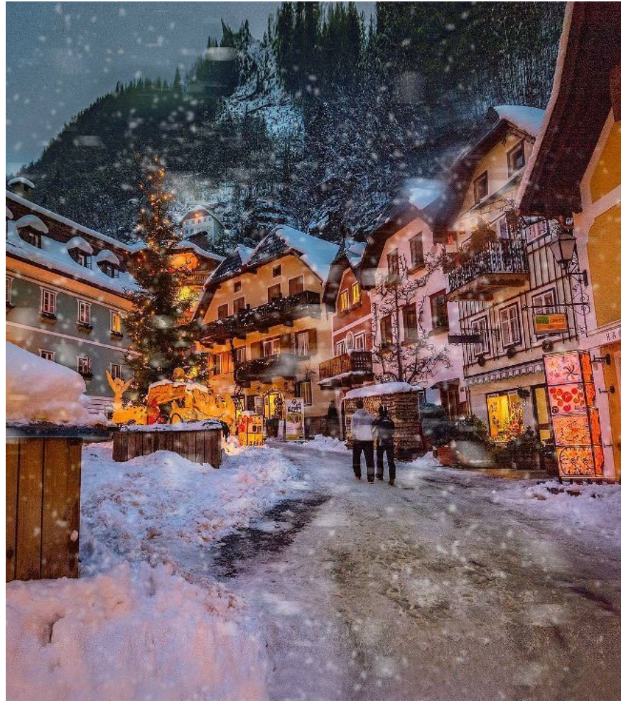
17. The houses are next to each other in Moselle village, Germany