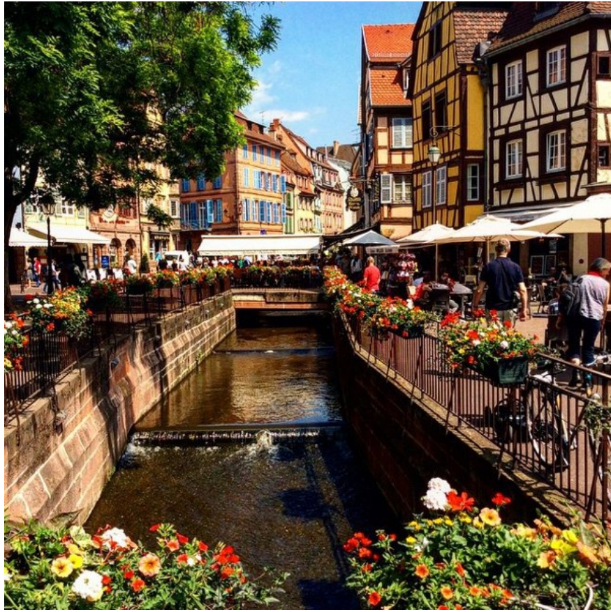
13. The romantic, sweet beauty of Chania town, Greece