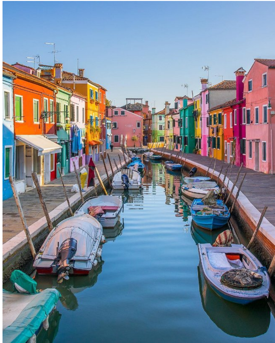
7. Romantic coastal village Molyvos, Greece