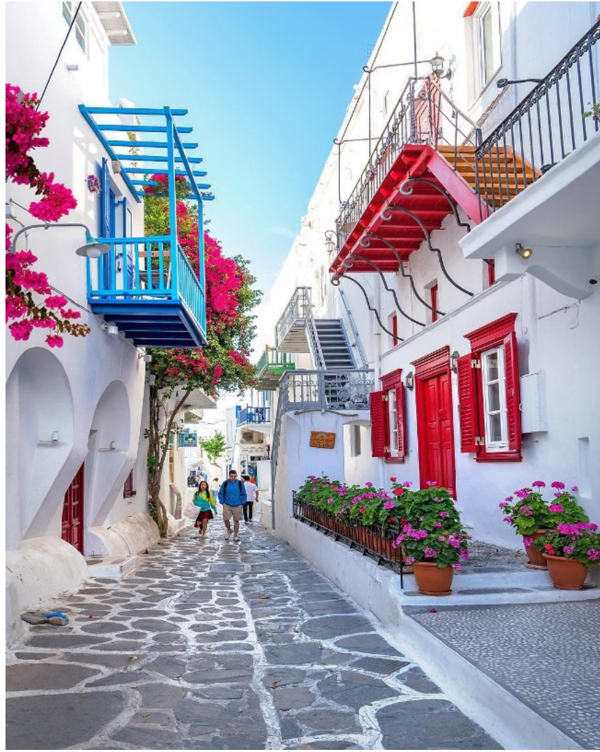
21. Old flavor at Hamamönü, Ankara capital, Turkey