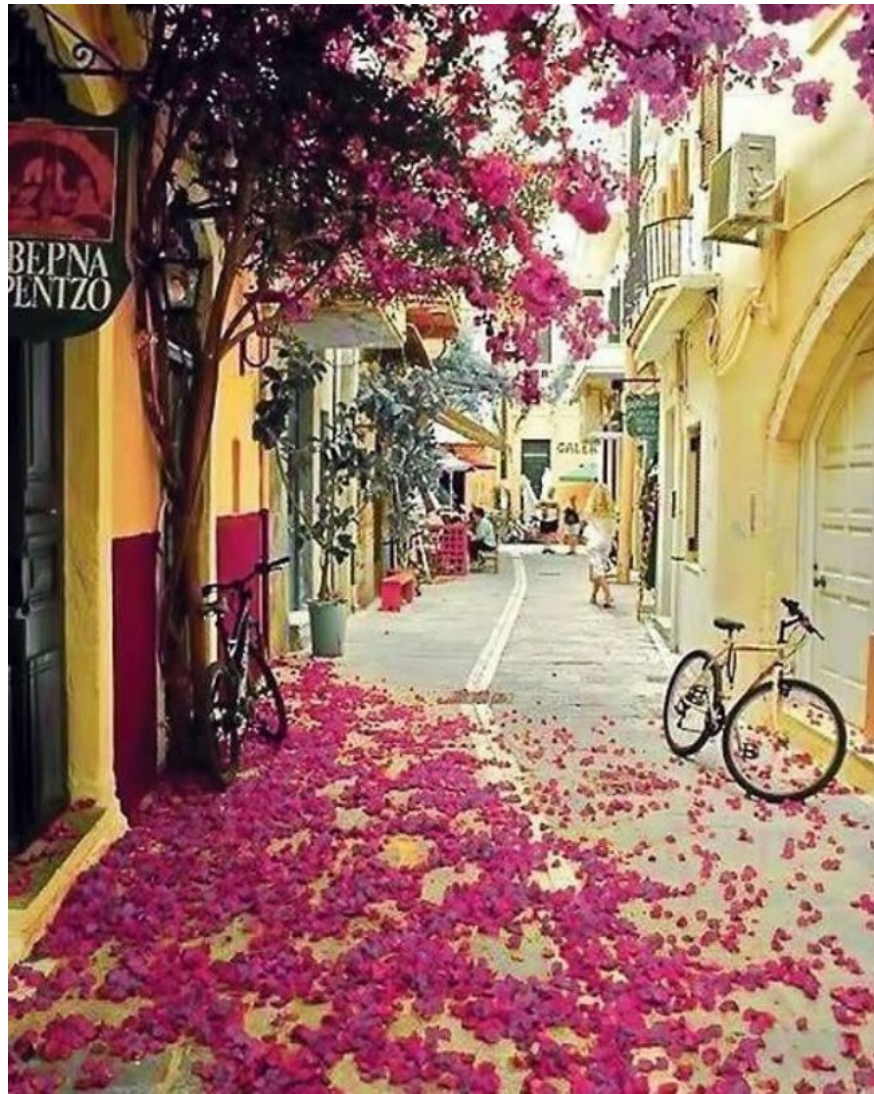
12. City of Verona, Italy