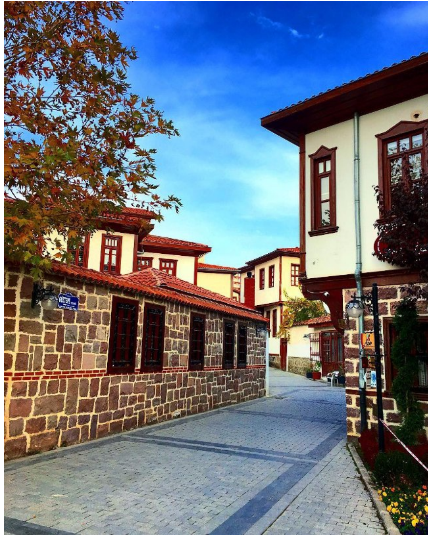
20. Capital Copenhagen, Denmark