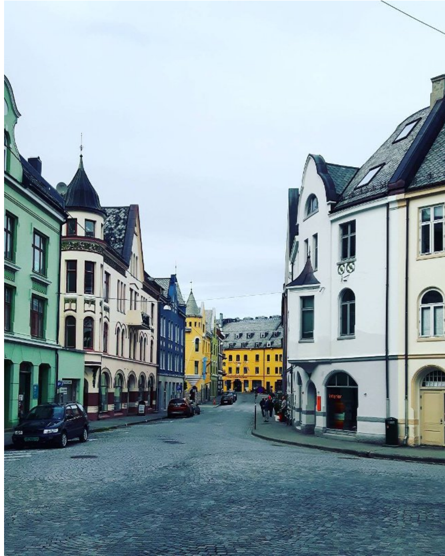
2. On both sides of the paved road Rue Crémieux, Paris, France