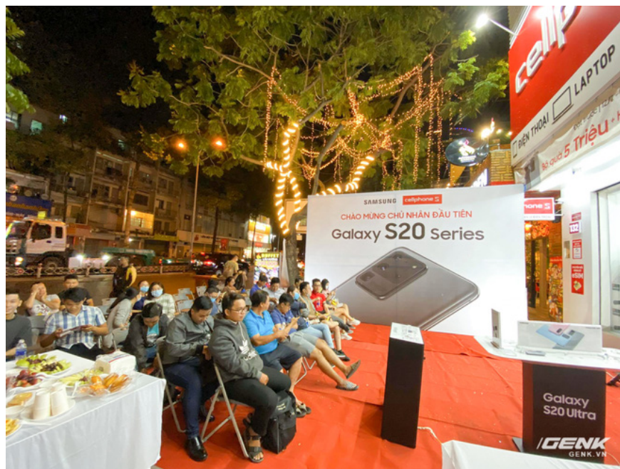
People line up in an orderly and civilized way

According to our records, in order to be the first to own the Galaxy S20 in Vietnam, many people spent the evening queuing in front of the store. And even though the number of people lining up is very large, people still consciously line up and get their numbers in a civilized order without pushing and pushing. Organizing committee also favored to provide both snacks and drinks to "energize" users while waiting in line.