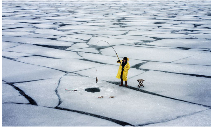
Beysahir lake-faced angler freezes in Turkey.