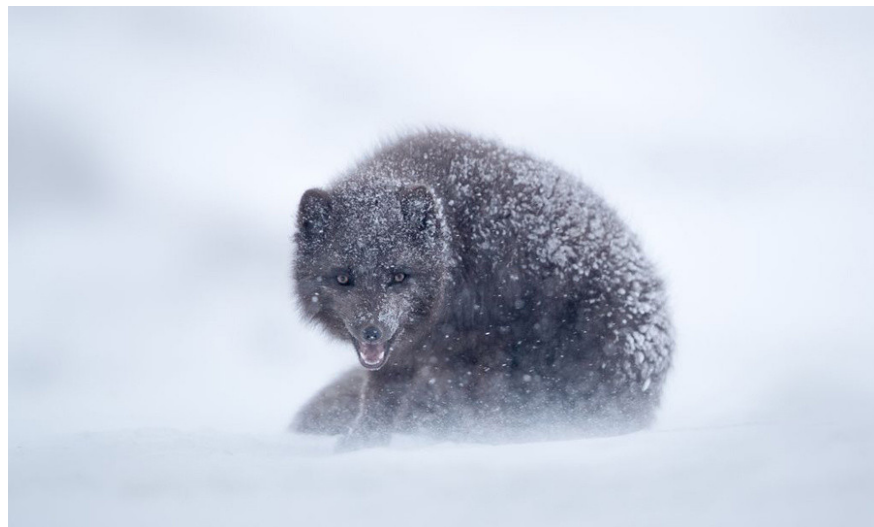
Amidst the cold winds, the rare Arctic blue morph fox looks directly at Sonalini Khetrapal photographer and camera without showing any fear. The photo was taken at Hornstrandir Nature Reserve, Iceland.