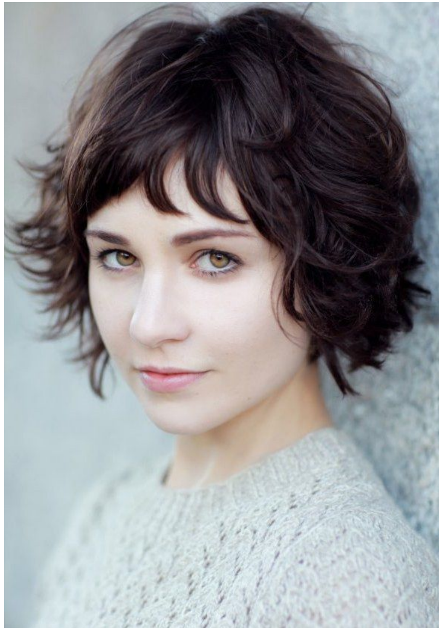
Beautiful short curly hair for ladies