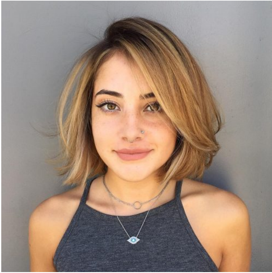
Short hair curled