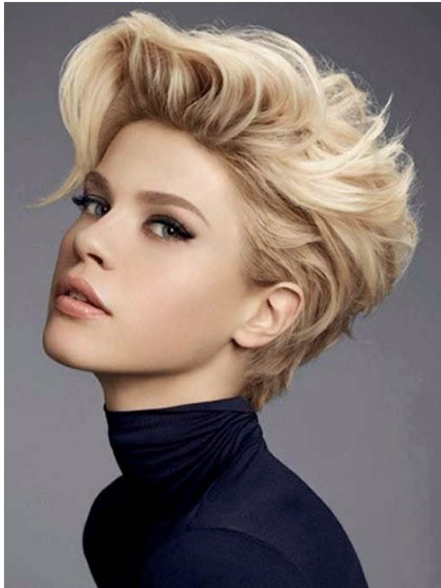
Curly short wave sexy sensual elegance