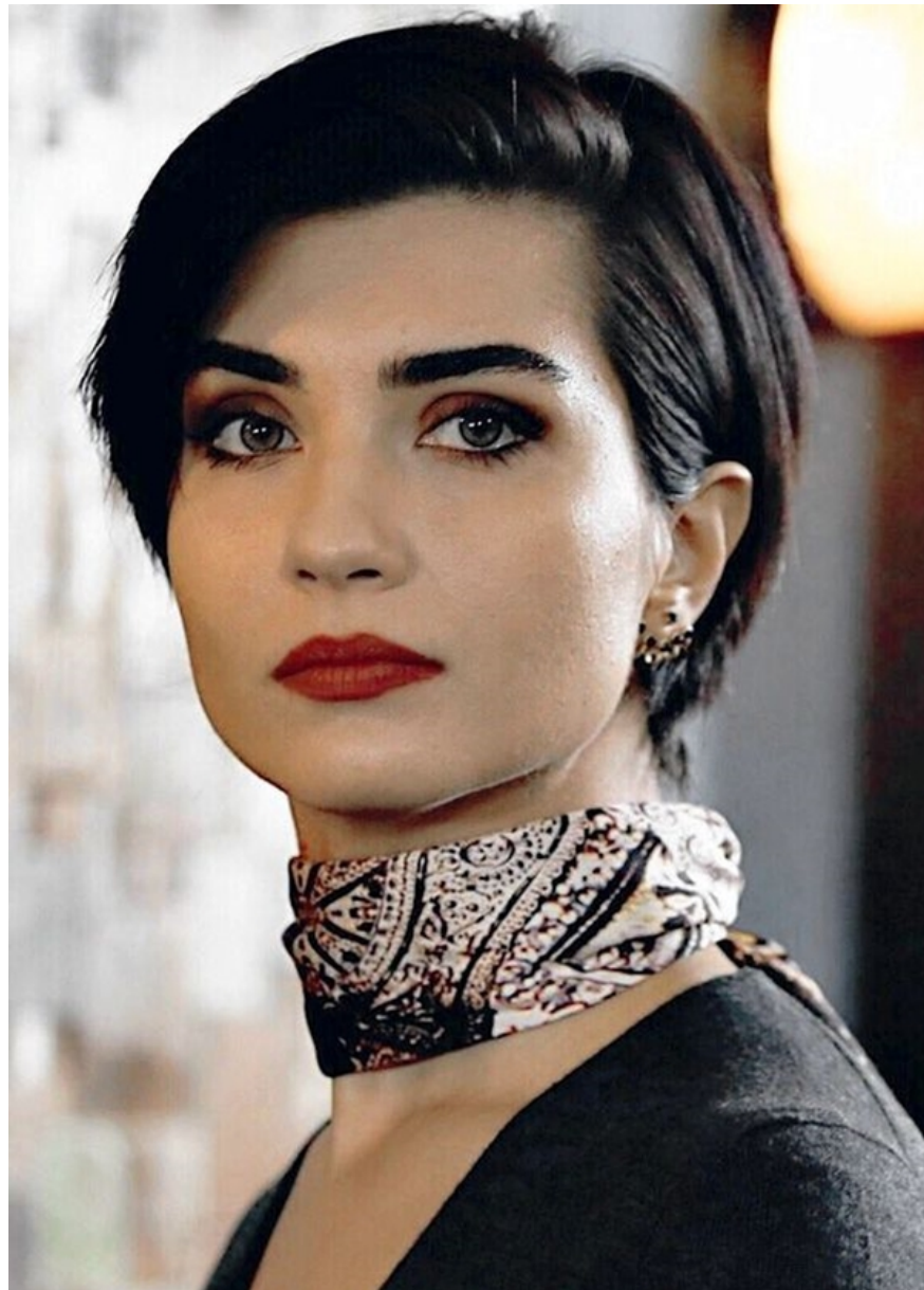
Short hair for the most beautiful female