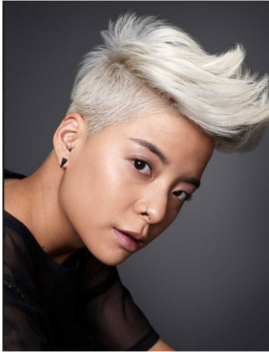
Very tomboyish hair