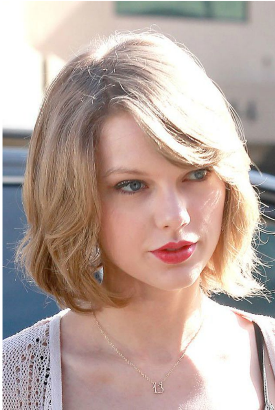
Lovely short curly hair