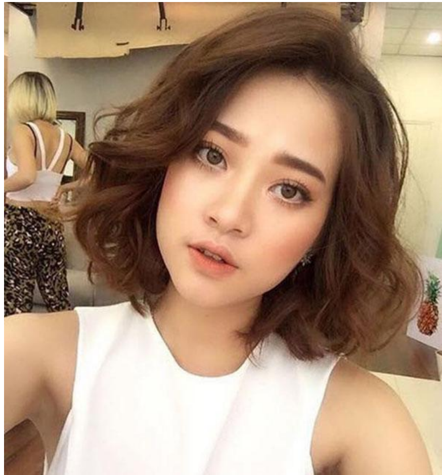
The most beautiful short hair styles for women