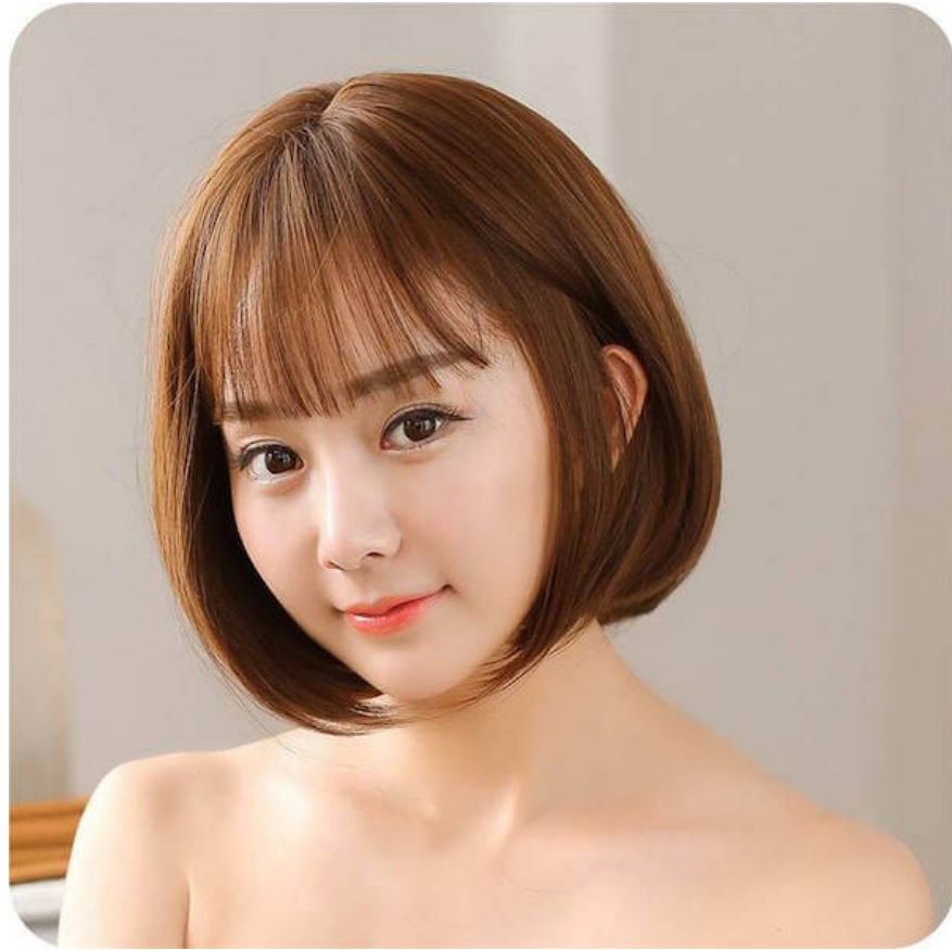
Short bangs are thin