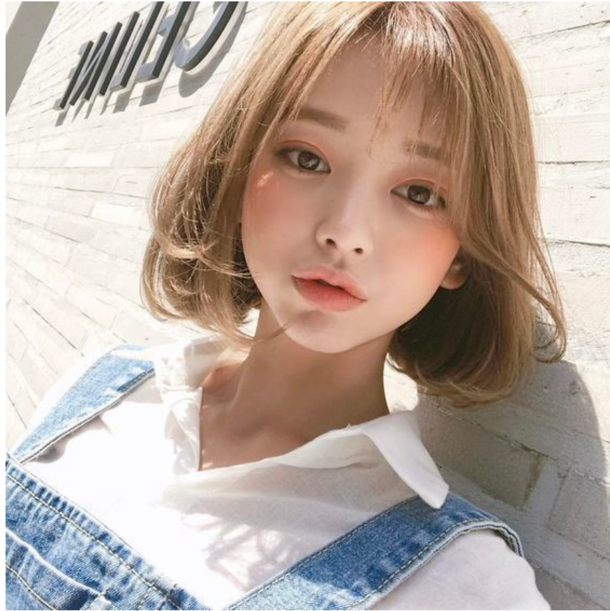
Short hairstyle with thin momentum