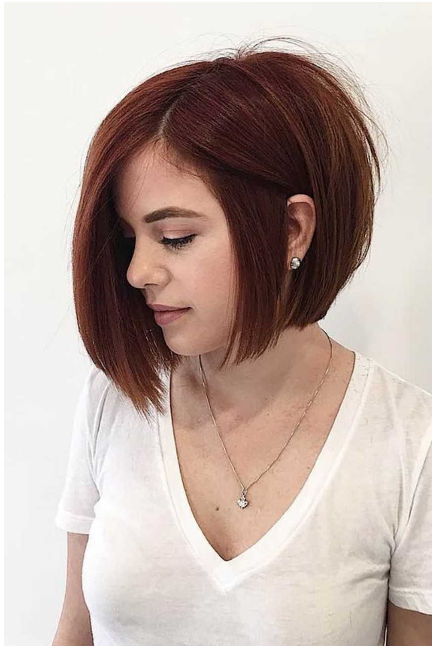
Short, puffy hair