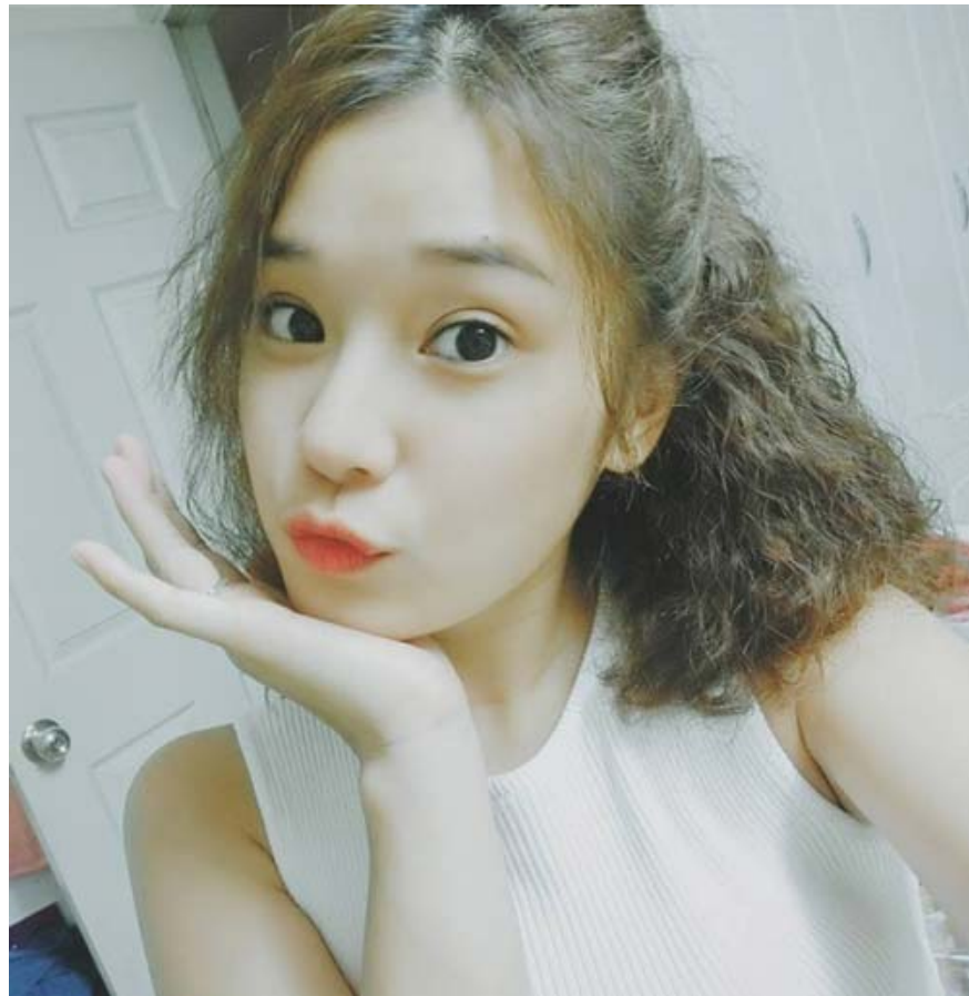
7 ways to do short hairstyles