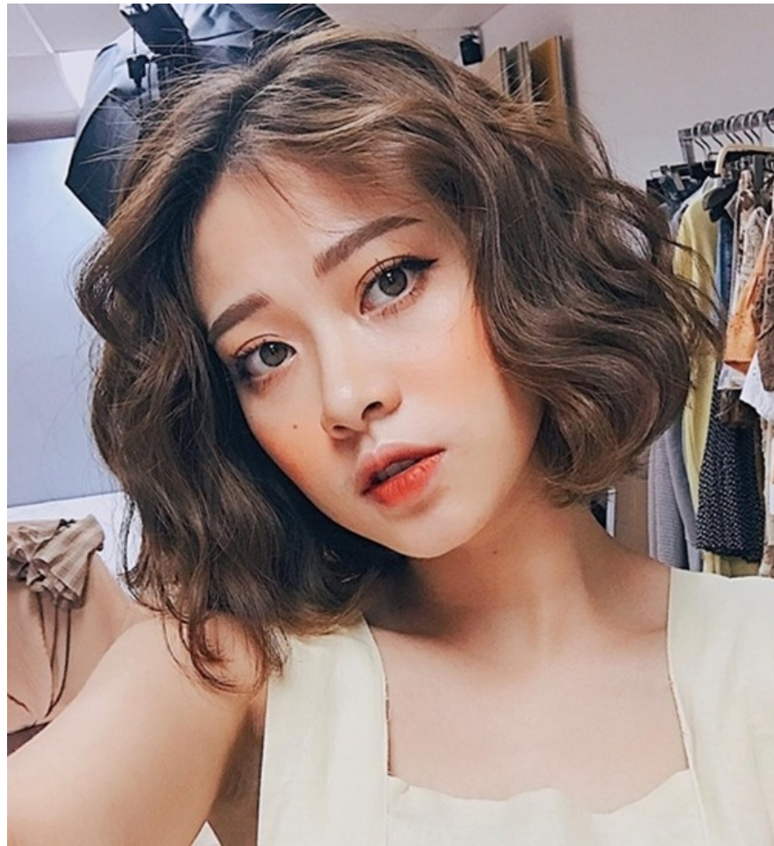
Korean style short hairstyles