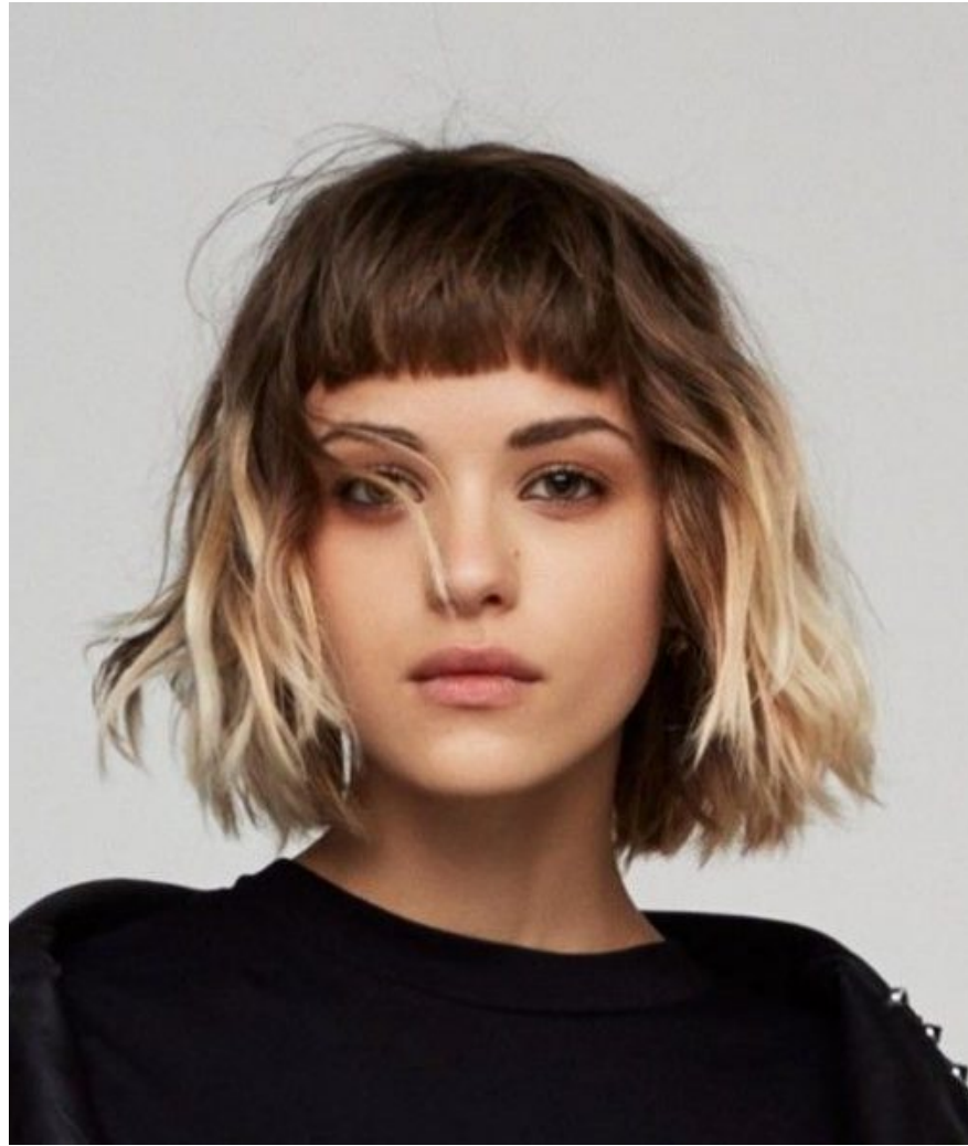
Short hair lob personality