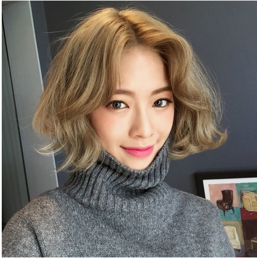
Luxurious short bobbed hair