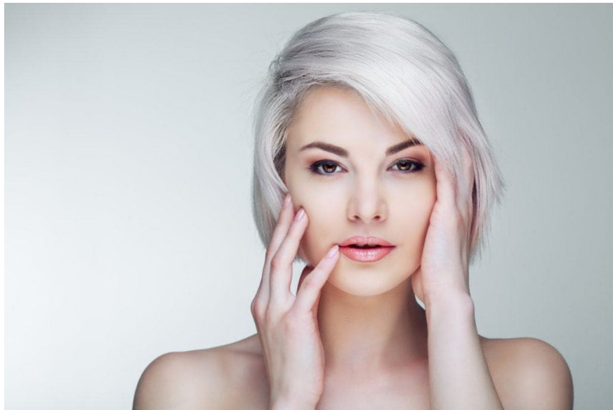
Short hair is not bang for her round face