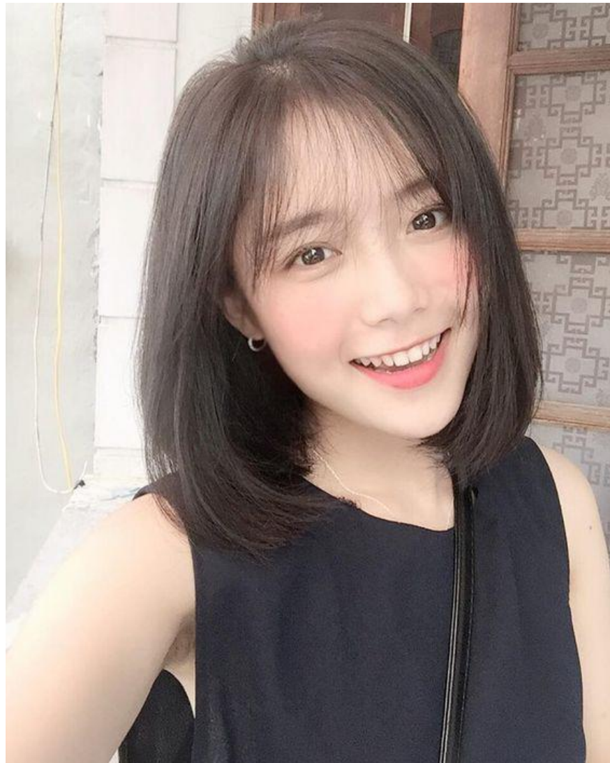
Short black hair for round face