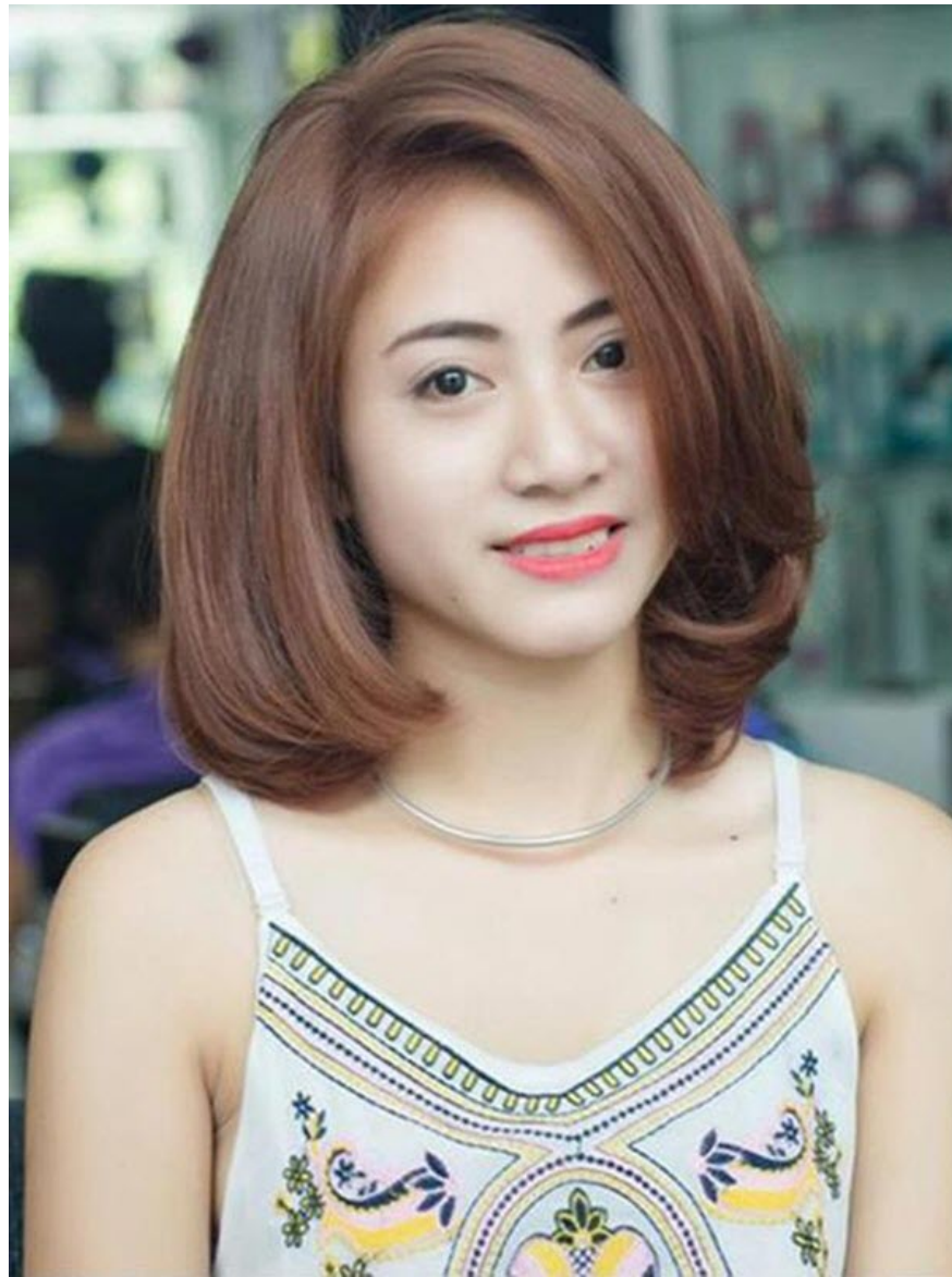
The most beautiful short hair styles for women