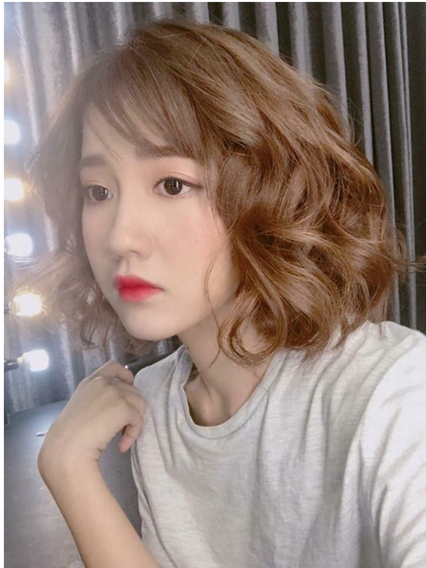
Wavy shoulder-length hair