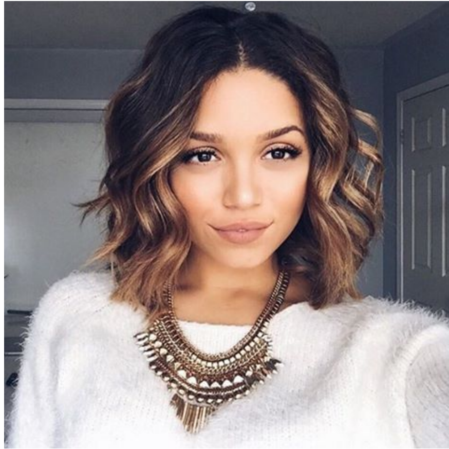
Lightly curled short bob hair