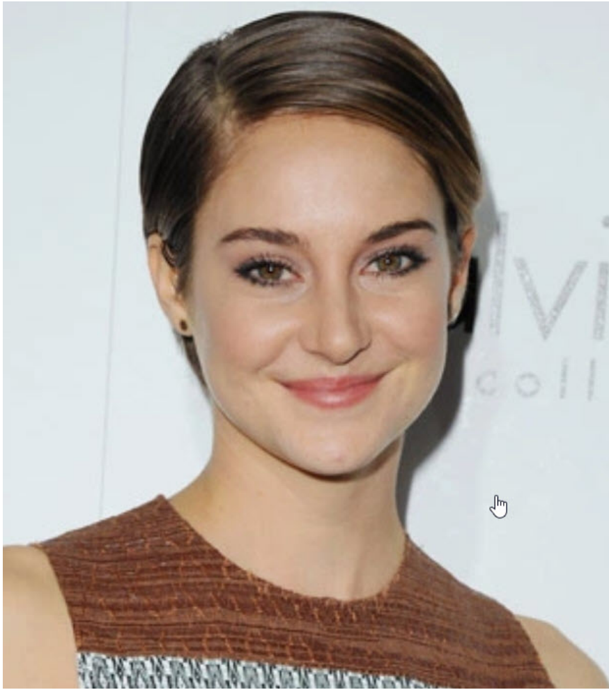
Suggestions of 6 short hair styles that suit your face long