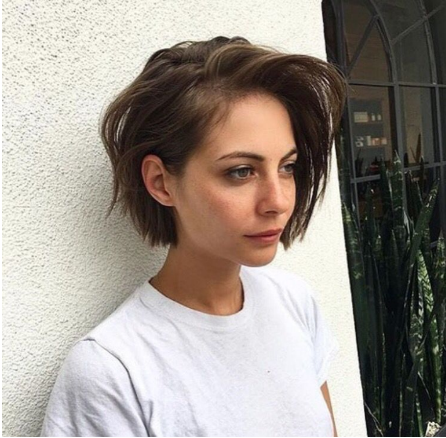
Shoulder-to-shoulder short hair