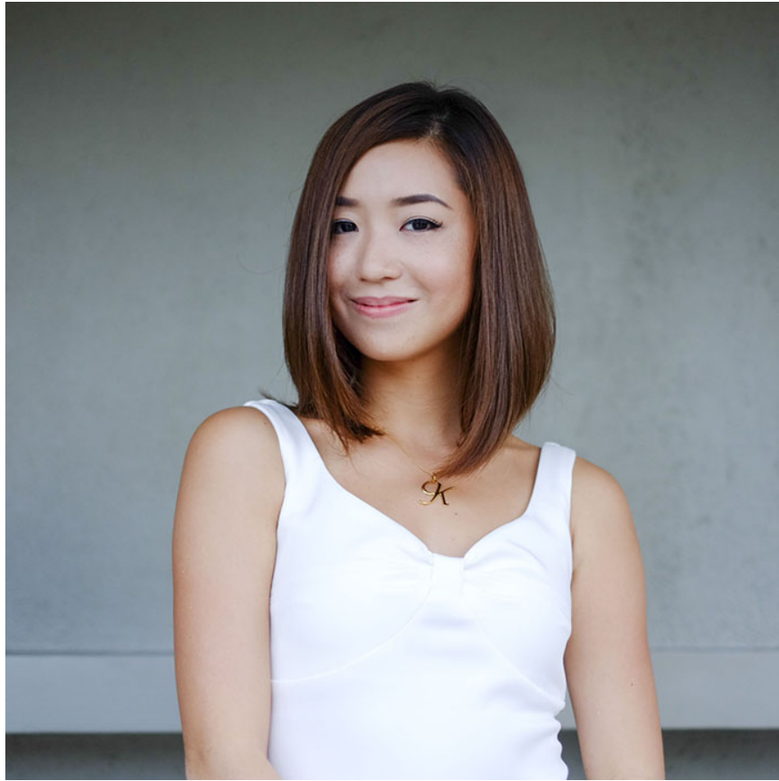
The best short hair of the year