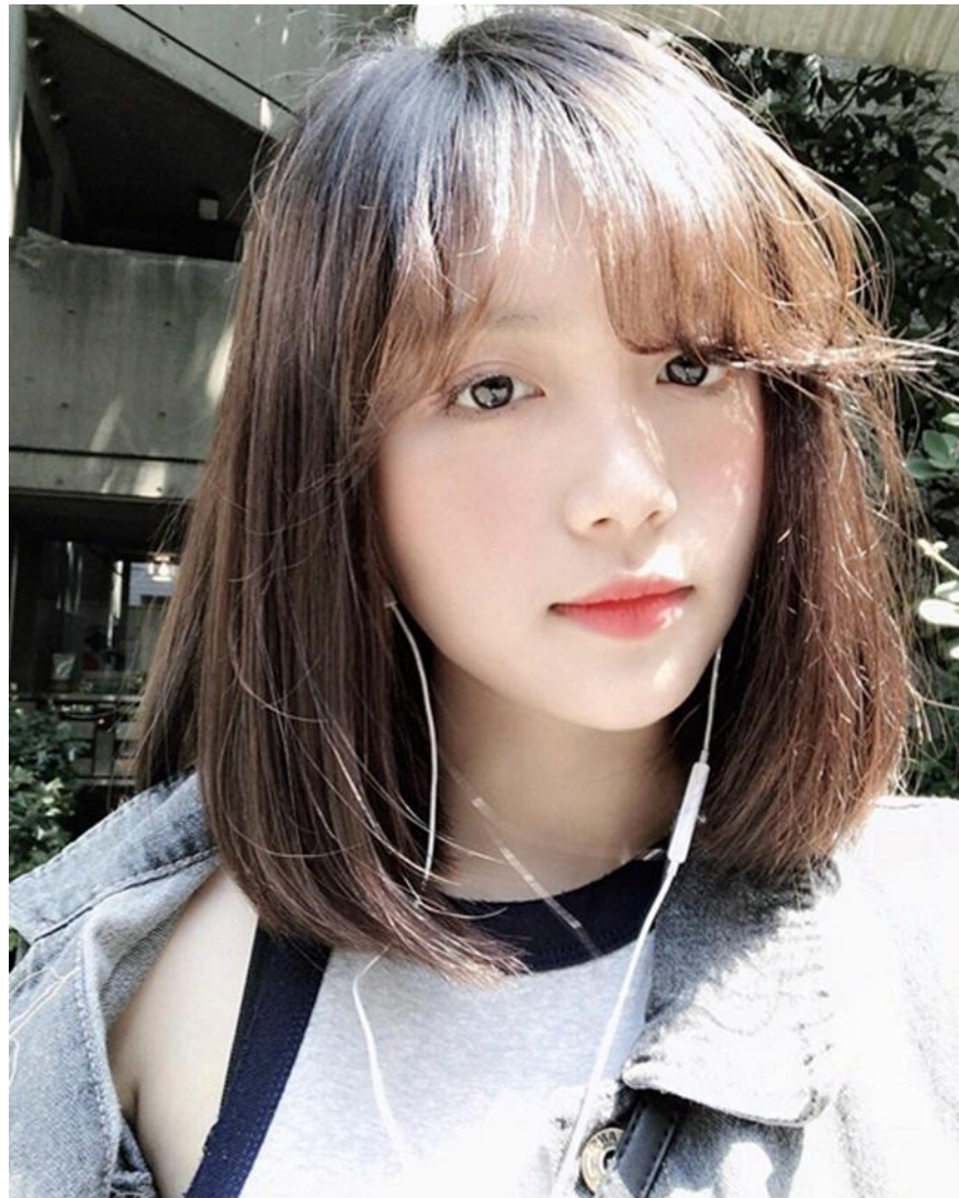
Shoulder-length bangs with curly hair