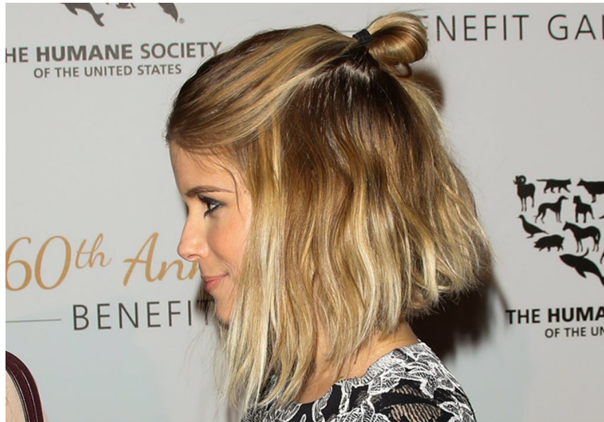
Short hair trimmed layer simple