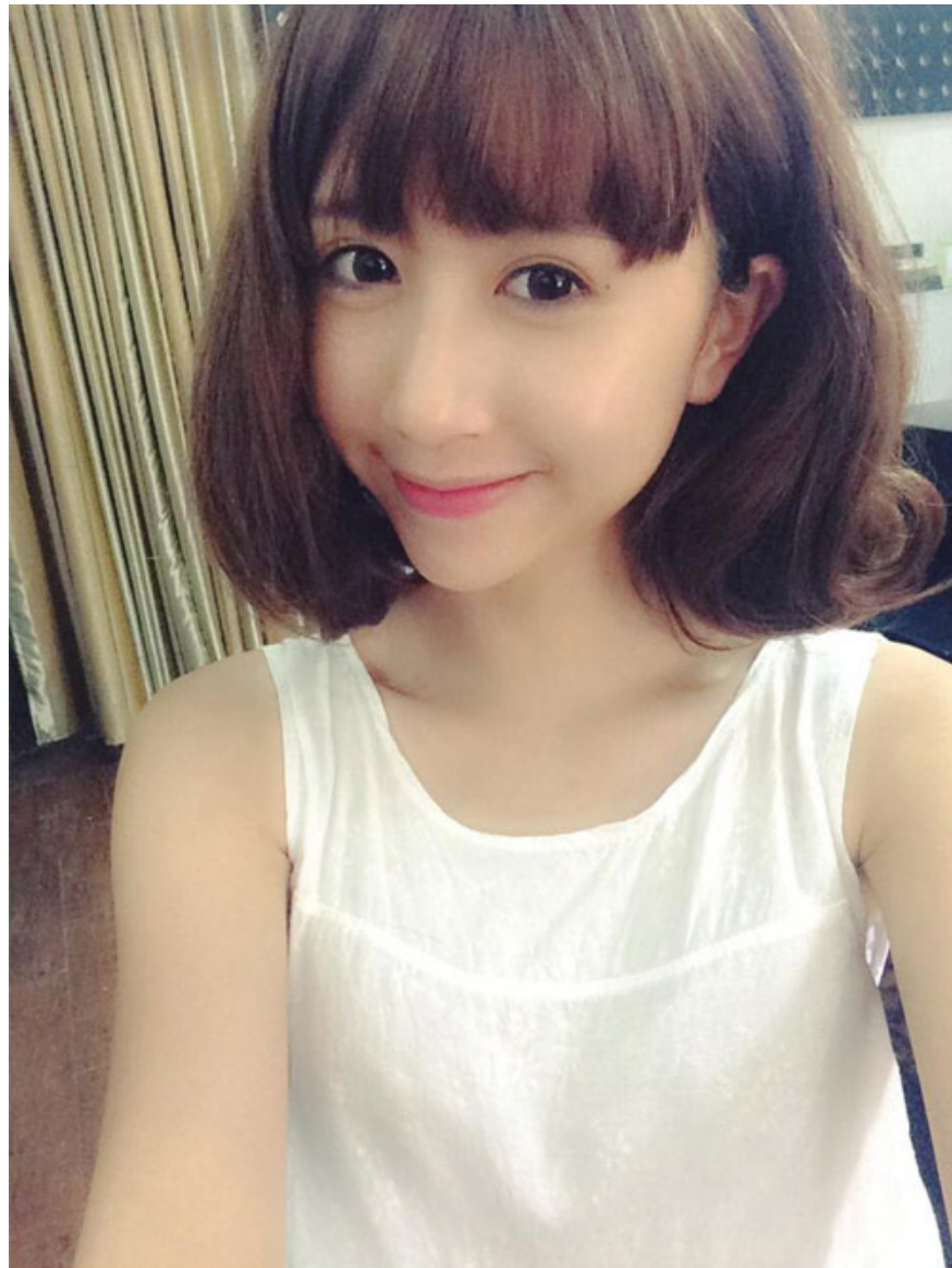
Curly hair drinking exaggerated feminine