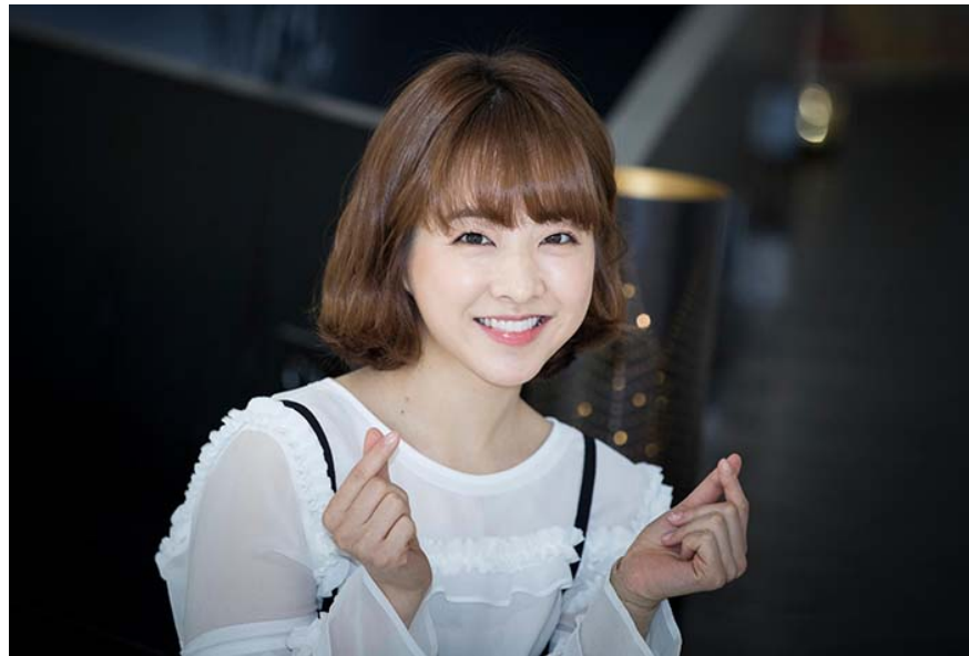
Hairstyles for women office