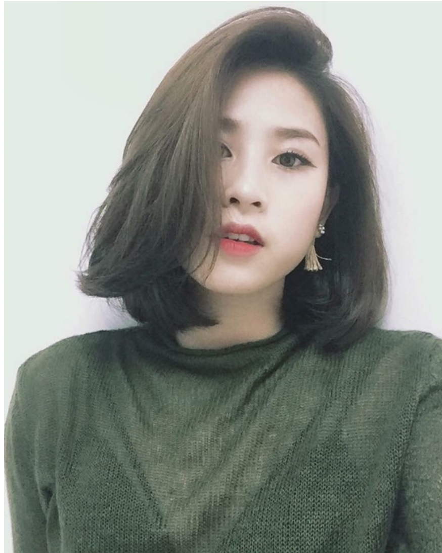
Short hair is tied to the dumpling face