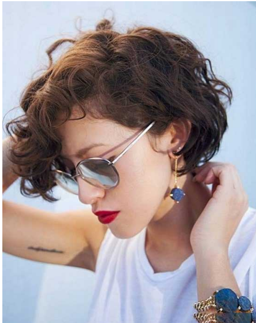
Curly short hair for women