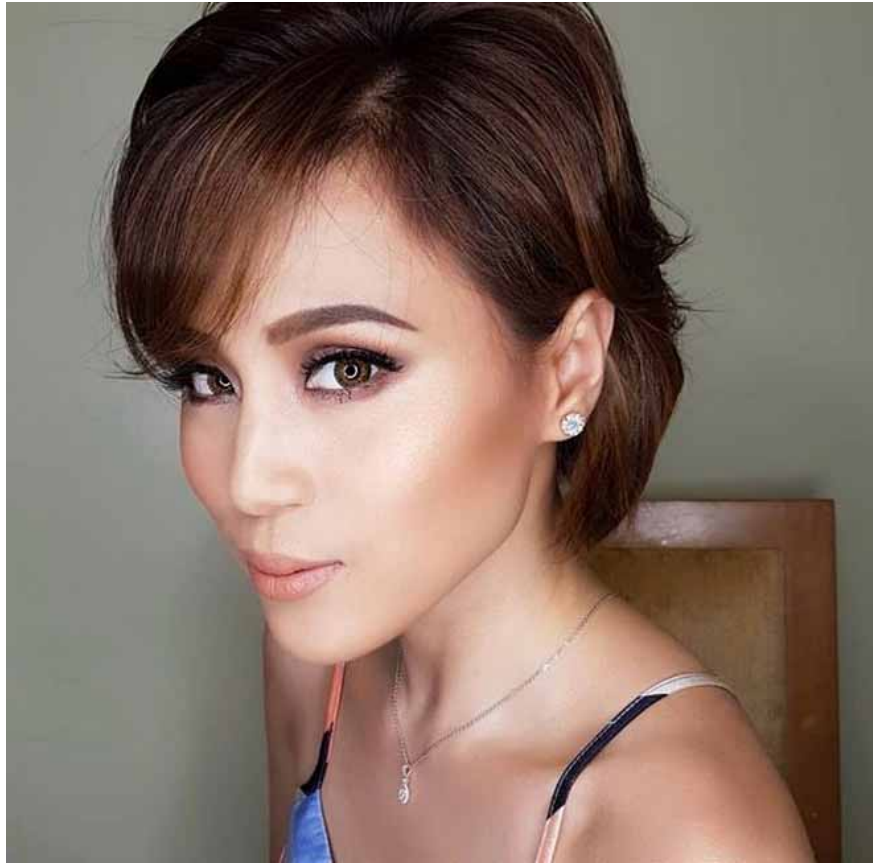
Lightly wavy short hair, feminine