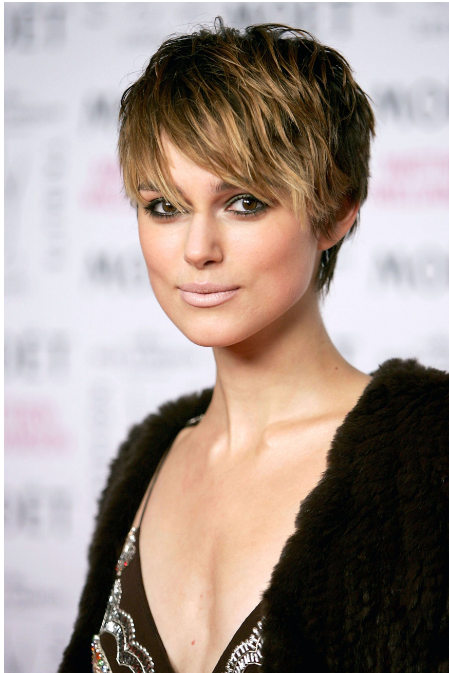
Tomboy style short hair