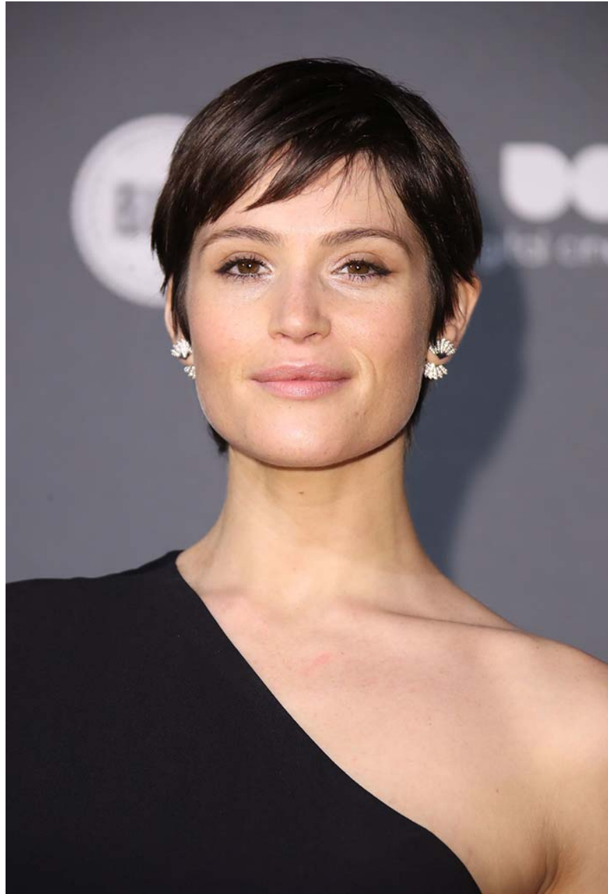
The hottest short hair models today