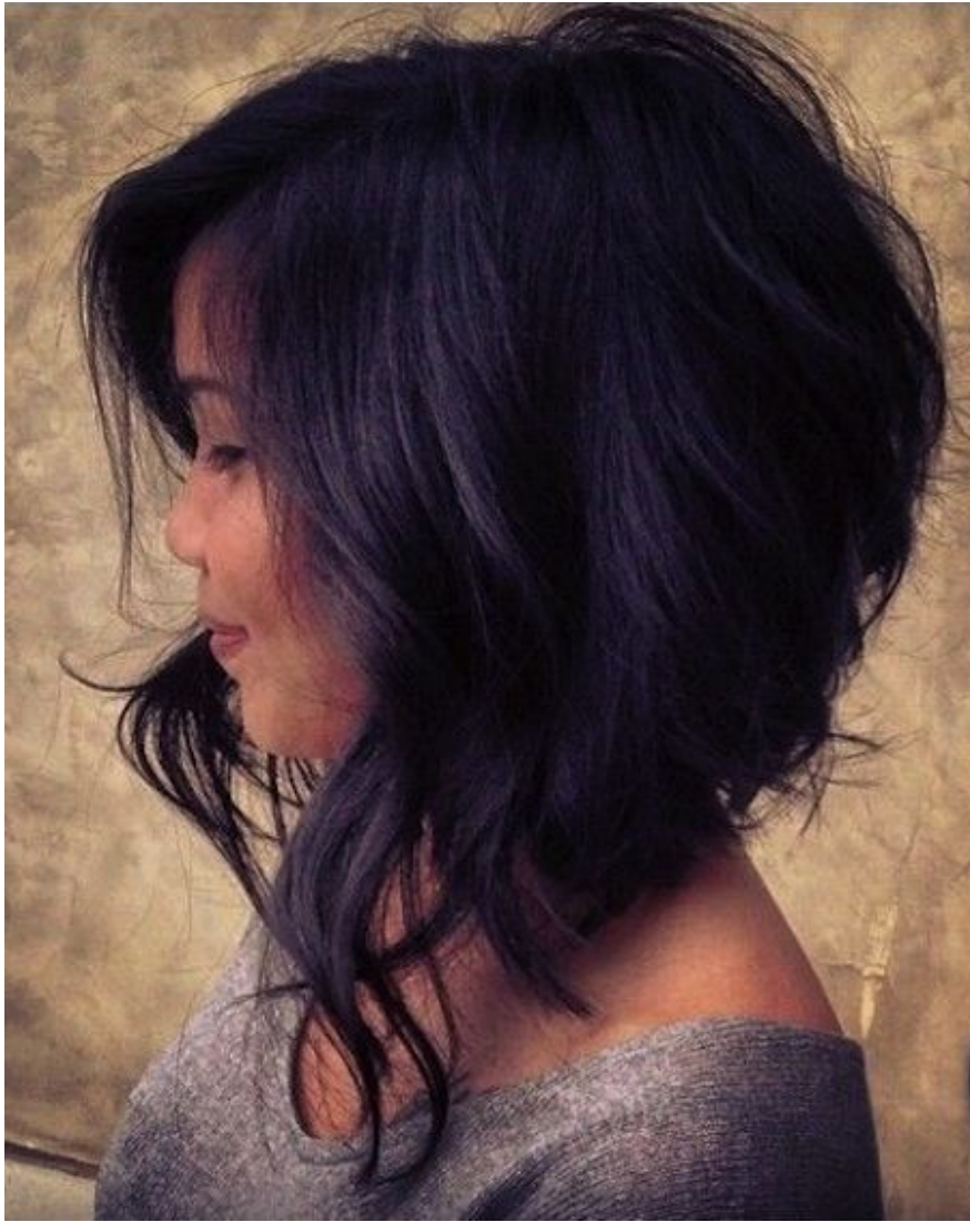
Short bob hairstyle with curly head