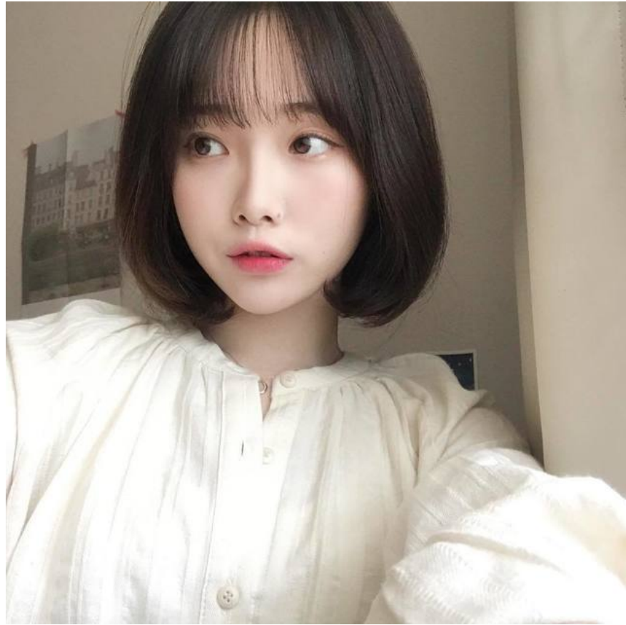
Shoulder-length hair for women