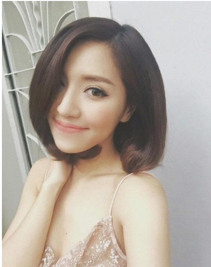
C-cut short hair feminine