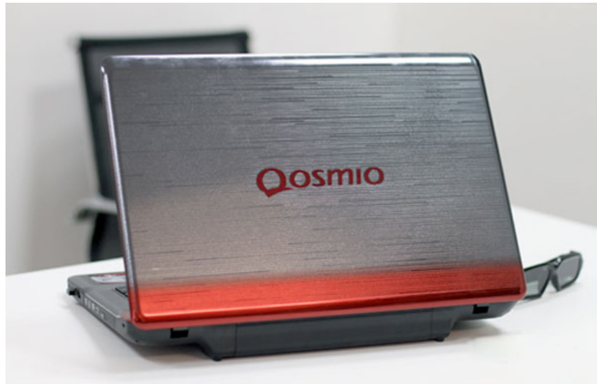
Toshiba Qosmio X770.

Unlike the "brother" F750, X770 is equipped with a larger 3D screen but must use glasses to view images and play multi-dimensional games. This model also possesses many advanced features such as Harman / Kardon speaker system, technology that converts images from normal resolution to high definition HD resolution.