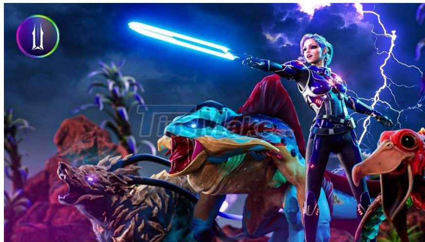
Illuvium – Expected to be well received by friends of this trend

Each Illuvial has a corresponding attribute that all have their own strengths and weaknesses. Your Illuvial becomes stronger as you win battles and complete quests.