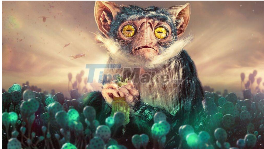
Aliens World – 5 NFT Games worth playing 2022

Alien Worlds is an NFT Metaverse spread across seven planets. The goal of the game is to earn in-game cryptocurrency, called Trilium (TLM), which can be traded for real money.