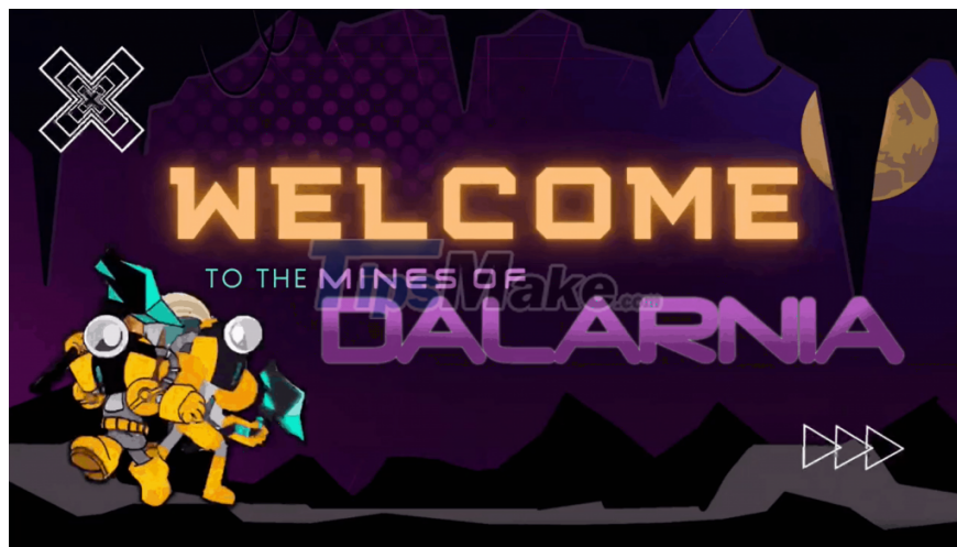
Mines of Dalarnia – 5 NFT Games worth playing 2022

Players can also team up with friends to defeat monsters, complete quests, and unlock in-game rewards.