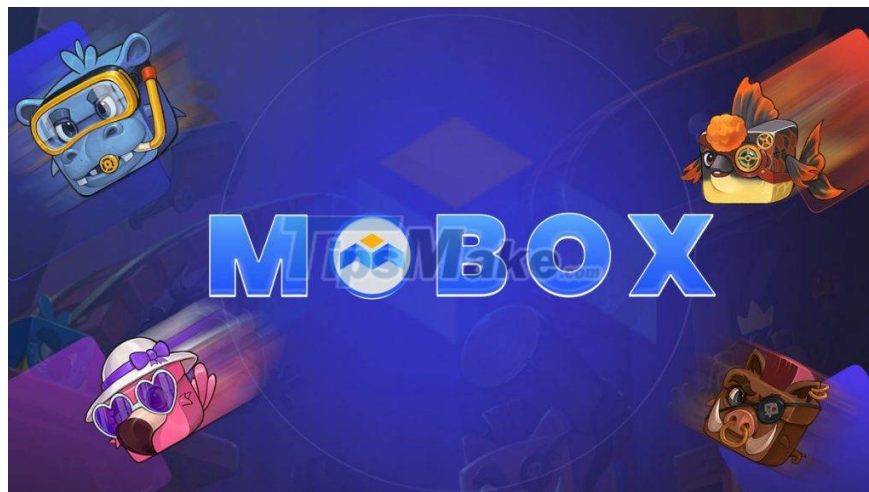
Mobox has cross-platform compatibility for your convenience

Mobox is a cross-platform GameFi metaverse that combines gaming NFTs with DeFi productivity farming. Players can obtain Mobox NFT, also known as MOMO, through the launch of the Binance NFT Mystery Box or the Binance NFT secondary market.