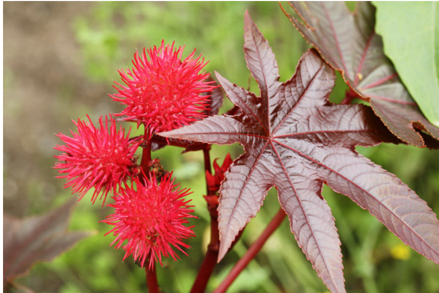
Palma Christi.

This extremely toxic plant toxin is extracted from castor bean seeds ( Ricinus communis ). Racin can kill people in extremely small amounts. Victims of poisoning will suffer from internal organ failure and heart failure because it interferes with protein synthesis and hence cell death.