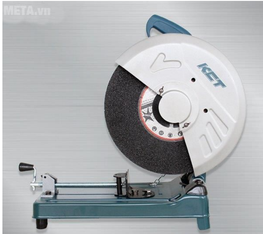
Cheap iron cutting machine KCT MOD.K1

quickly. The stand is designed to make it stand stable on the floor. The handle is plastic-coated with high friction. The stork is integrated right on the handle to bring convenience to users. Reference price: 1,650,000 VND.