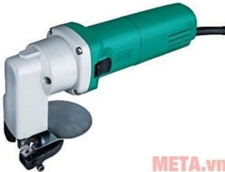
Cheap portable iron cutting machine DCA AJJ25 (J1J-FF-2.5)

DCA AJJ25 (J1J-FF-2.5) can cut many different metals such as cutting iron, cutting steel, corrugated iron, aluminum, etc. The case is made of high quality material with anti-rust, good bearing capacity, Anti-deformation when strongly impacted. The design is quite compact, very convenient for use as well as preservation. Rugged handle, made of anti-slip material. DCA AJJ25 (J1J-FF-2.5) handheld iron cutting machine has 710W operating capacity, the dam speed is 2200 times / minute. Reference price: VND 1,380,000.