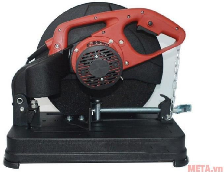
FEG 936 iron cutting machine