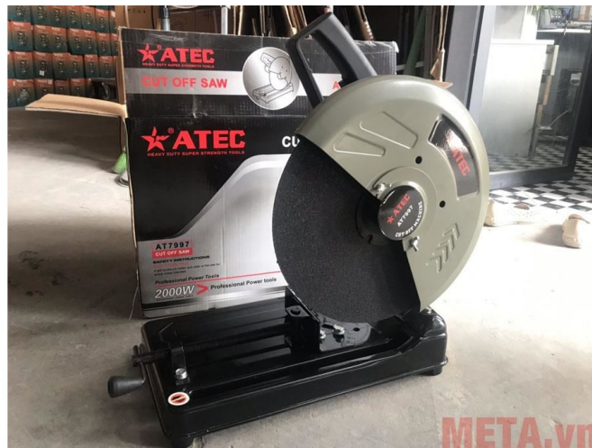
Atec iron cutting machine AT7997 355mm

Atec AT7997 desktop iron cutting machine is designed and manufactured by Atec brand. With a capacity of 2000W, no-load speed 3750 rpm, the machine can operate strongly, continuously for a long time, to help improve work efficiency. Sharp cutting blades provide fast, precise and beautiful cuts. Compact design, good anti-slip. Compact weight, easy to move. The price of Atec AT7997 desktop iron cutting machine is quite cheap, only VND 1,390,000.