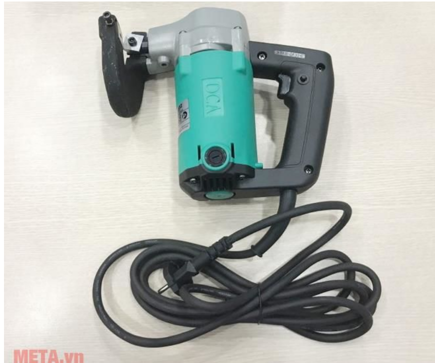
Shearing machine DCA AJJ32 (J1J-FF-3.2)

DCA AJJ32 (J1J-FF-3.2) uses brushless motor with an operating power of 620 W, idle speed of 2300 rpm. The machine is made of high-quality material so it has high durability. The grip of D-shaped design helps users to manipulate easily and without hand fatigue. In addition, the machine is equipped with additional safety latch. Reference price: VND 1,400,000.