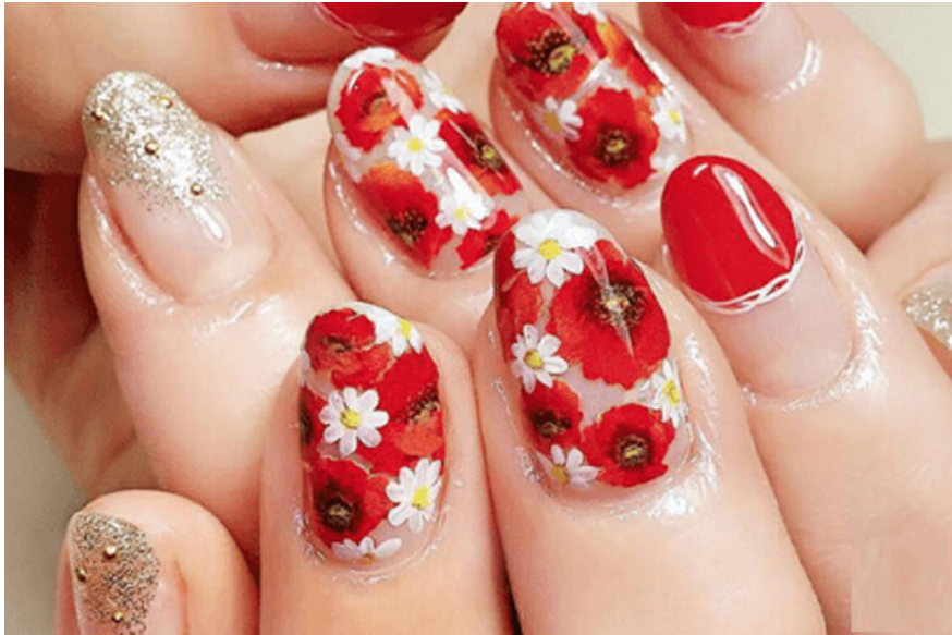
Some other beautiful nail designs