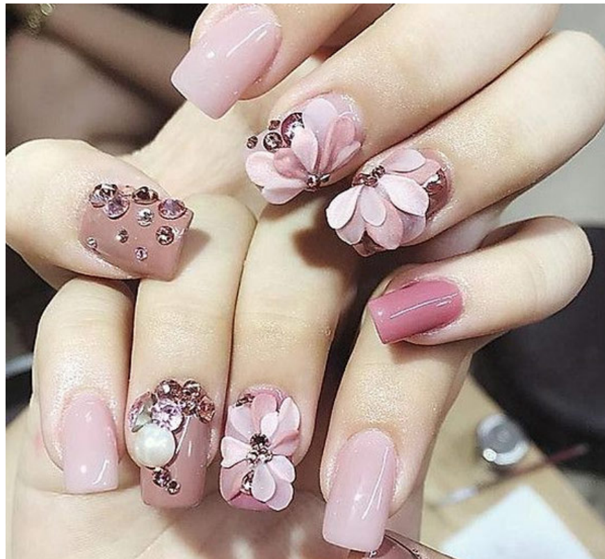
Simple yet beautiful nail designs