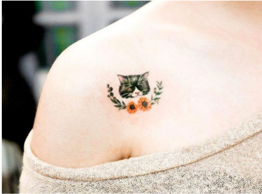
A collection of beautiful tattoo designs for women compiled from the internet.