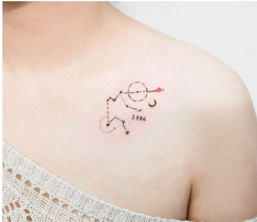
Beautiful, small shoulder tattoos for women.