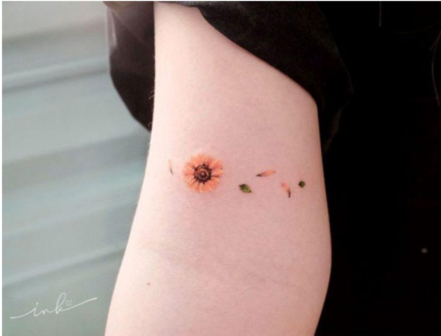
A small, pretty flower tattoo on my arm.