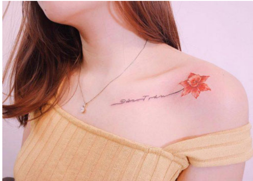
Beautiful flower tattoos on the shoulder for women.