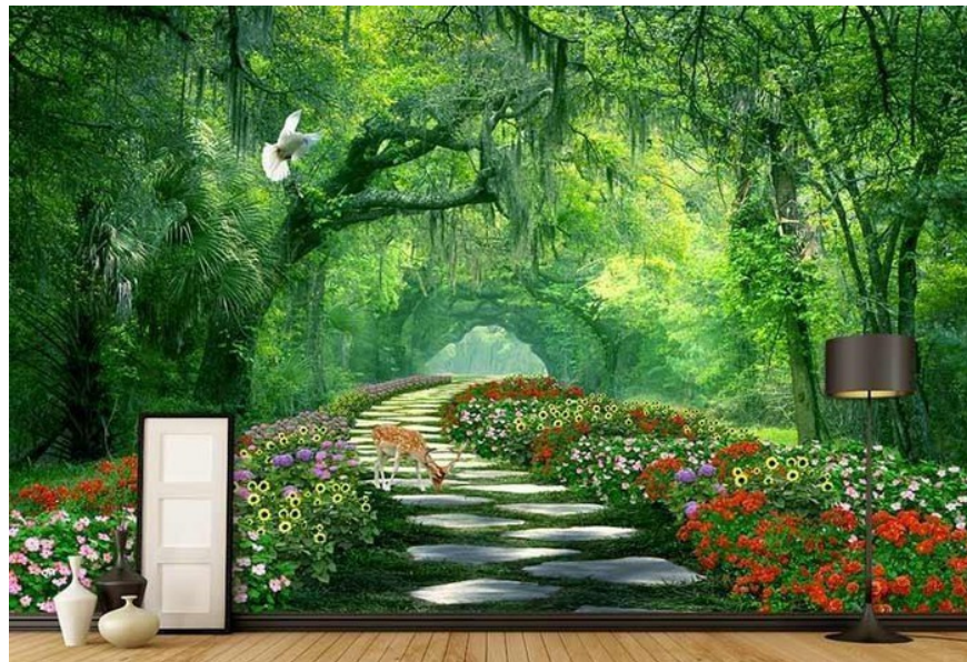
Composition is the first element of a good photo.

For example, if you want to capture a landscape on a hill, look for interesting objects around (such as a rock, a flower branch, or a dry old tree) and add it to the frame. These small details help the image look fuller and tighter.