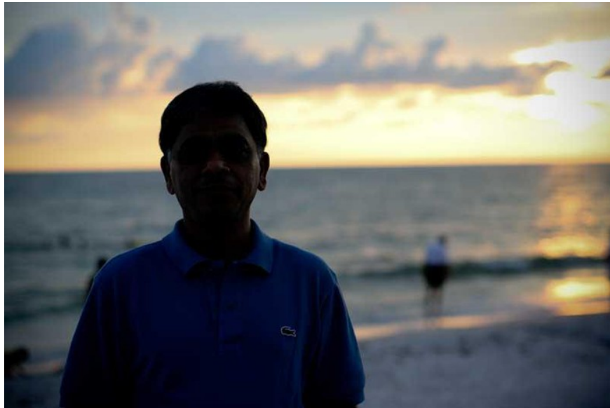
Basic error when not choosing the right point to exposure.

The iPhone 12 is designed to automatically select the point to be exposed, but in some cases, such as a shot with a bright sky and shade, users sometimes have to manually adjust the exposure position and brightness level if desired. have nice pictures.