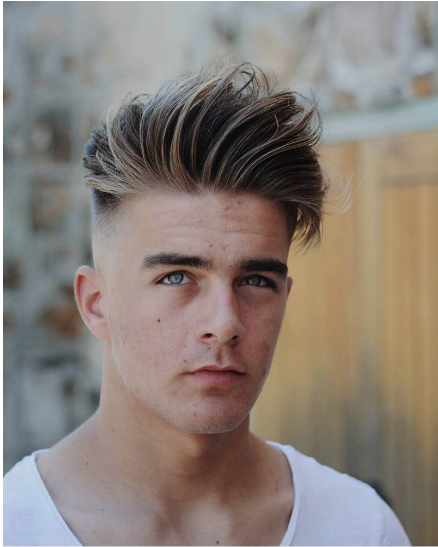
Photo of extremely unique short hairstyle for men with round faces