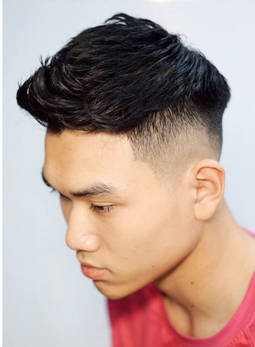
Photo of super unique short hairstyle for men with round faces