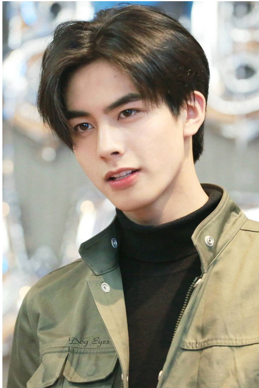
Photos of the most unique short hairstyles for men with round faces