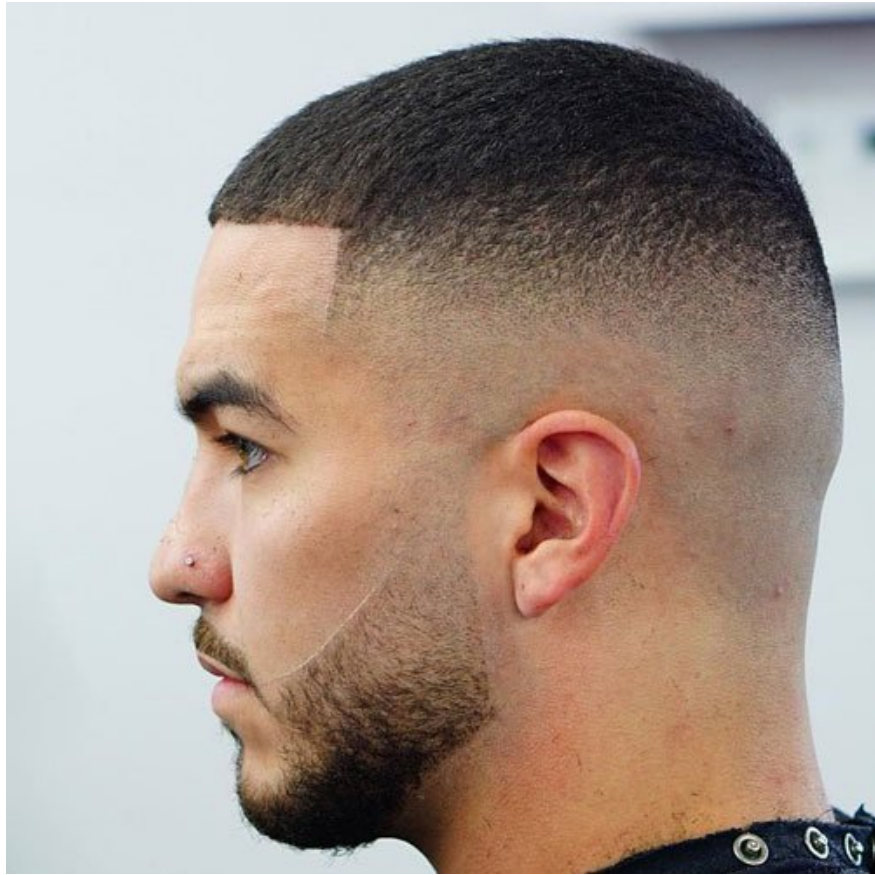
Pictures of extremely unique short hairstyles for men with round faces