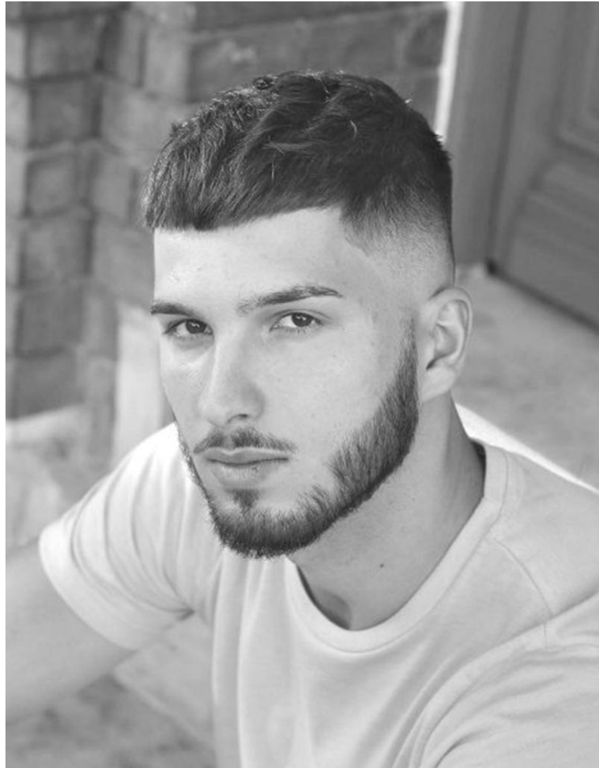
Photo of beautiful short men's hairstyle with round face