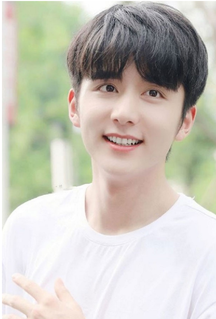
Photos of beautiful short men's hairstyles for round faces