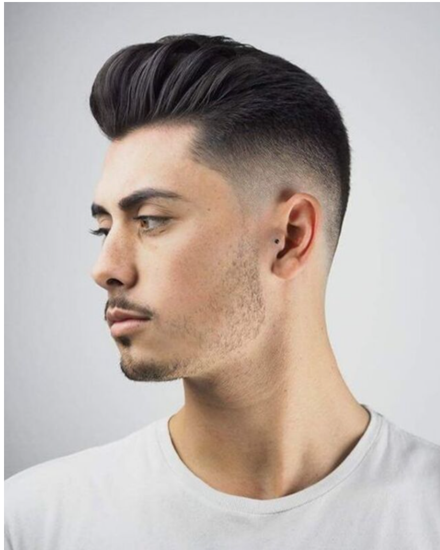
Photos of the most beautiful short hairstyles for men with round faces