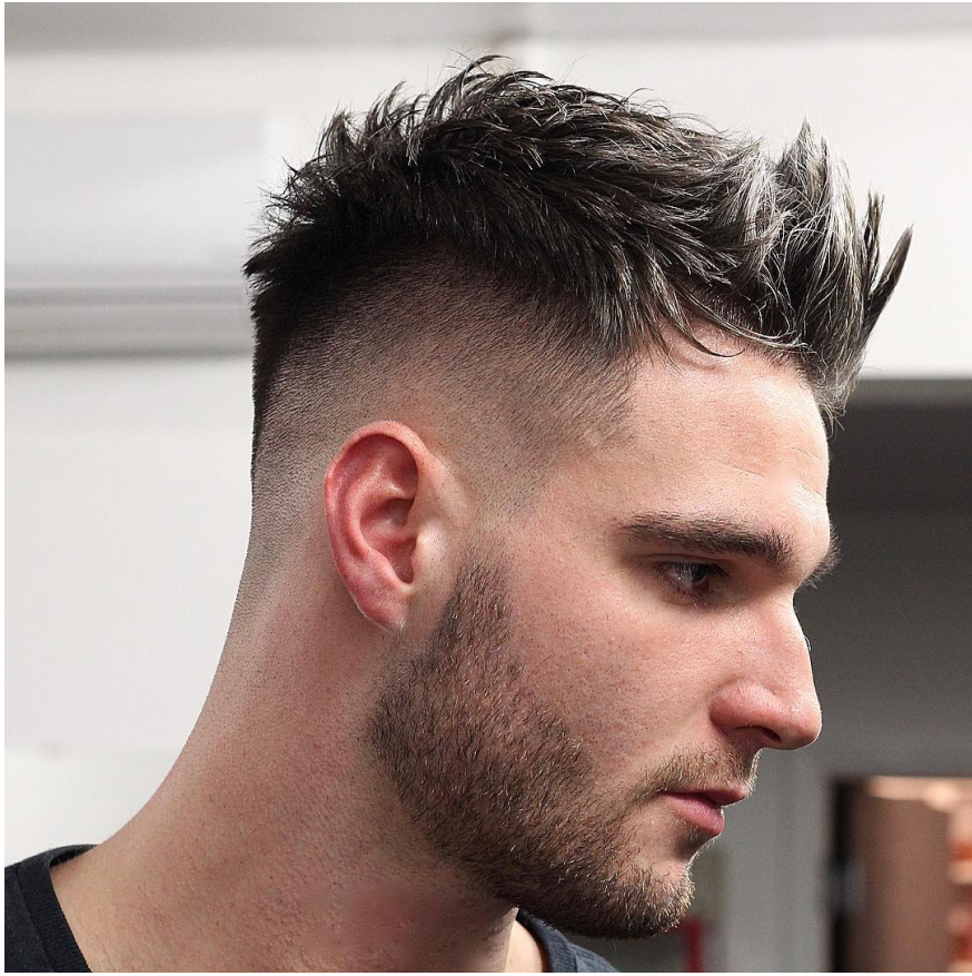
Photos of short hairstyles for men with round faces