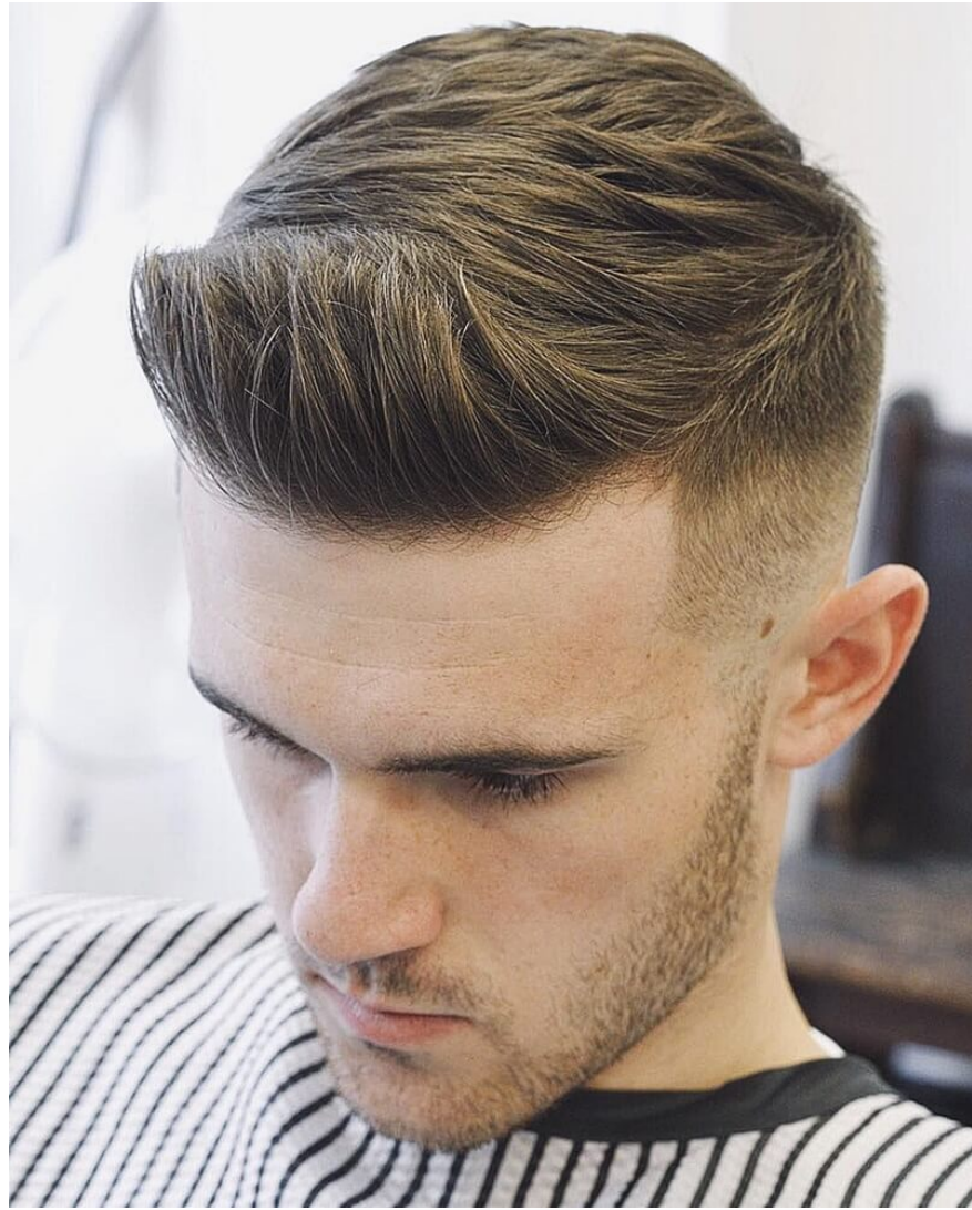
Photo of beautiful short hairstyle for men with round faces