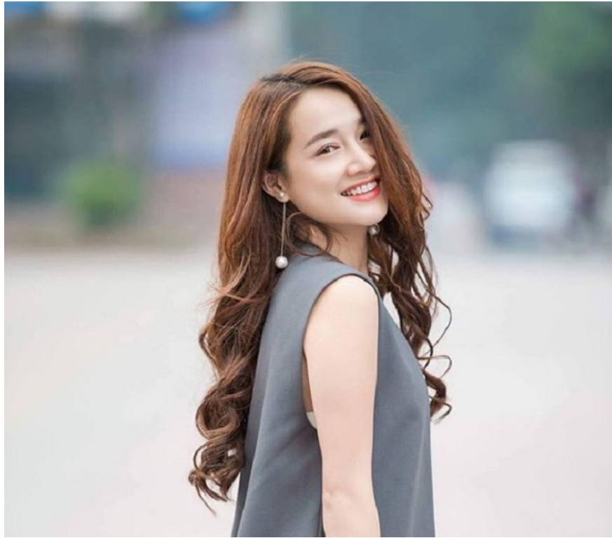
The most beautiful two-hairstyle long hair