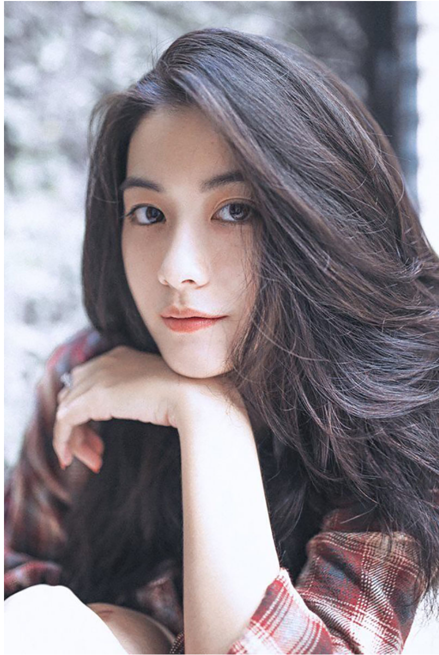
Beautiful long wavy hairstyle