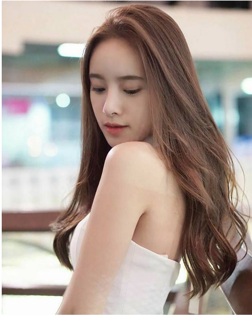
Long puffed hair