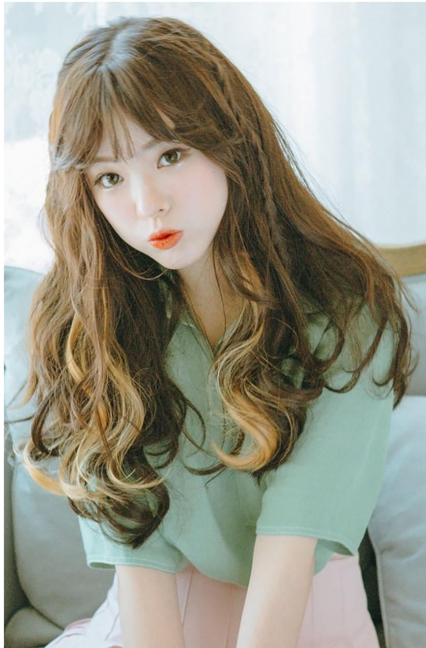
Image of long waist hair