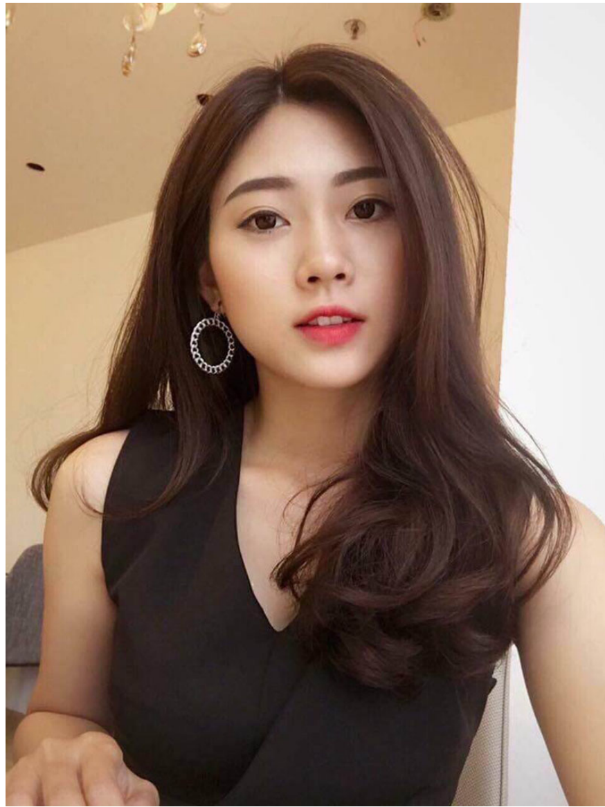
Long trimmed hairstyles