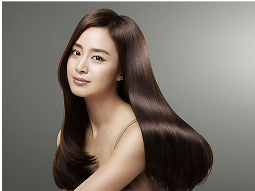
Smooth long straight hair most beautiful