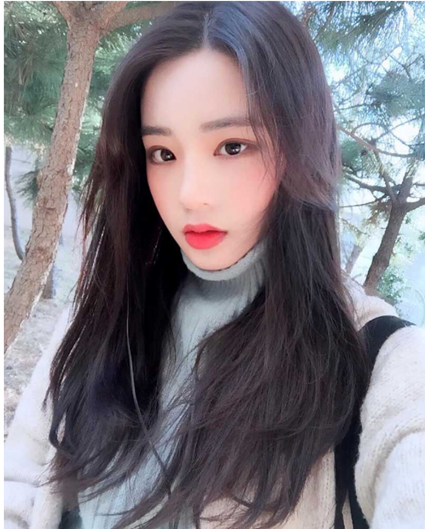
The most naturally puffy long hairstyle