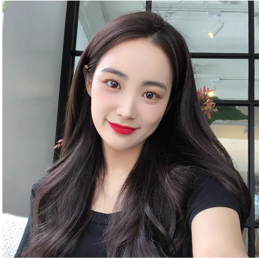
Long curly hairstyle water wave