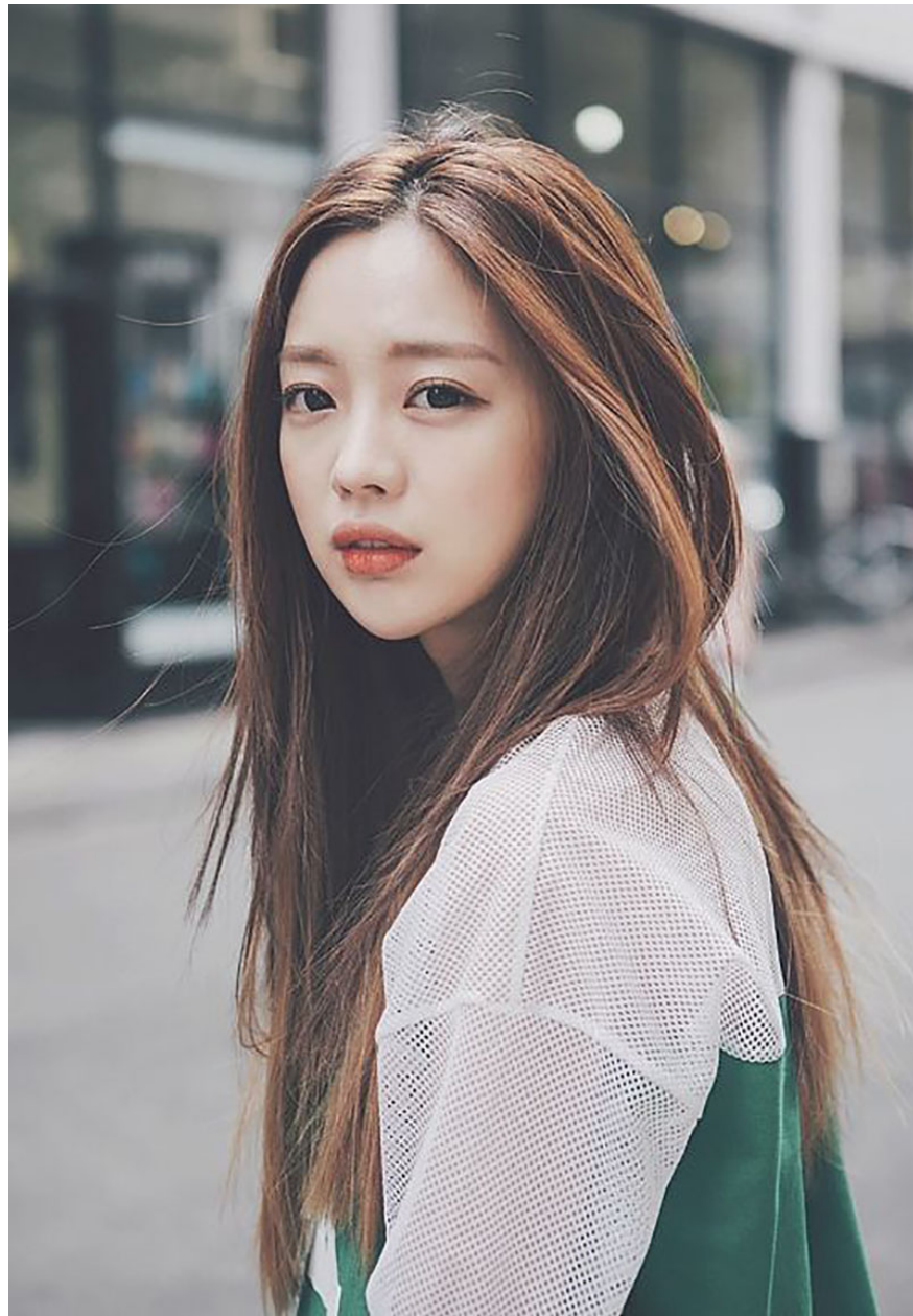
Long, beautiful back hair