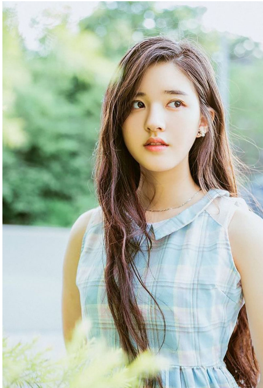
Wavy long hairstyle with bangs