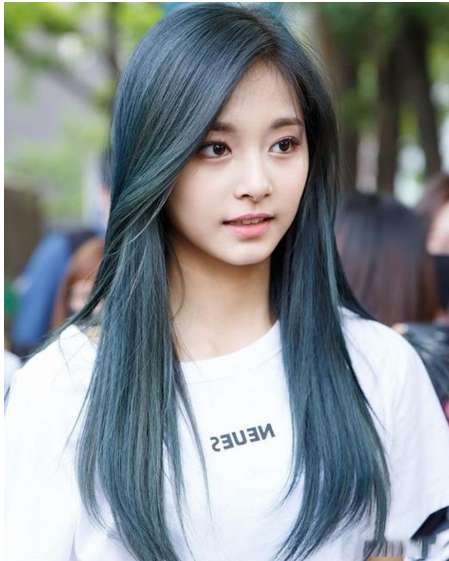
The most beautiful long hair