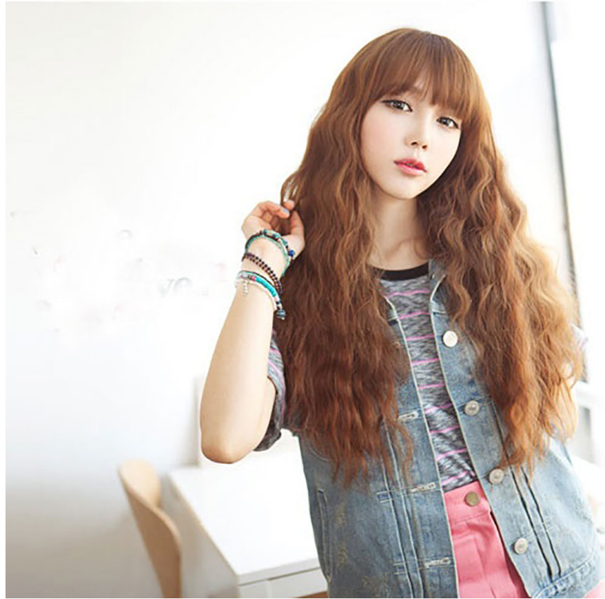
The most beautiful long curly hairstyle