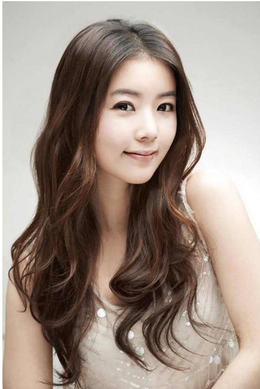
Long, wavy curly hairstyle