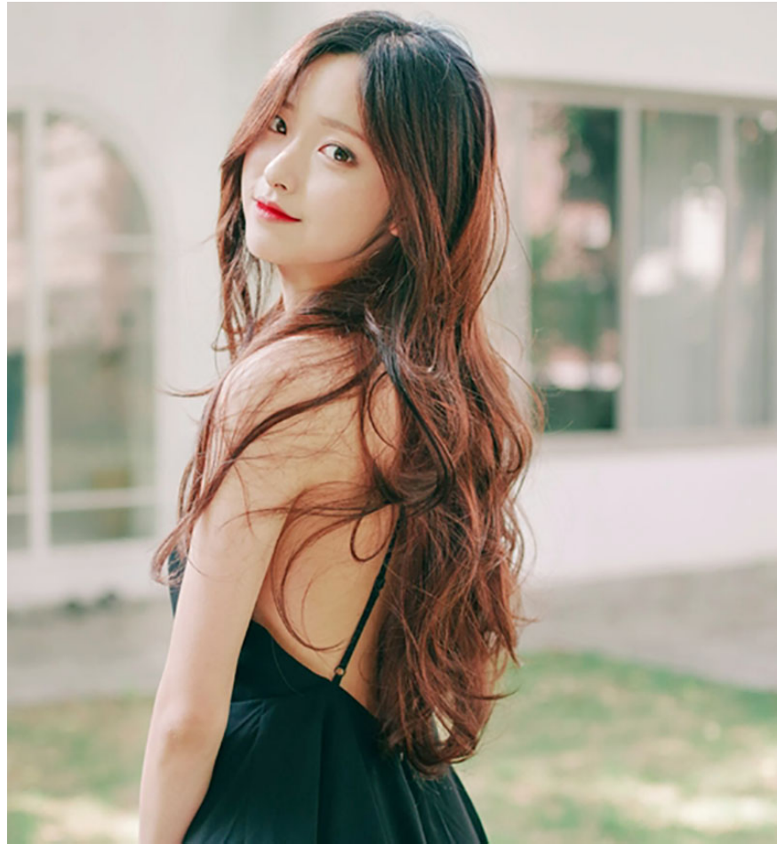
Light, wavy long hairstyle