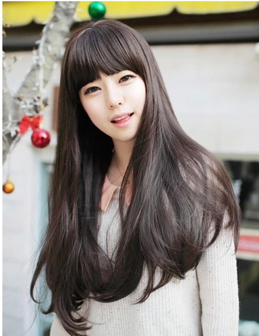
Long hairstyle stretching the tail