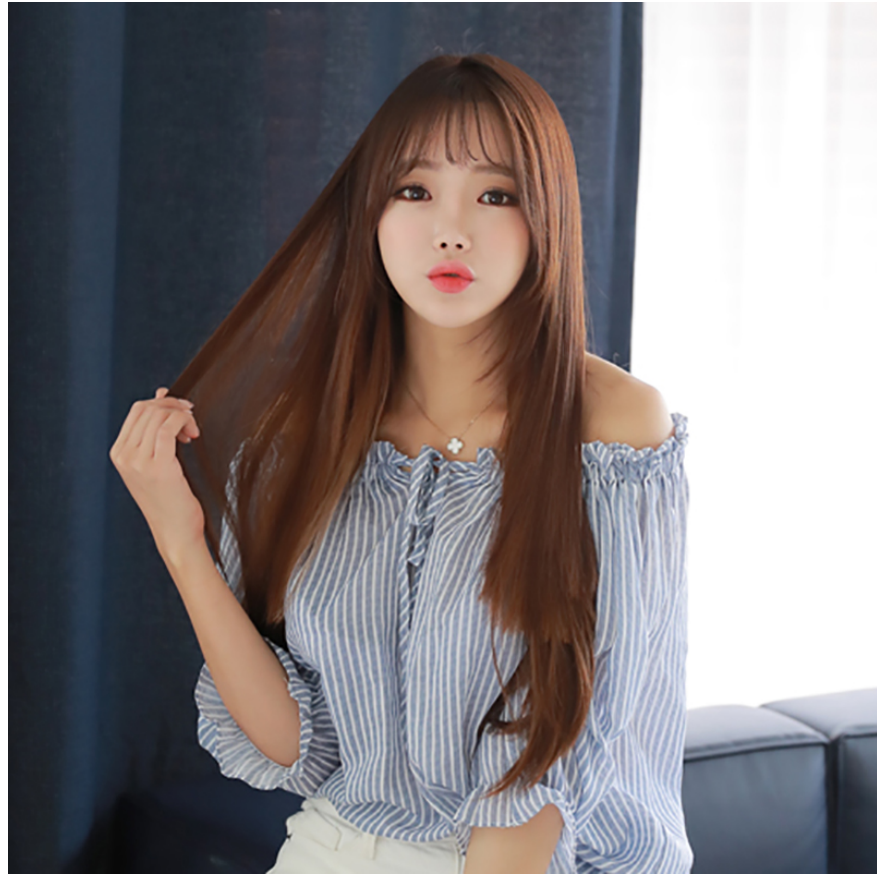
Long layered hairstyle