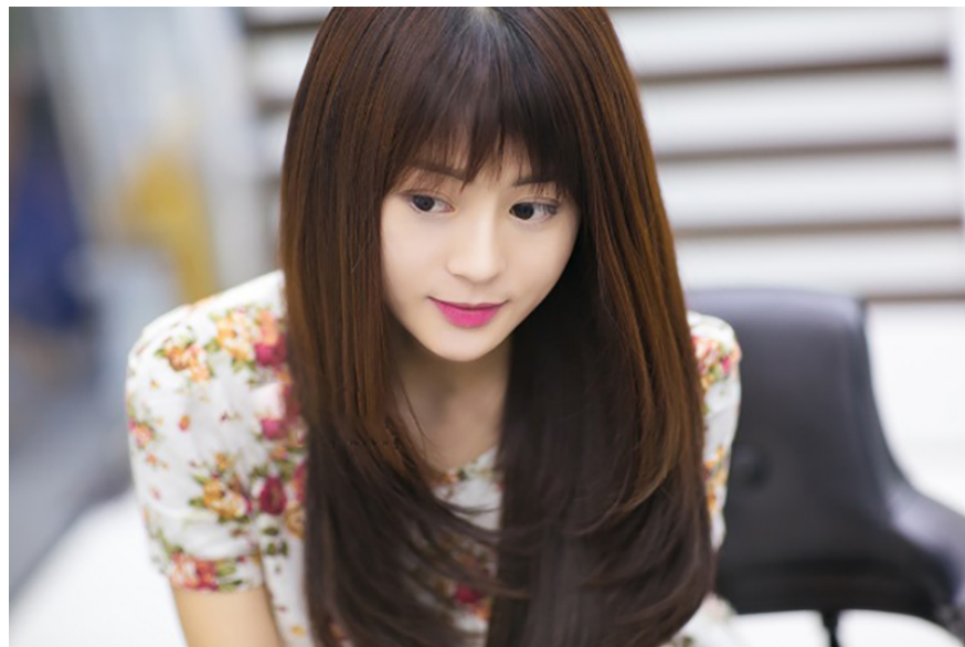
Long, slightly wavy hairstyle