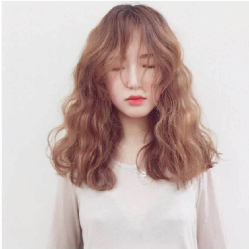
Long hairstyle with bangs