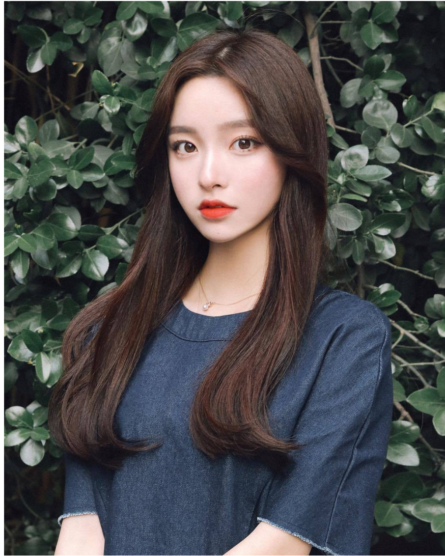
Youthful long hairstyle