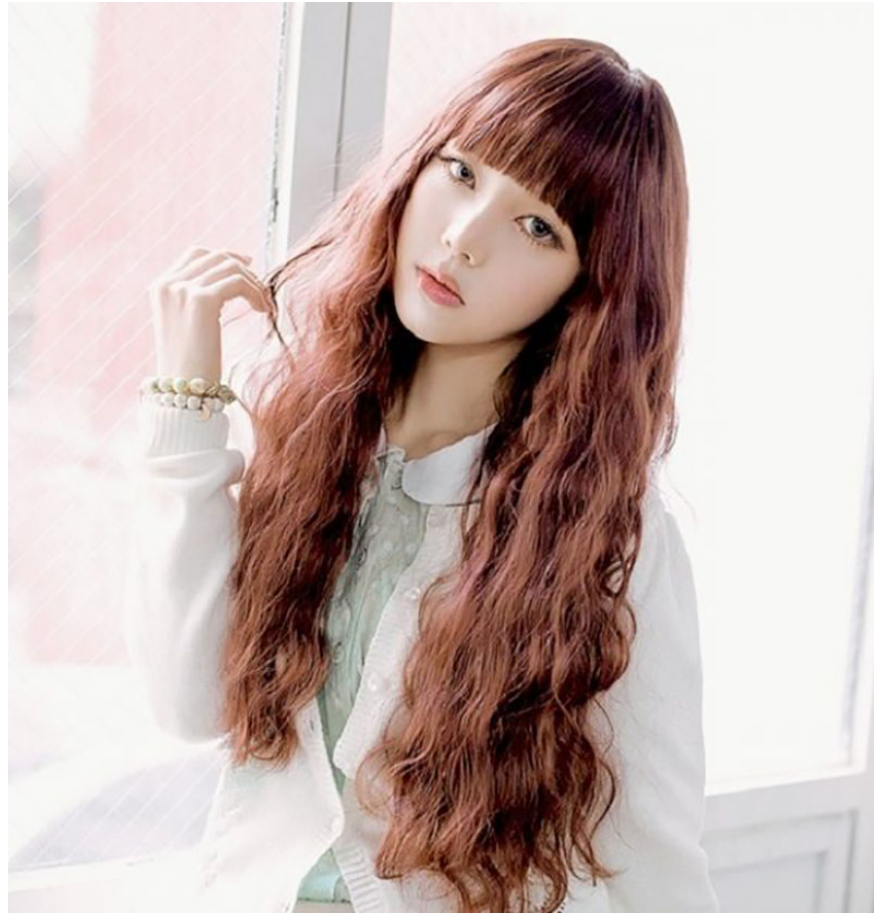
The most beautiful long back hair curling tail