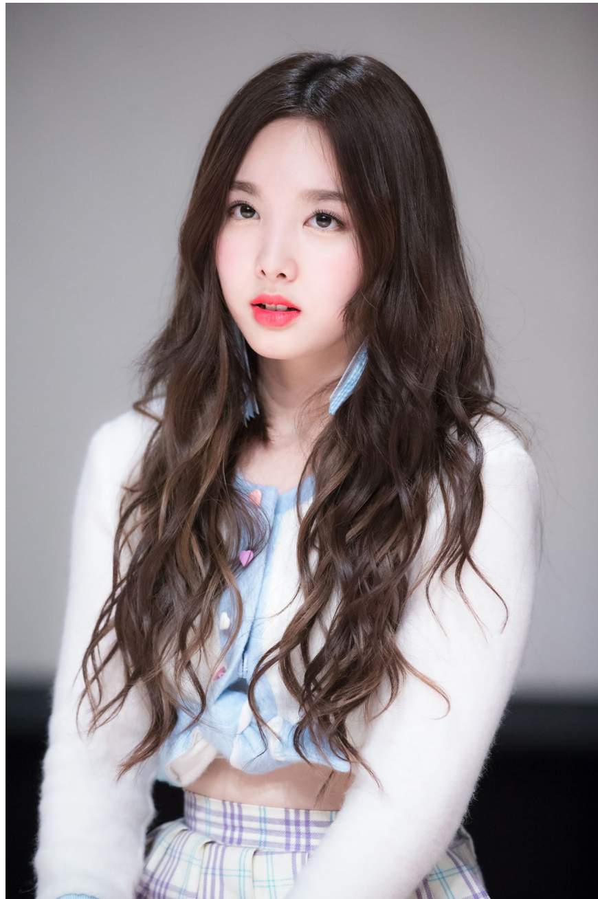
The best long hairstyle for your hair