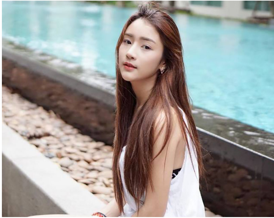
Beautiful long hair for women with round face