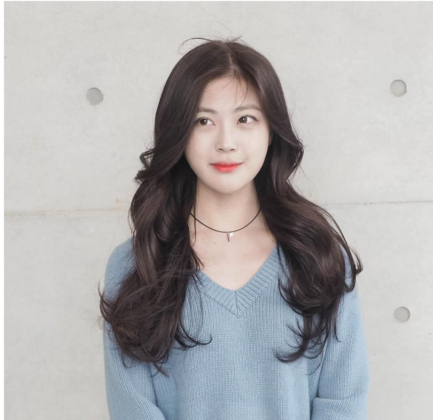
The most beautiful long curly hairstyle