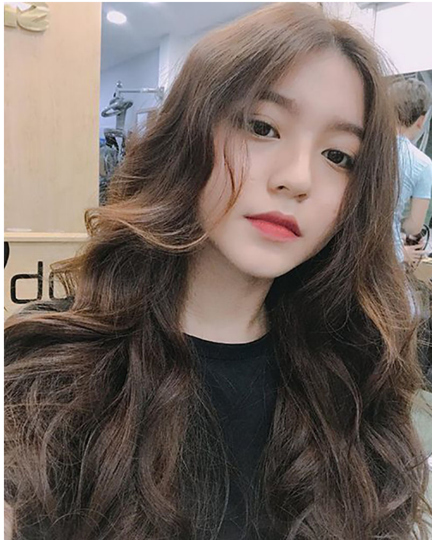
The most beautiful long hairstyle cheat age