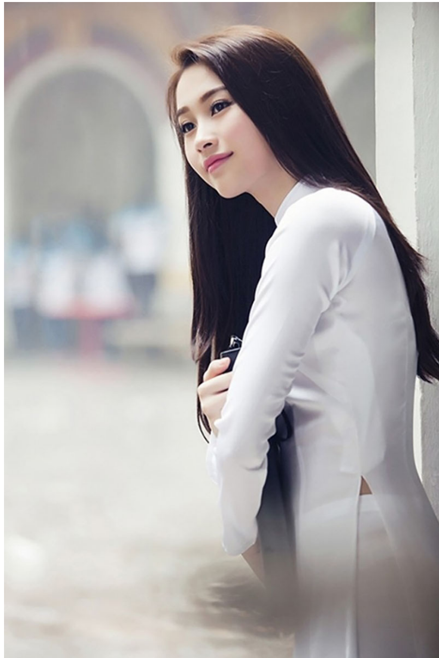
Beautiful long straight hairstyle