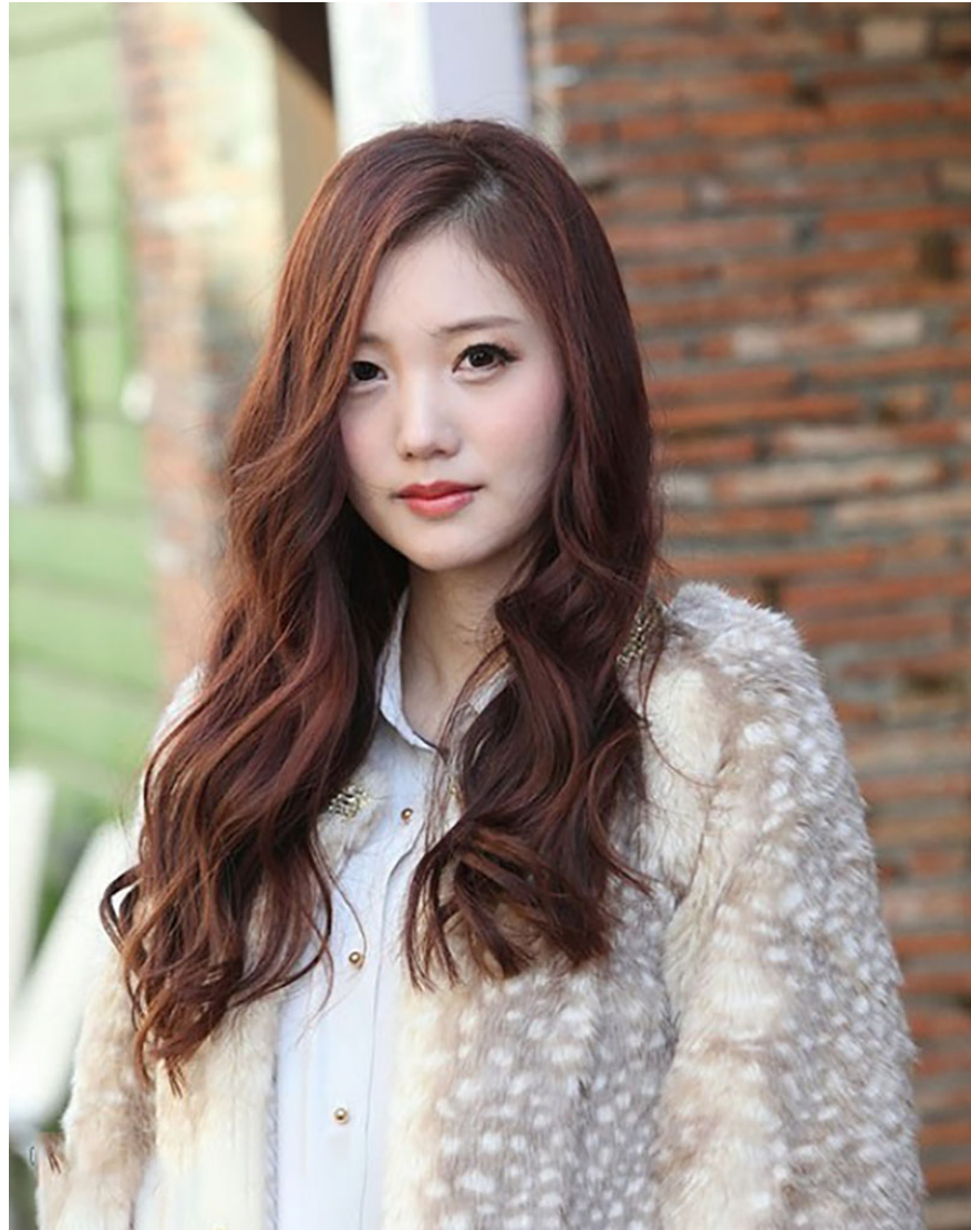
The most beautiful long curly hairstyle