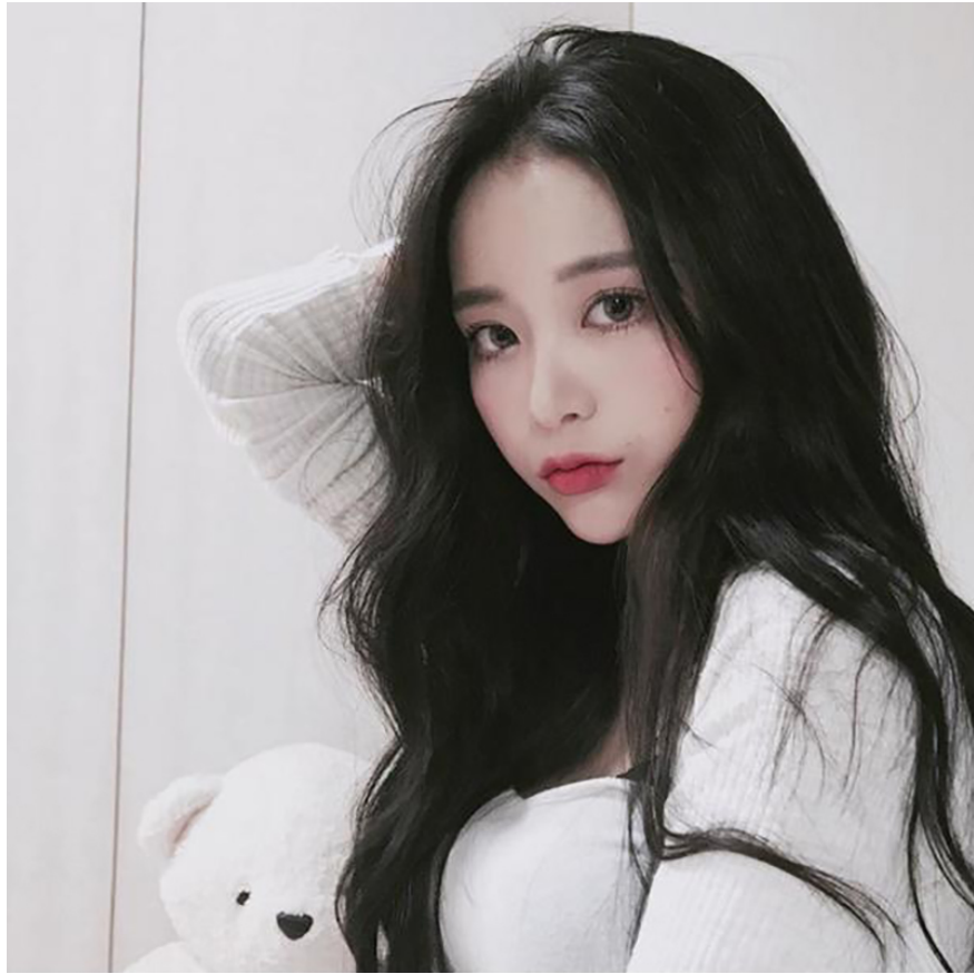
Long hairstyle stretched for a round face