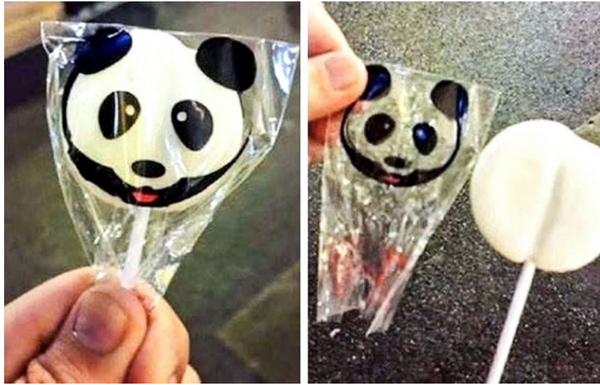
Don't believe in advertising!