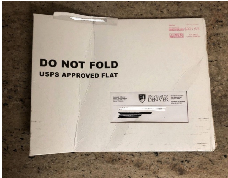
Who doesn't have this!