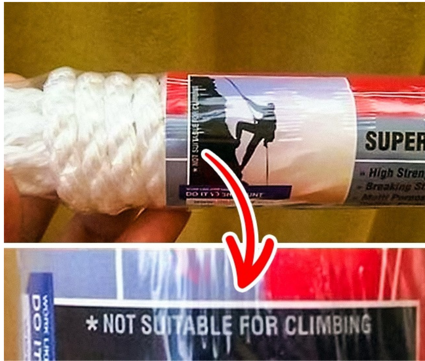
Reality is always harsh!