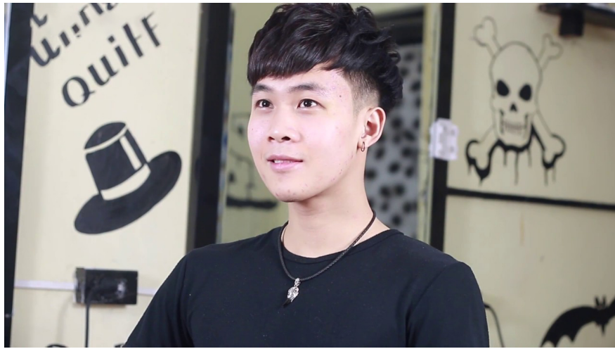
Men's hairstyle trimmed round face