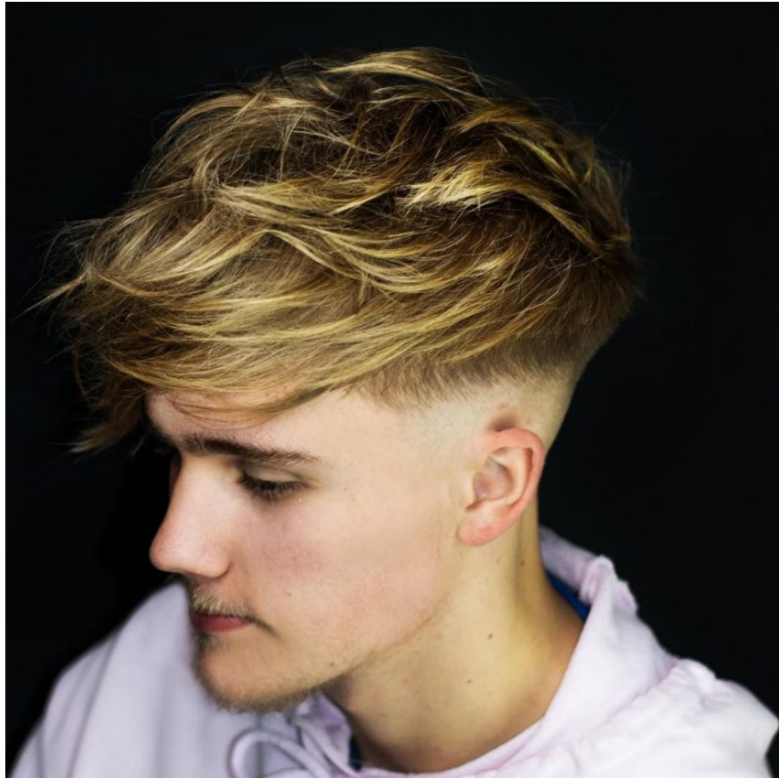
Men's layer hairstyle