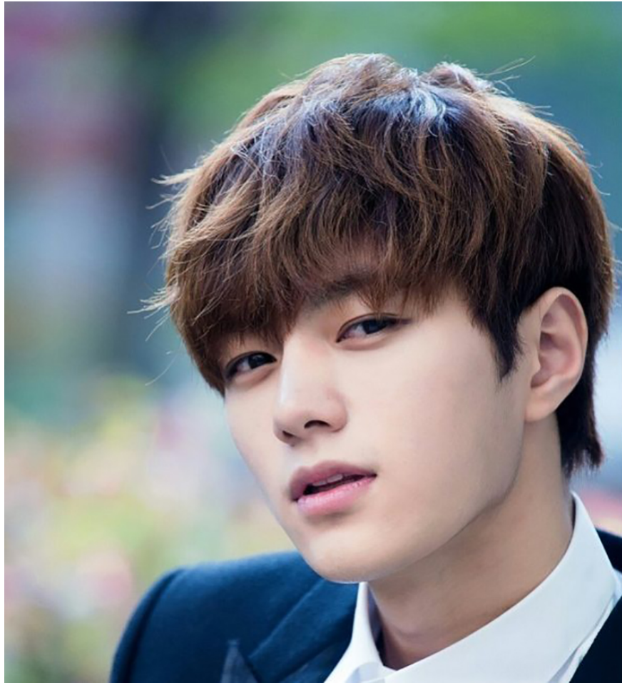
The most beautiful men's hairstyle