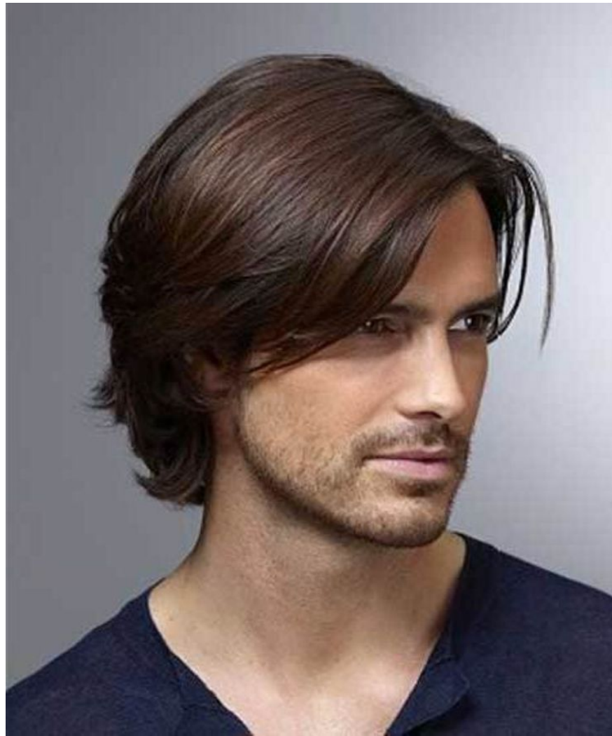
Layer men's hairstyle for the most beautiful long-face