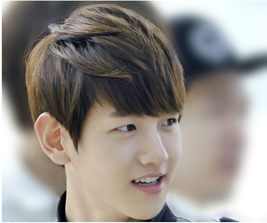
Men's Korean thinning hairstyle