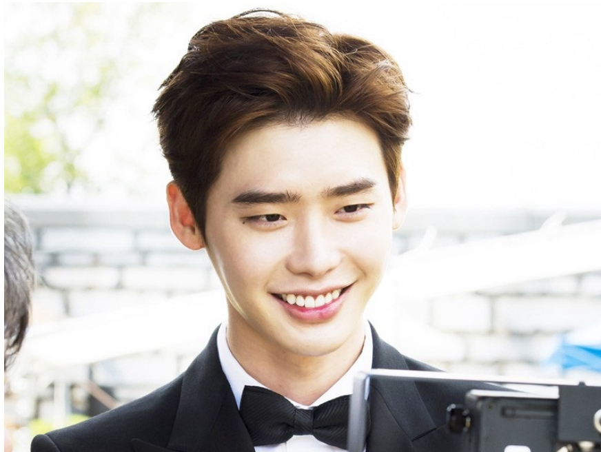
Double layer men's hairstyle