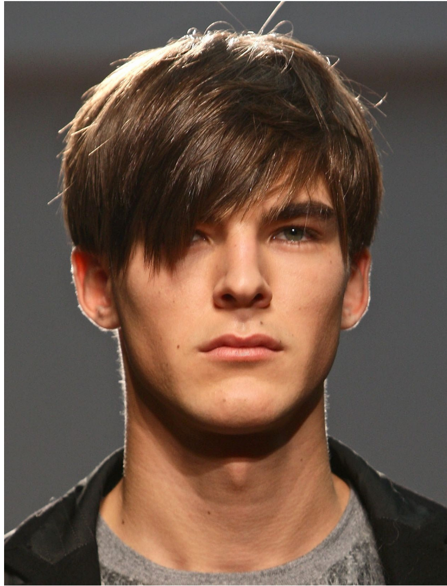
Men's layer hair style without curling