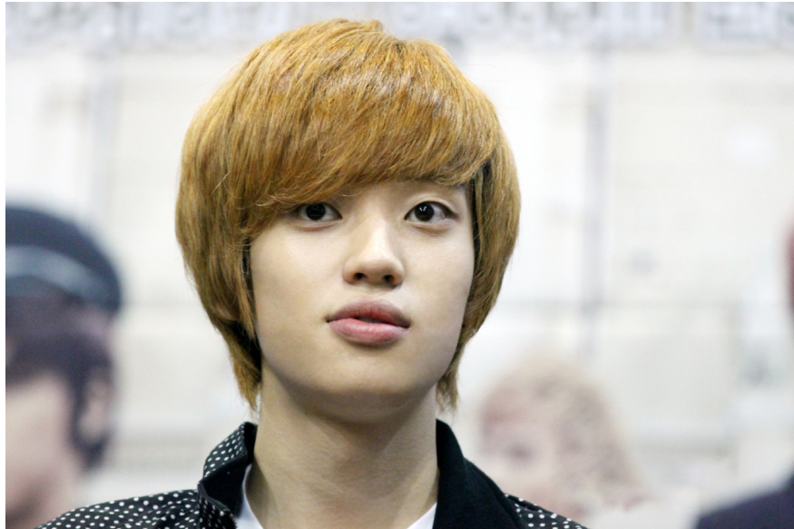
Nice men's hairstyle