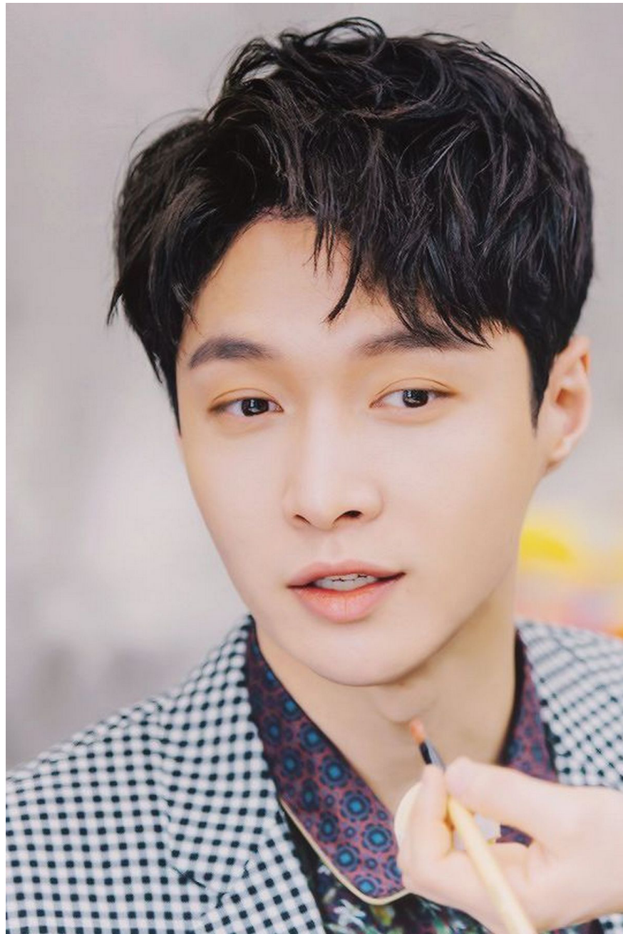
Men's hair undercut layer