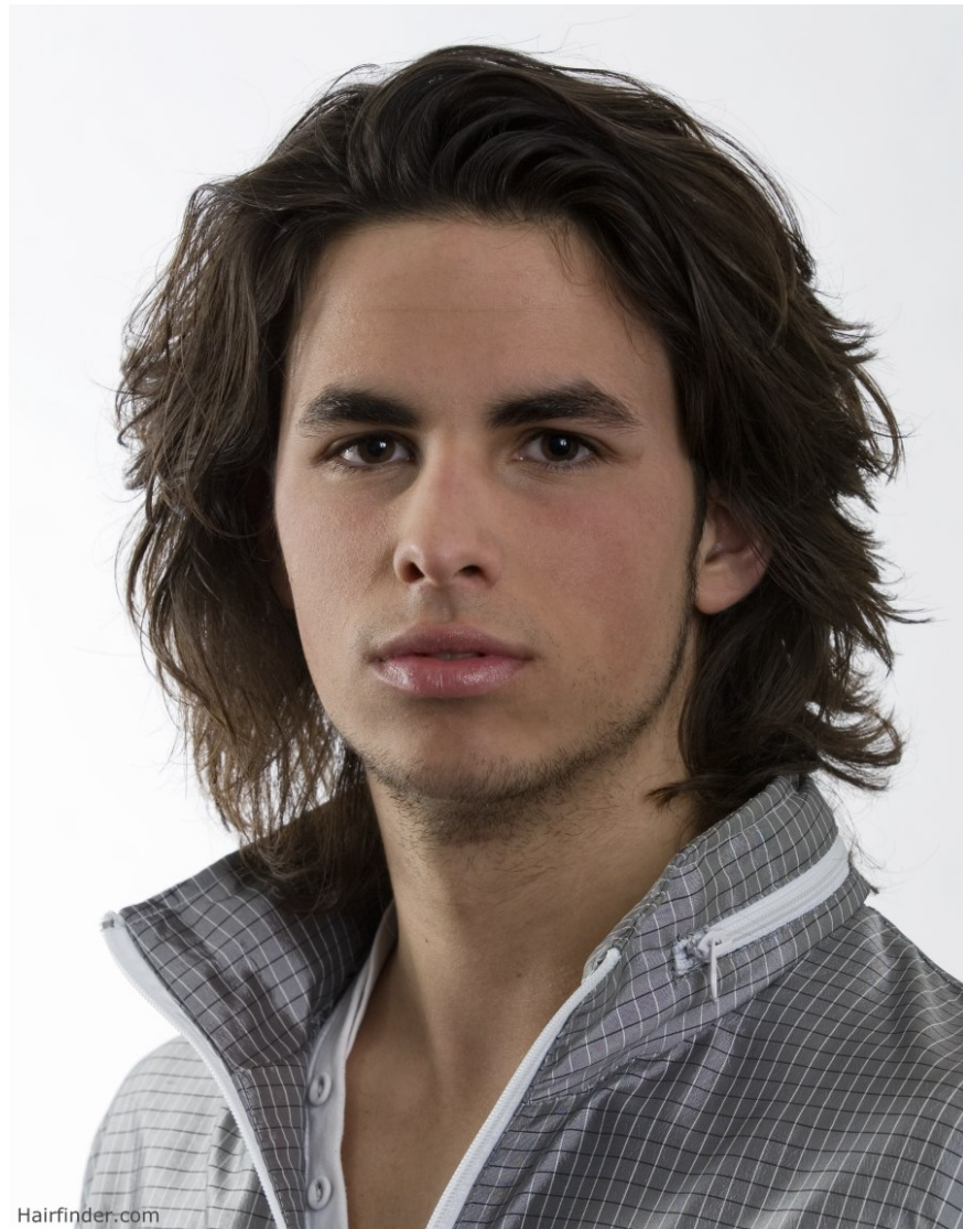
Men's layer hairstyle for round face