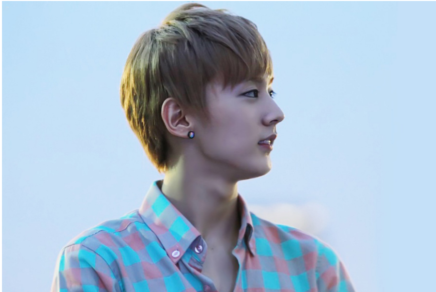
Men's hair trimmed in Korean style