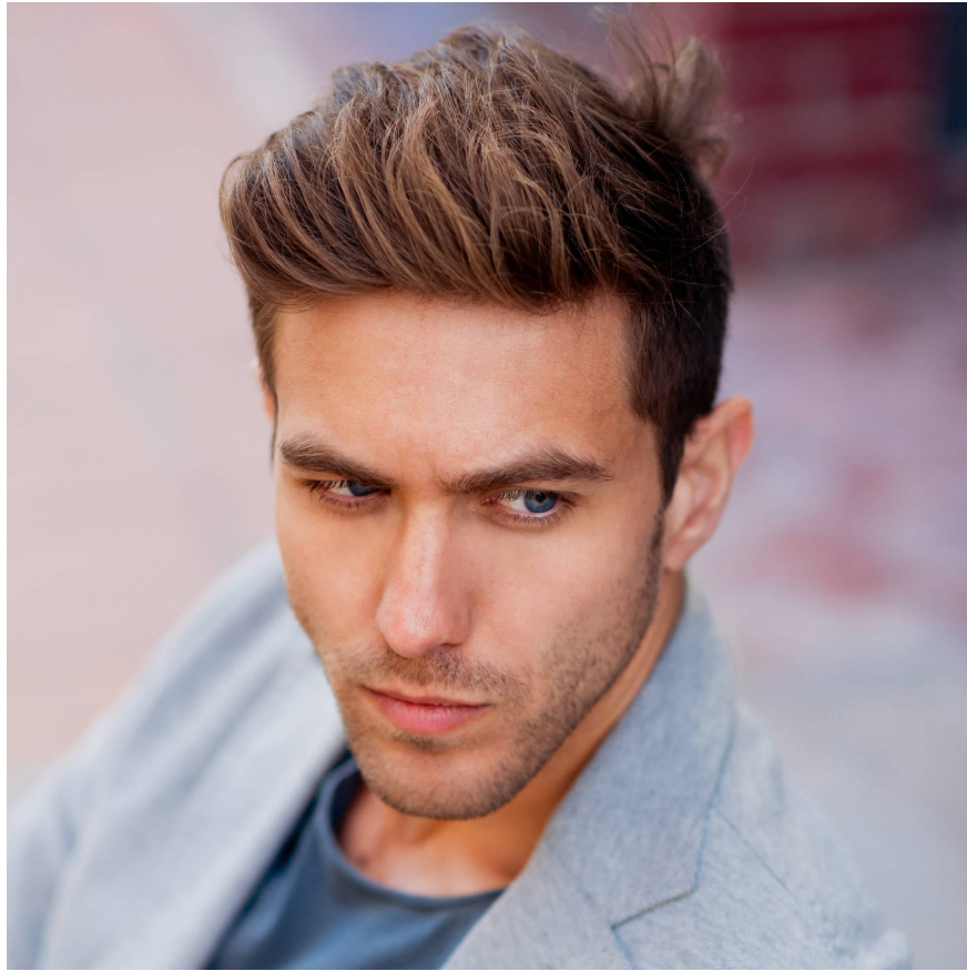
Men's hairstyle layer shaving 2 sides