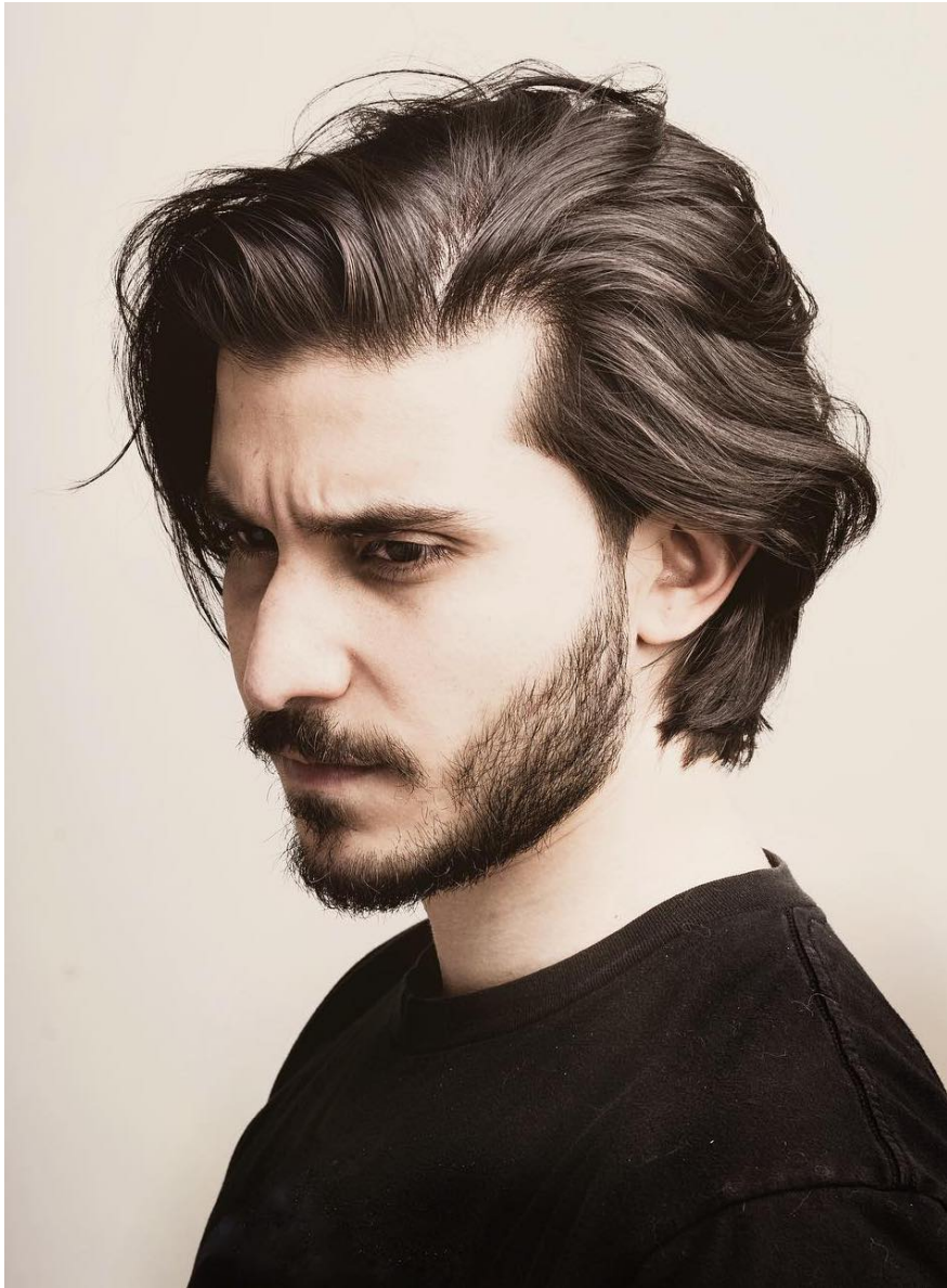
Men's hair layer