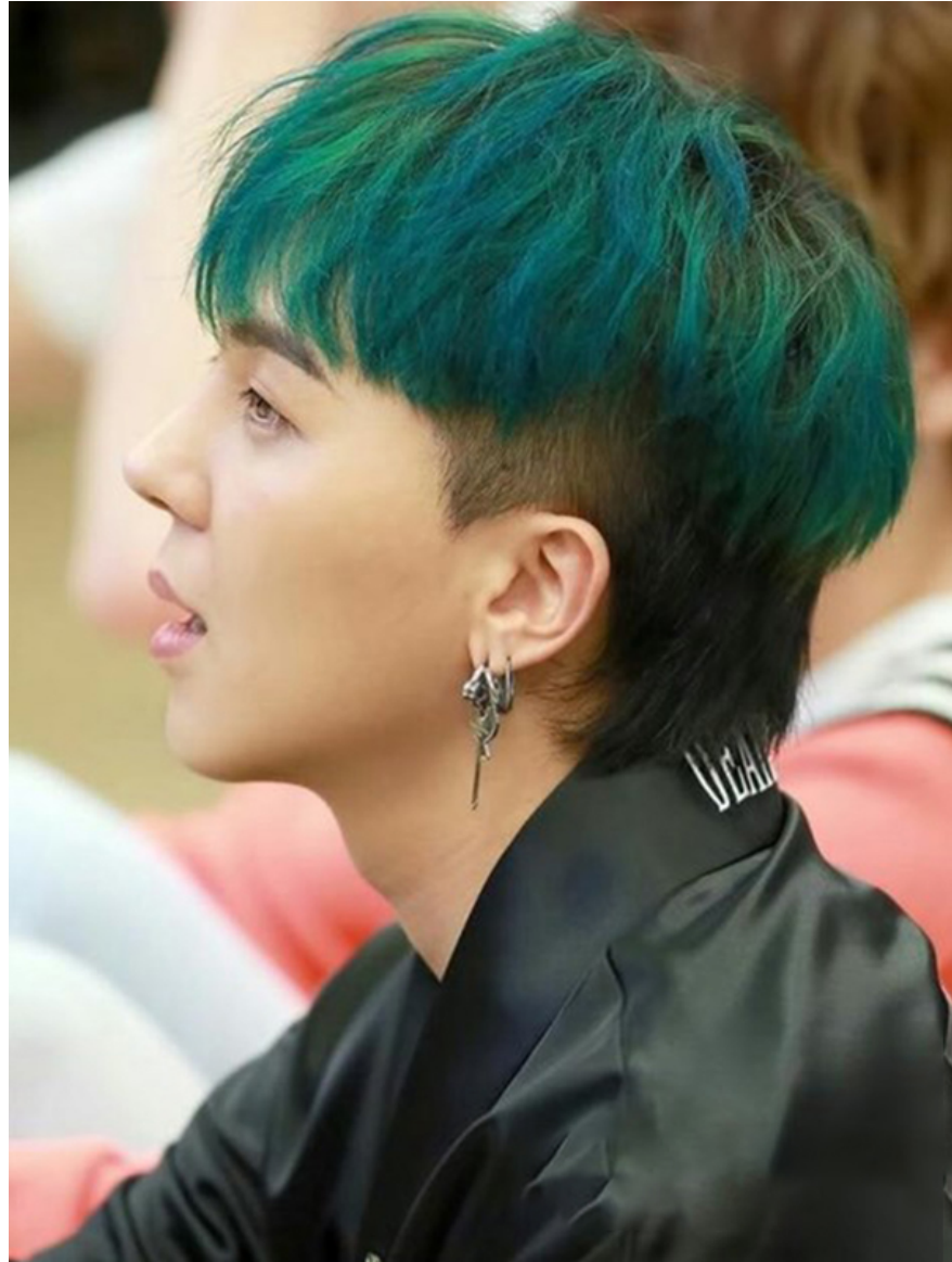
Korean men's layer hairstyle