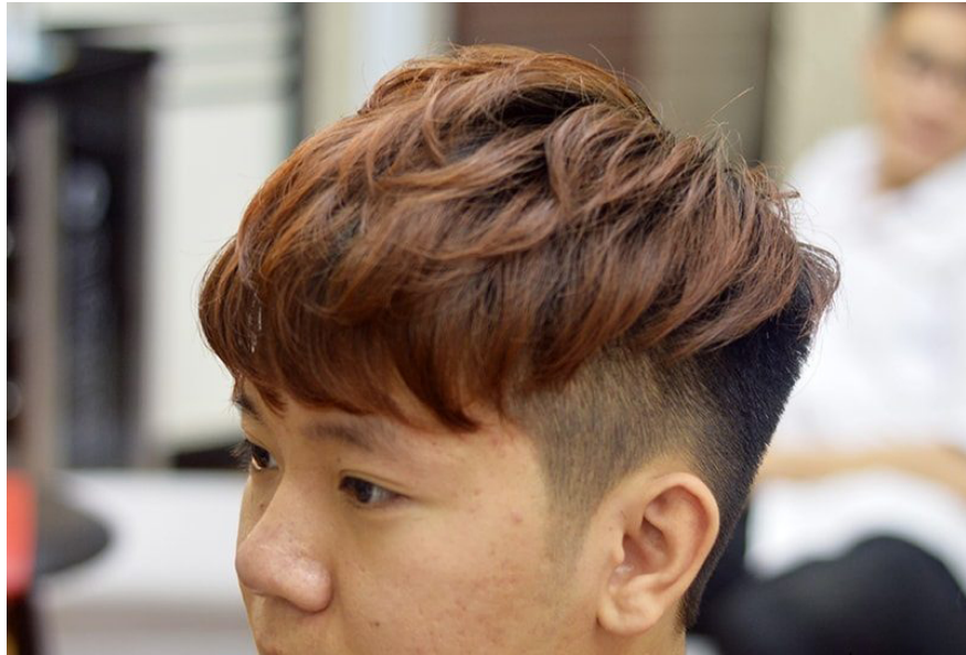
Hairstyles layer most beautiful silly male