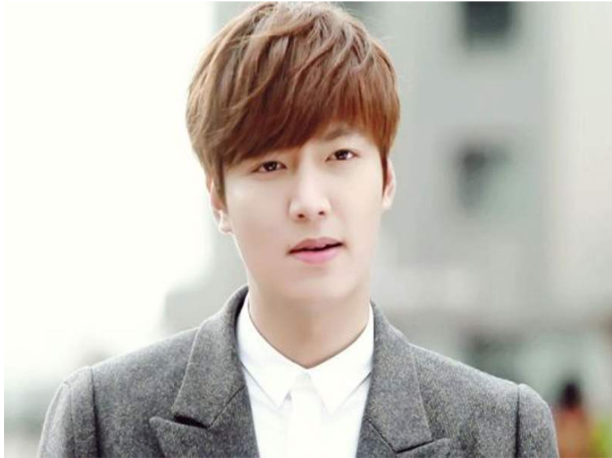
Hair layer for men with long face