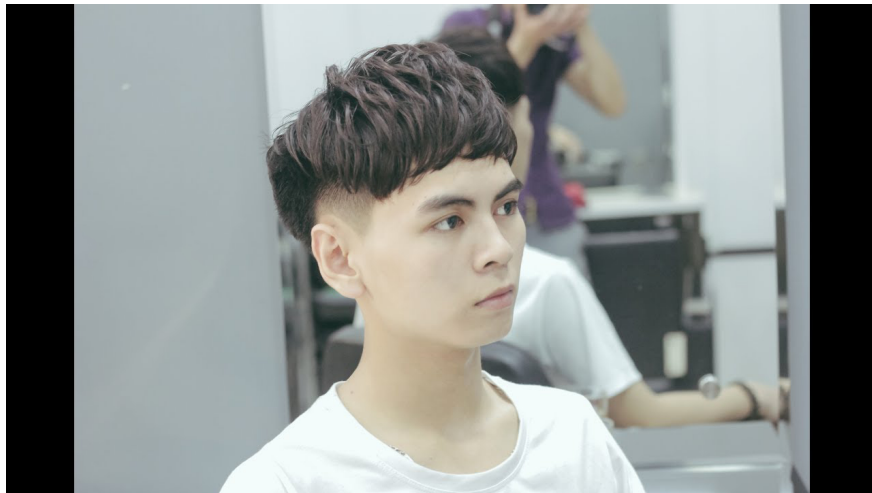
Men's layer hairstyle for oval face