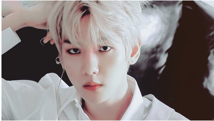
The male layer hairstyle is slightly curled