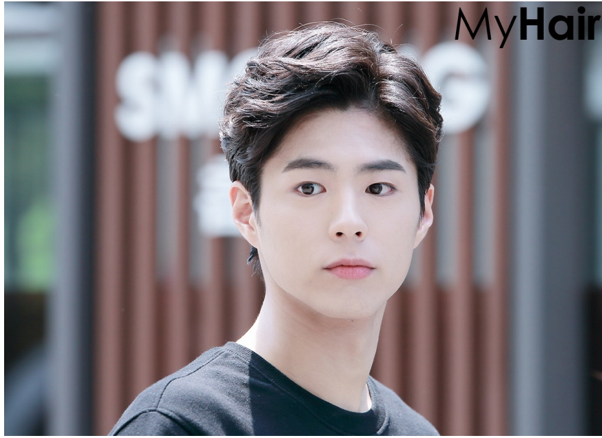
The best men's trimmed hair