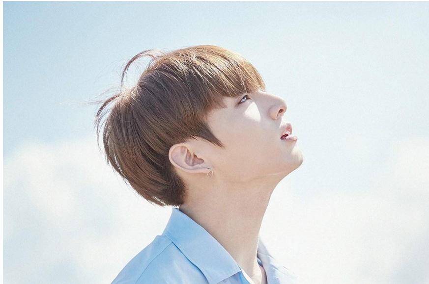
The hairstyle of the short male layer is beautiful