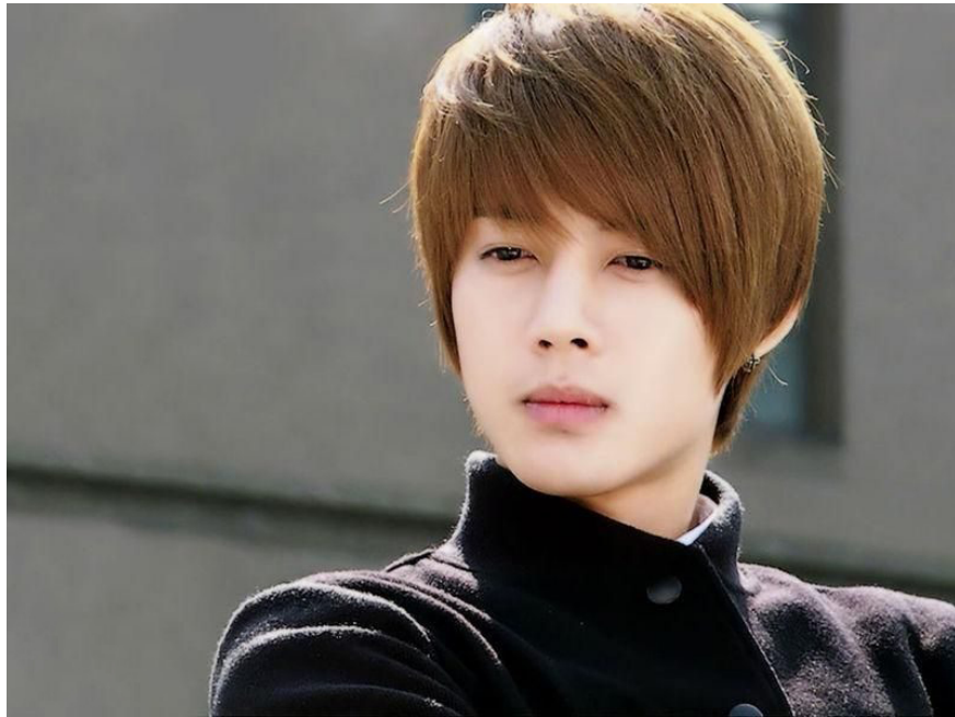
Short hairstyle for men