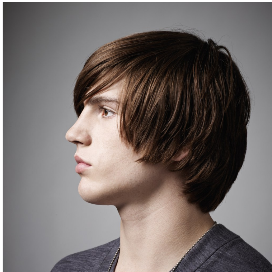
The layer hairstyle for men is very nice round face