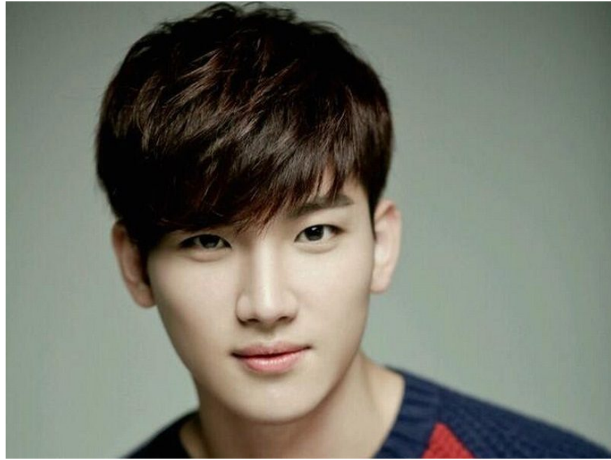
The male layer hairstyles curling gently