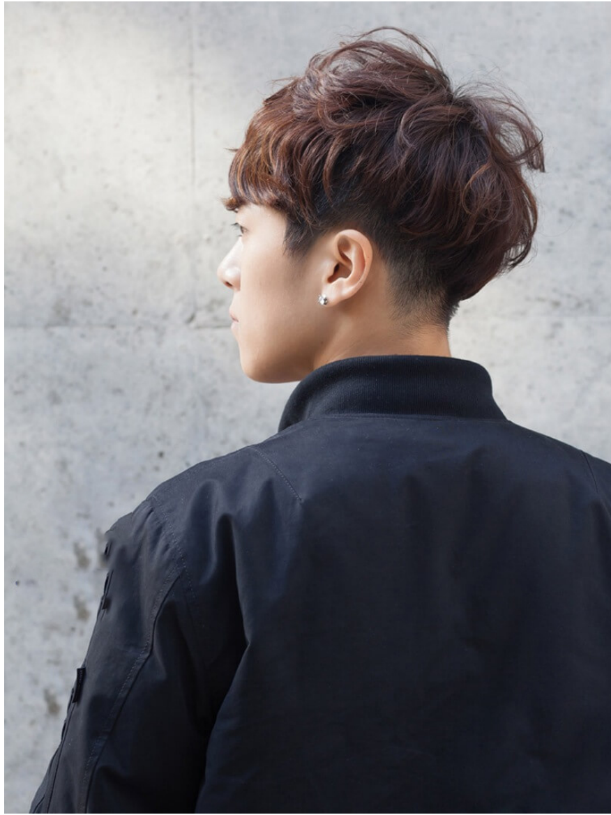
Men's hairstyle layer curly