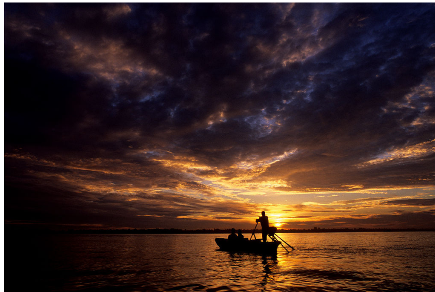
Sunset in Hue..