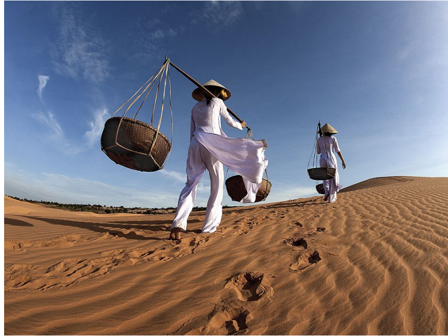
Mui Ne, paradise of sun, wind and sand.