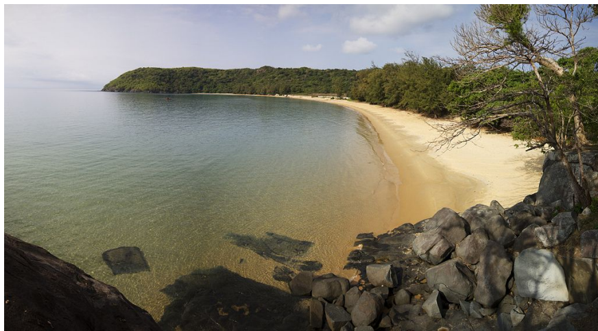
Beautiful beach with clear water in Con Dao.