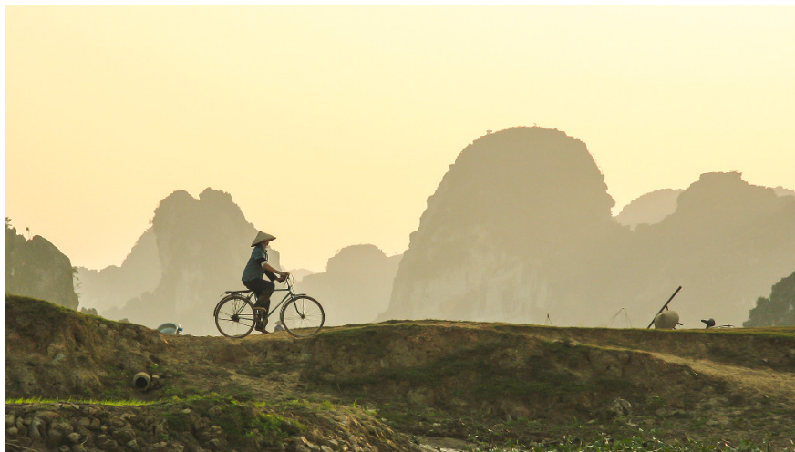
The idyllic beauty of the countryside in Ninh Binh.