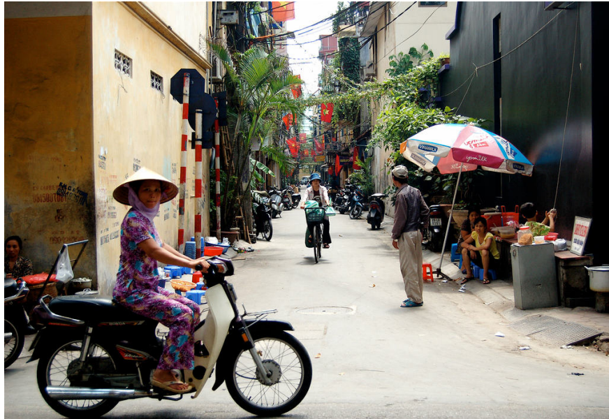
The ordinary everyday life of Hanoi people.