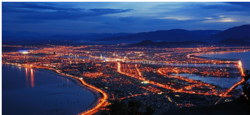
CityDa Nang glows with lights and light roads.