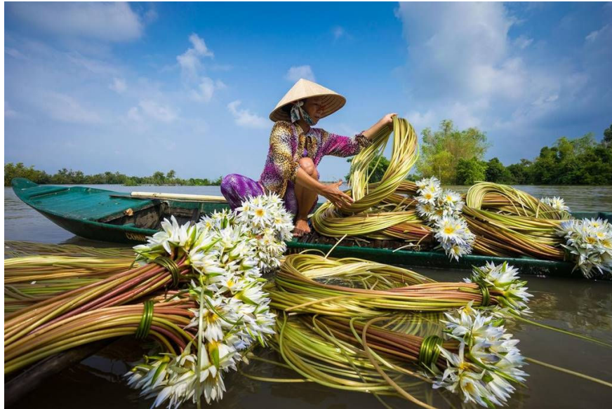
Harvesting waterlily on the river in Chau Doc, An Giang.