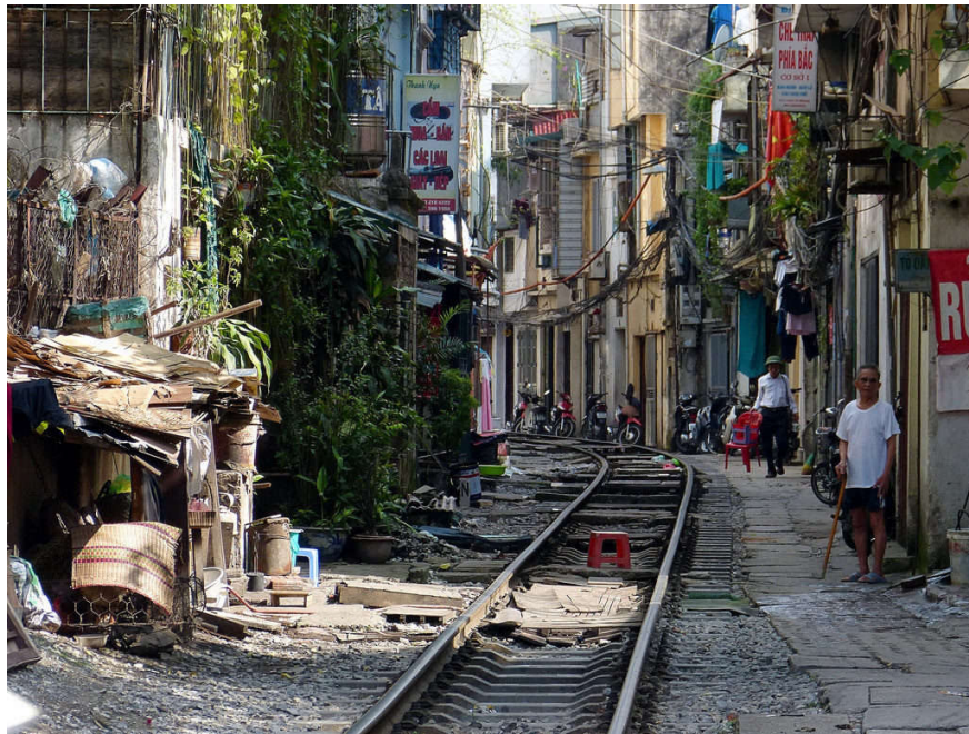
Train tracks are located in the residential area of ??Hanoi Old Quarter.This scene is called by many visitors as "unique place in the world" or "only in Vietnam".