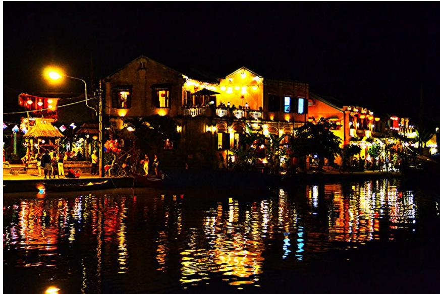
Beautiful night scene in Hoi An.