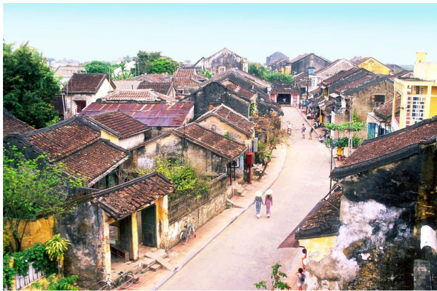
Hoi An Ancient Town is a great destination for those who like to find somewhere ancient.