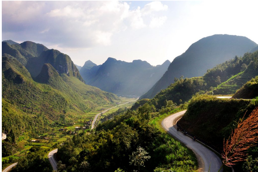
The winding road is full of souls in Ha Giang.