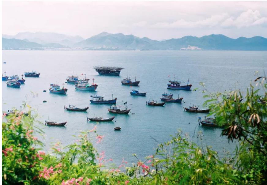
Beautiful scenery at Nha Trang beach, Khanh Hoa.