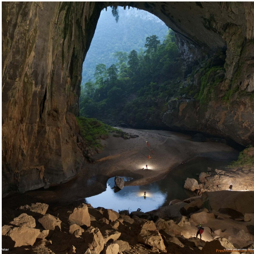
Hang En, a cave located in Phong Nha - Ke Bang, Quang Binh National Park.