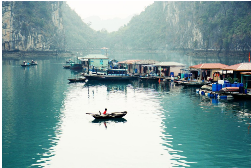
The lyrical and peaceful beauty of the fishing village on the bay.