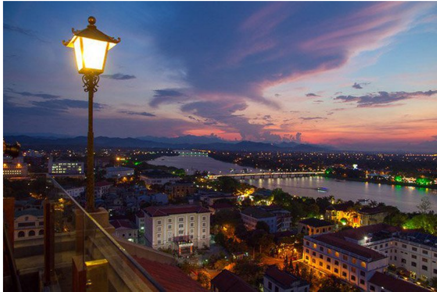
Hue city started to light up.(Photo: Hoang Giang Hai / Flickr: vak).