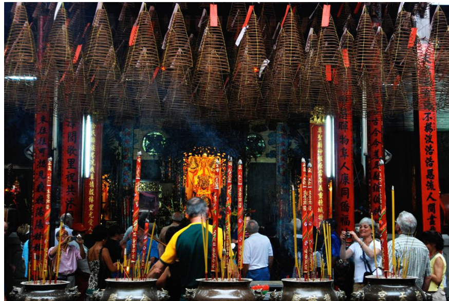
Ba Thien Hau Pagoda, the oldest temple in Ho Chi Minh City.

You finished reading the article " 25 beautiful pictures of Vietnam make you say 'My country is so beautiful!' " edited by the TipsMake team. We hope this article has provided you with many useful tech tips and tricks. You can search for similar articles on tips and guides. Thank you for reading and for following us regularly.