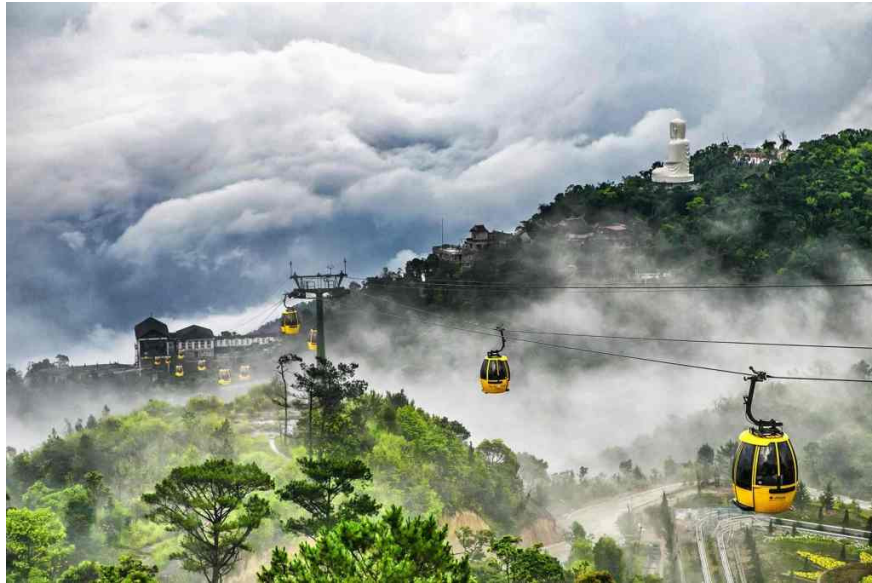
The cable car to visit the place as the first sight of clouds flies halfway up the mountain in Ba Na, Da Nang.