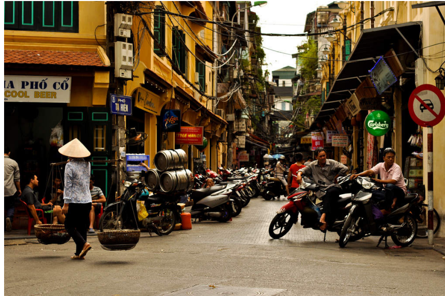
The old street corner of Hanoi.