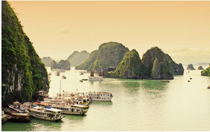
Amazing wonders - Halong Bay.