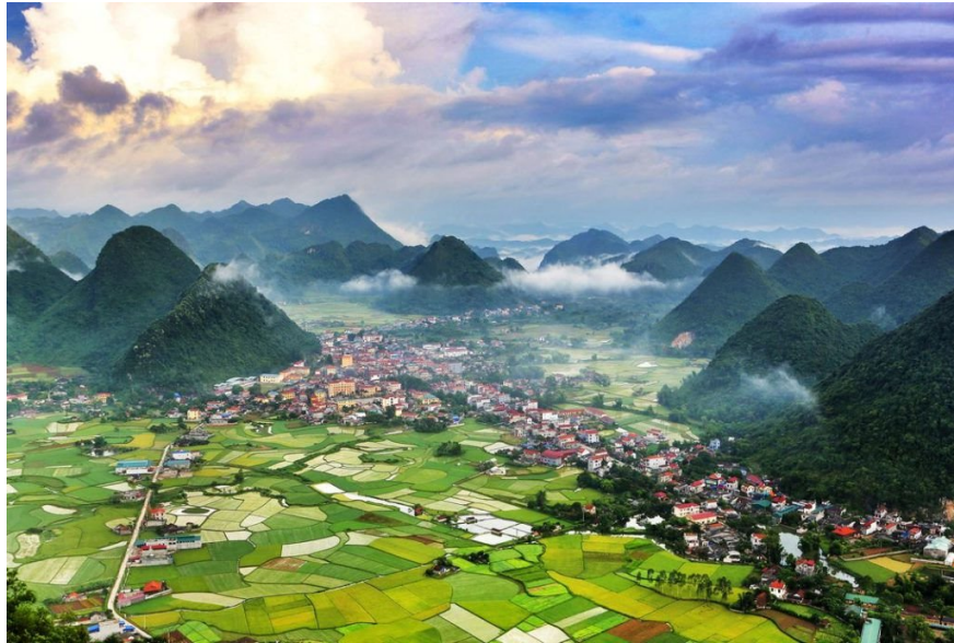
And the enchanting scenery in Bac Son and Lang Son valleys.