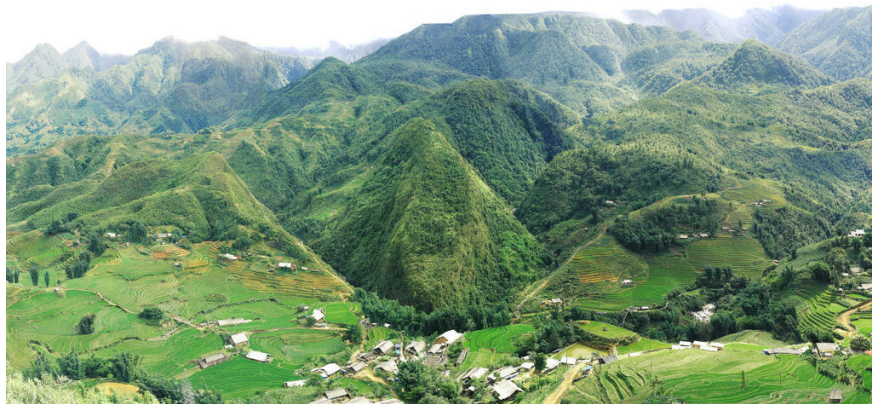
The mountain of the same message extended as endless in Ha Giang.