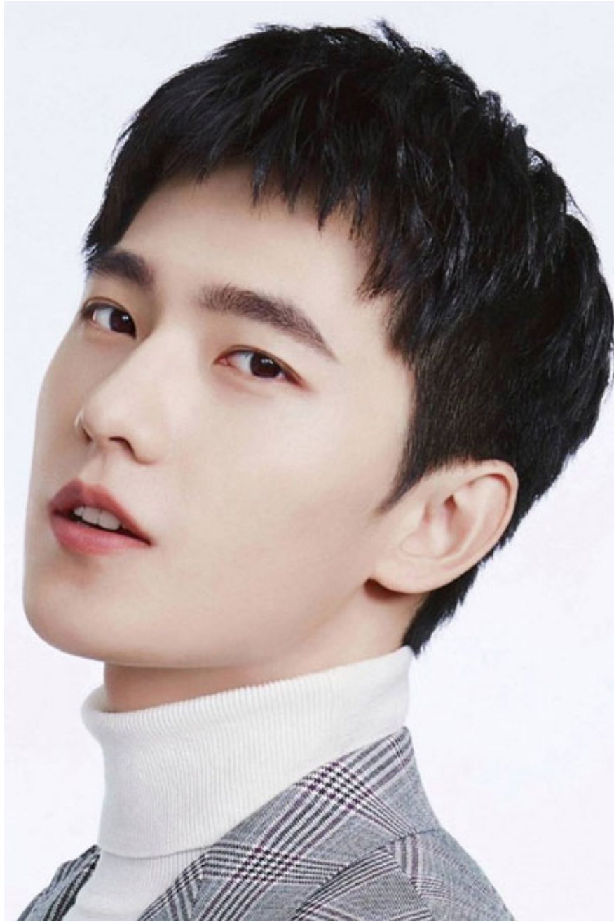
Japanese men's layered hair