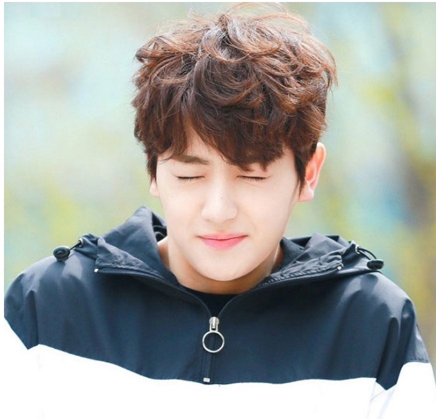
Curly men's layered hair