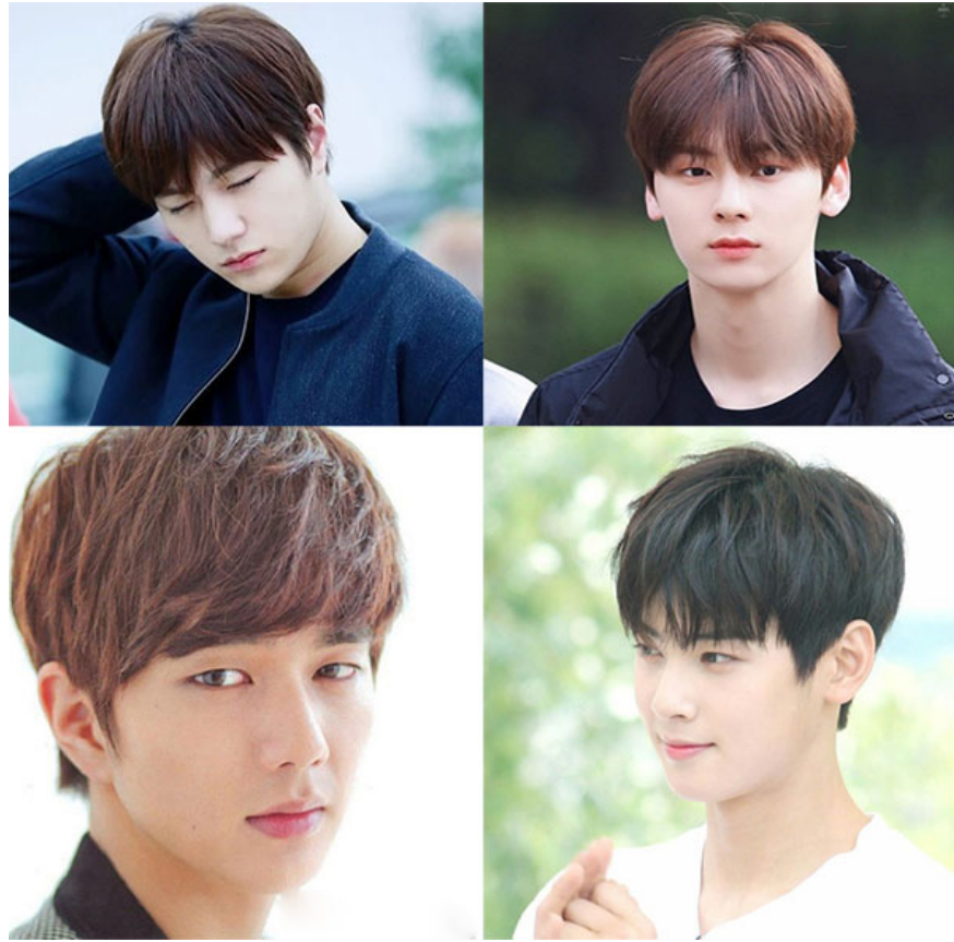
Layered hair for men with round faces