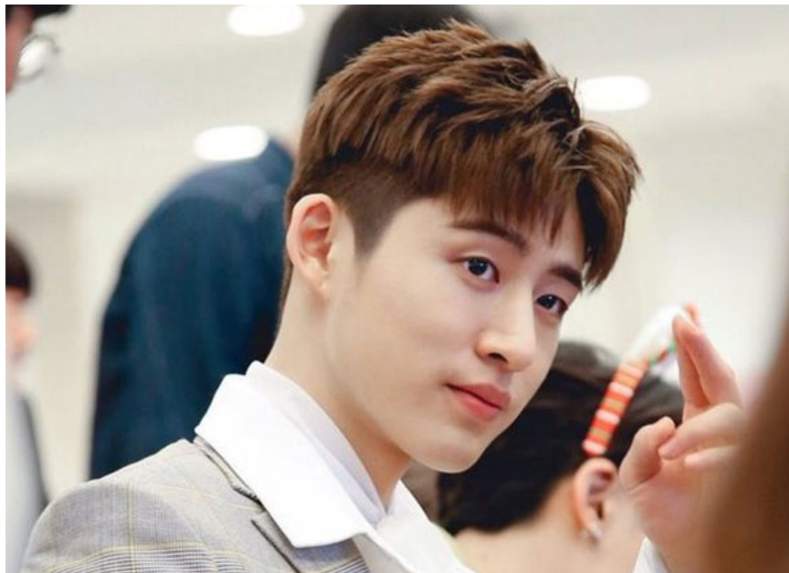
Layered hair for men with square faces