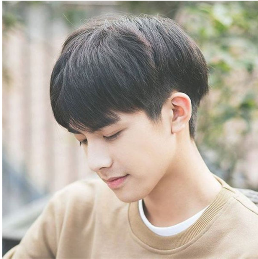
Men's layered hair is not permed