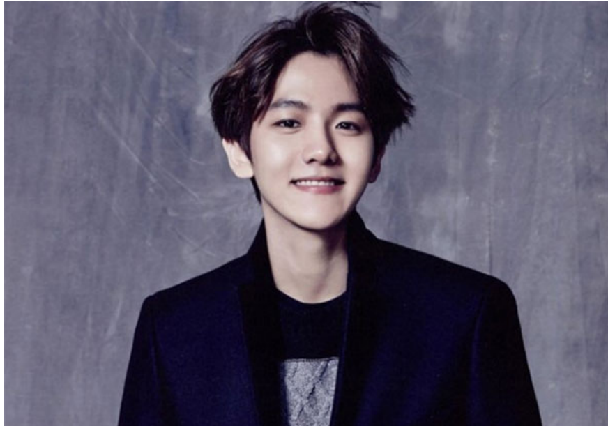
Men's layer hair parted in the middle