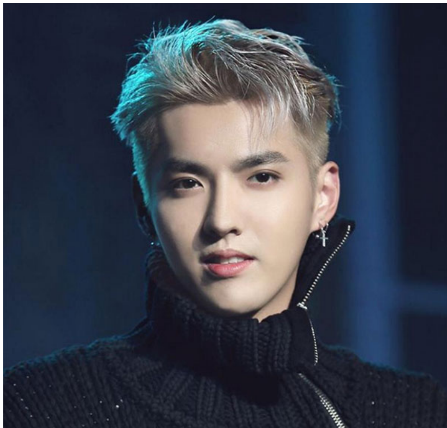
High forehead men's layered hair