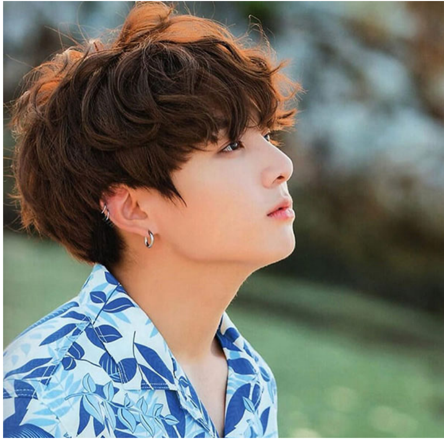
Men's layered hair curls