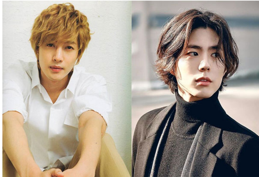
Men's layered hair is lightly curly