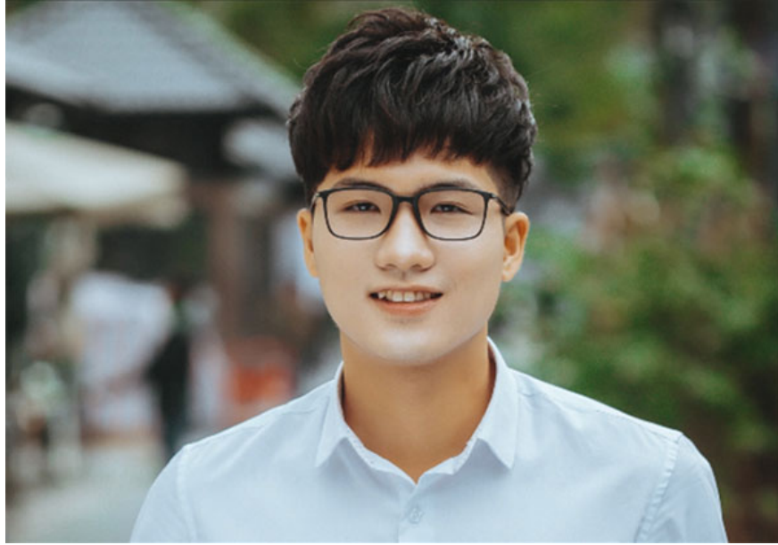
Layered hair for men with square faces