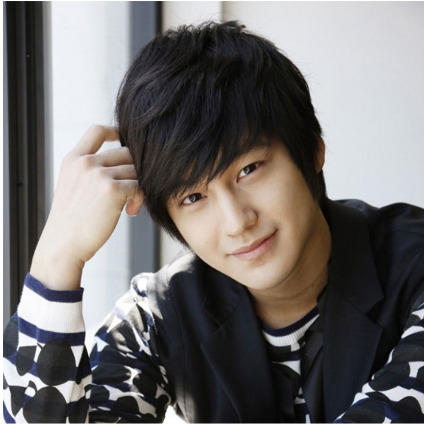
Men's layered haircut with cross bangs