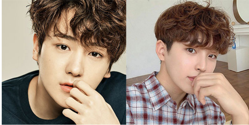
Men's layered hair with thin bangs