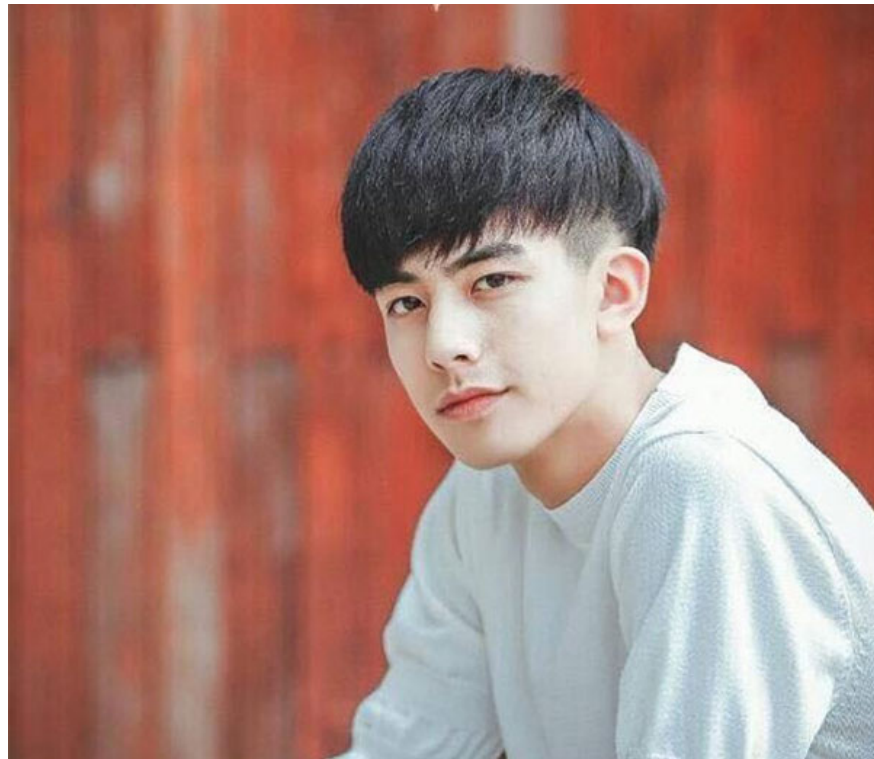
Men's layered hair for long faces