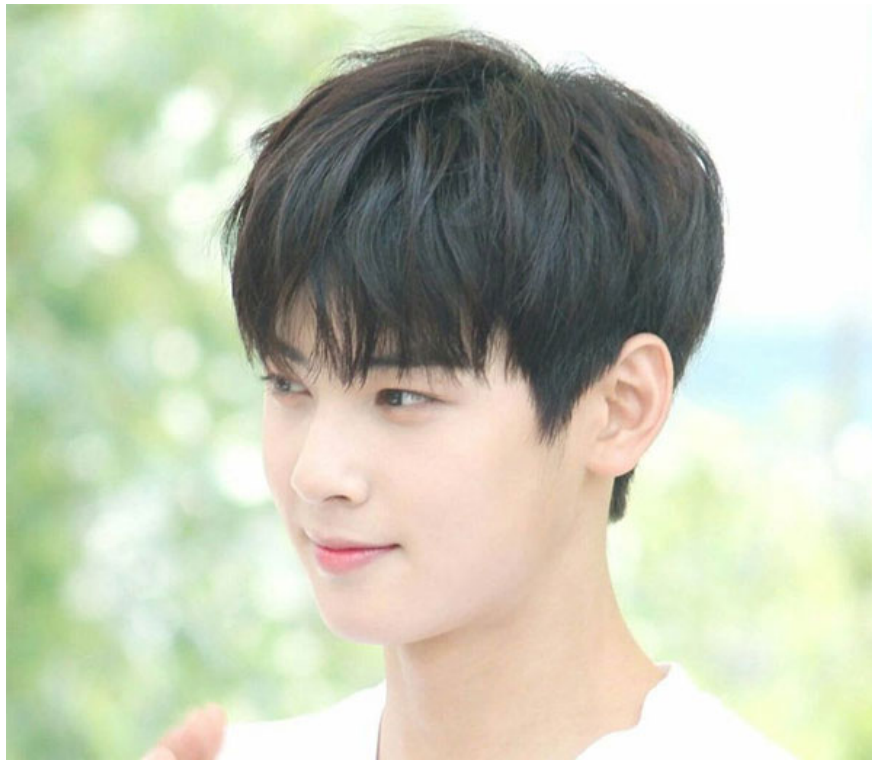
Layered hair for male students