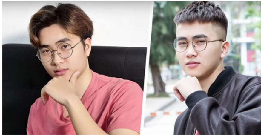
Men's layered hair for students