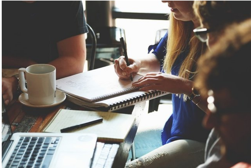
Kim Kurlanchik Russen - TAO Group's partner:

" If other people don't understand your intentions and can't meet the needs you need, it's your fault for not expressing your intentions to them. The people I work with are always in communication, sometimes headaches, but communication is an essential activity for balance, maybe you have a specific desire or need, but to do it "Collaboration is especially necessary and important. We always encourage employees to share personal