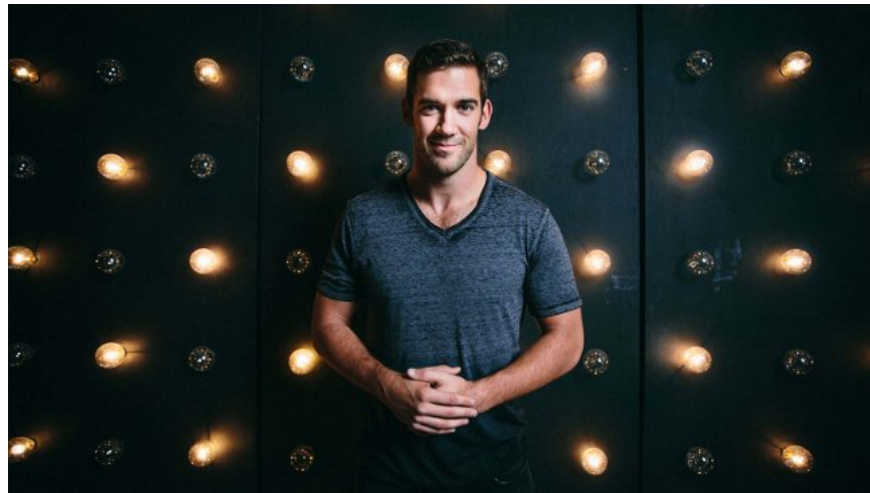
Lewis Howes - author of the best-selling book " The School of Greatness " voted by the New York Times:

" Each of us brings something to the world and we have the ability to quickly sniff a fake person. The more you appreciate the sincere relationship between people and people, find ways to help people. different when possible - instead of just caring about what they can do for you - your image in people's eyes will become more beautiful and you will become closer to everyone. definitely help you become a good leader, but it is necessary to be a respected leader, which makes a difference for your business . "