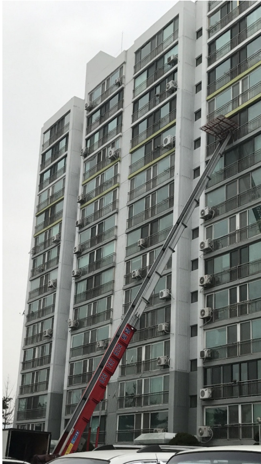
10. Practice is a difficult problem .