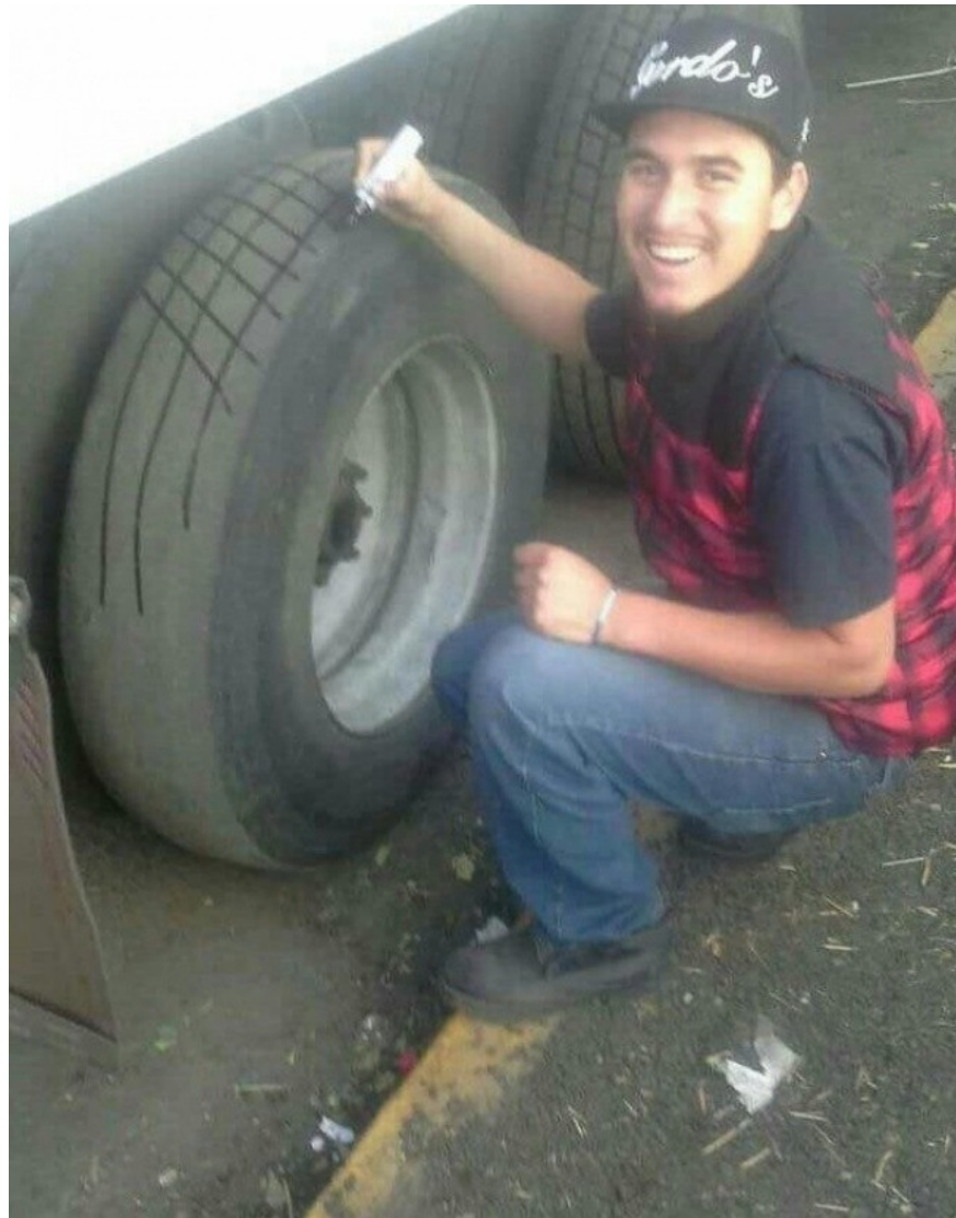
15. What do you mean? Simple.