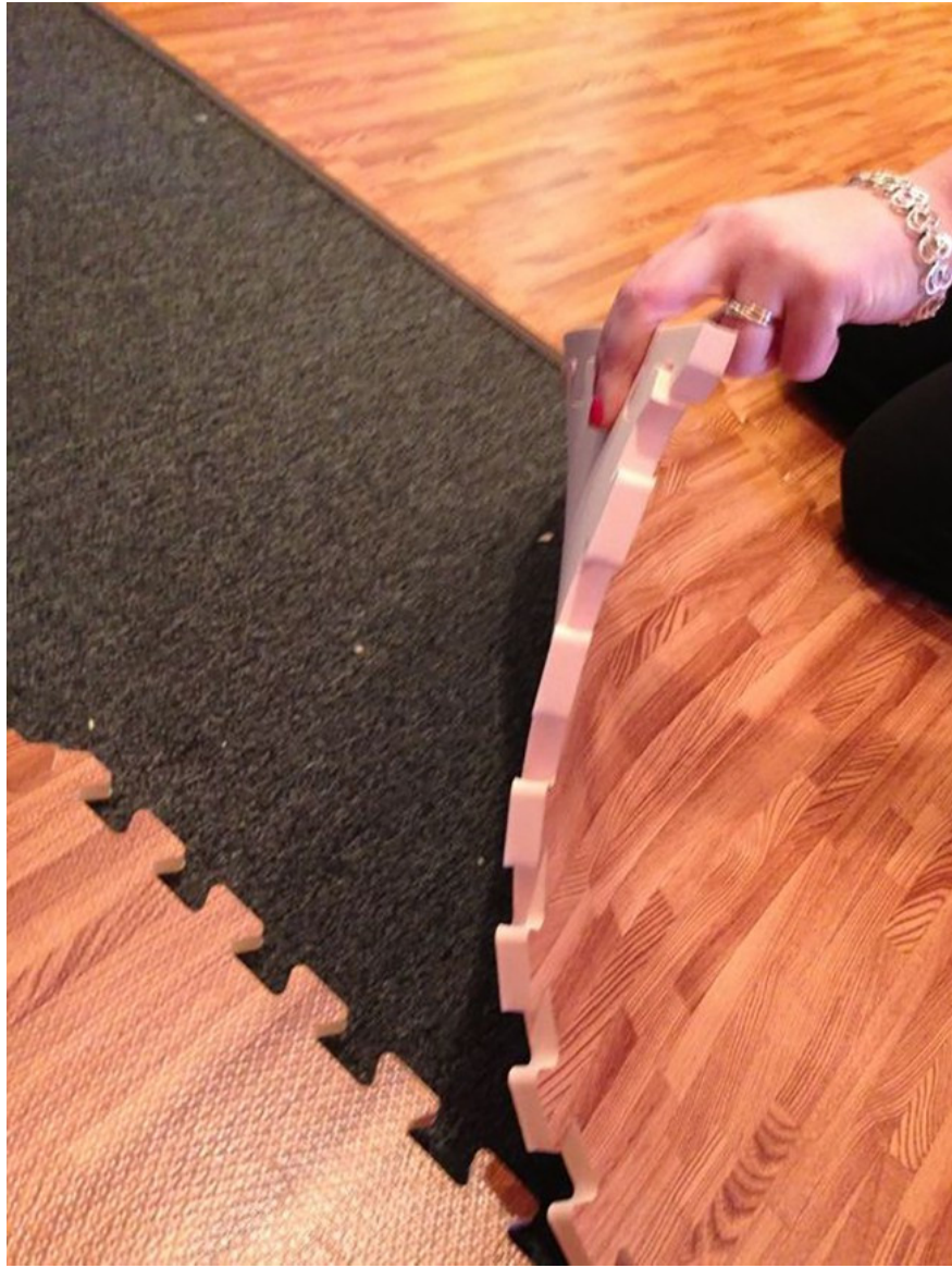
6. Need this warmth in cold, cold days