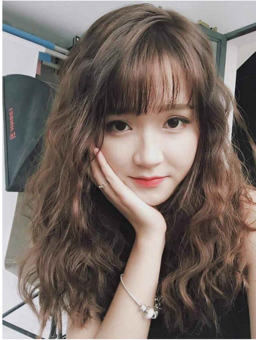
Beautiful curly back hair