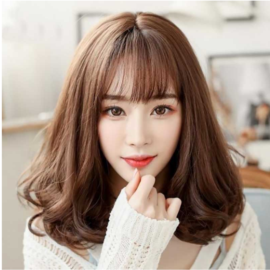
Curly water wave hairstyle