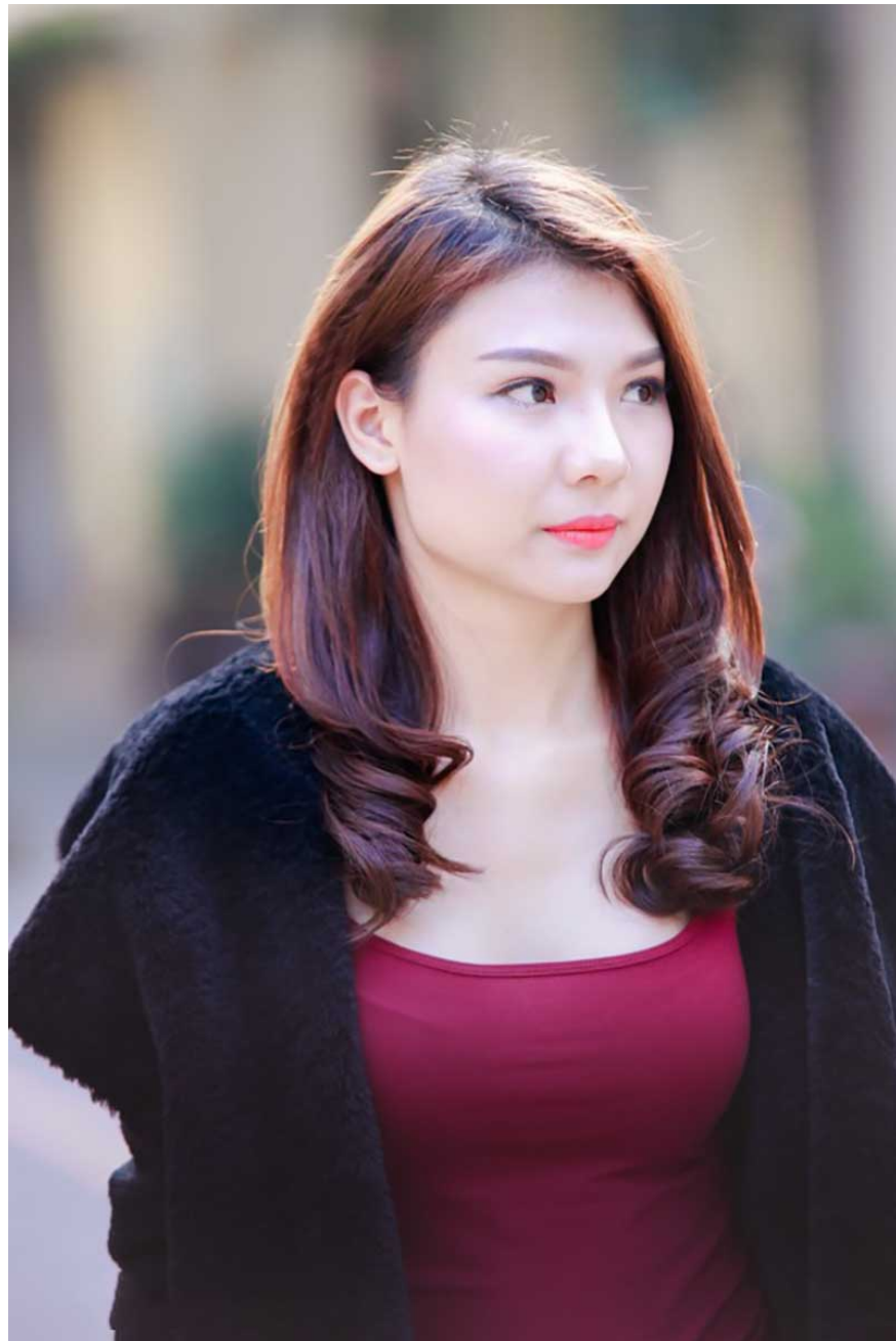
The best back-trimmed hair of the back