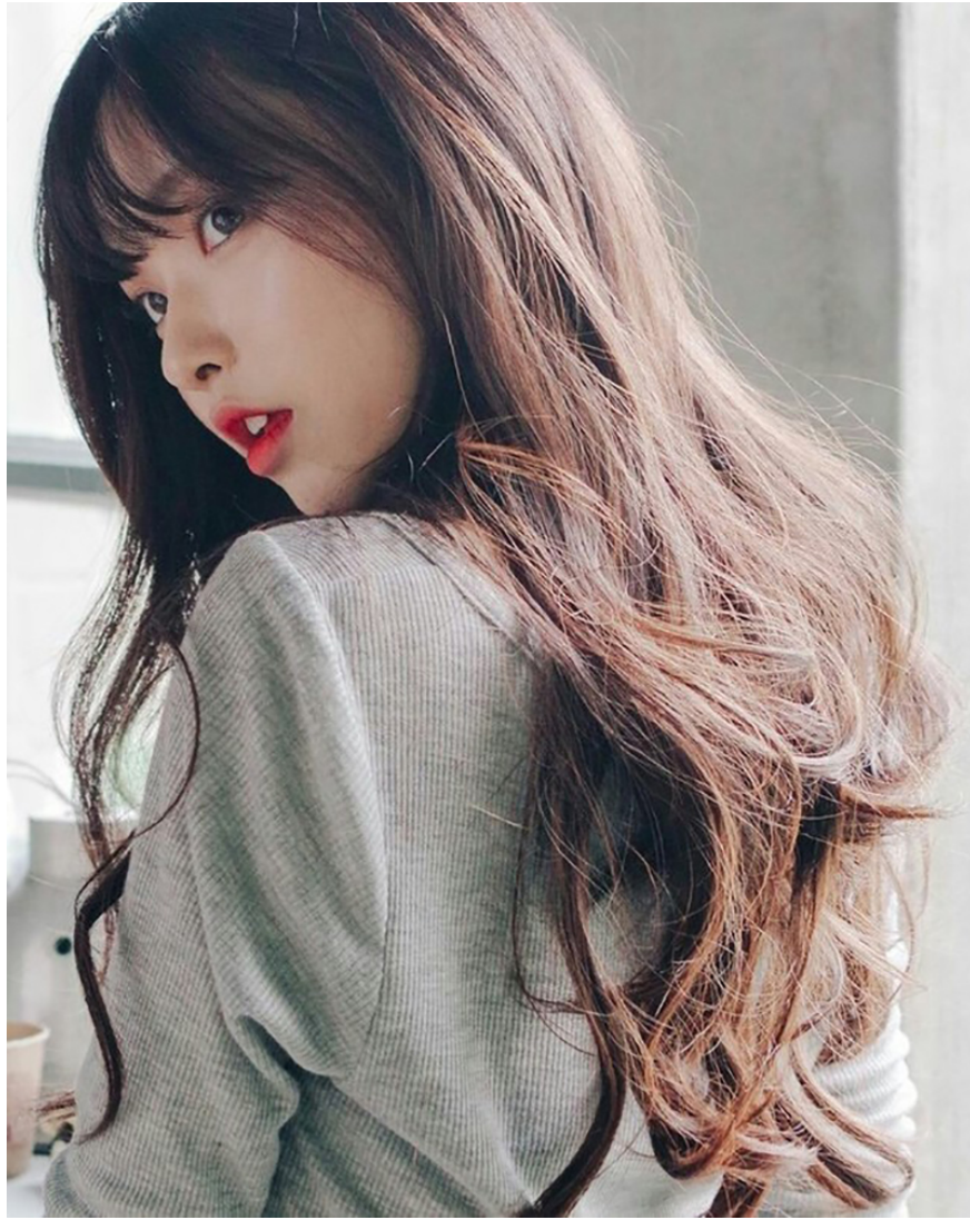
Back hairstyles for square face