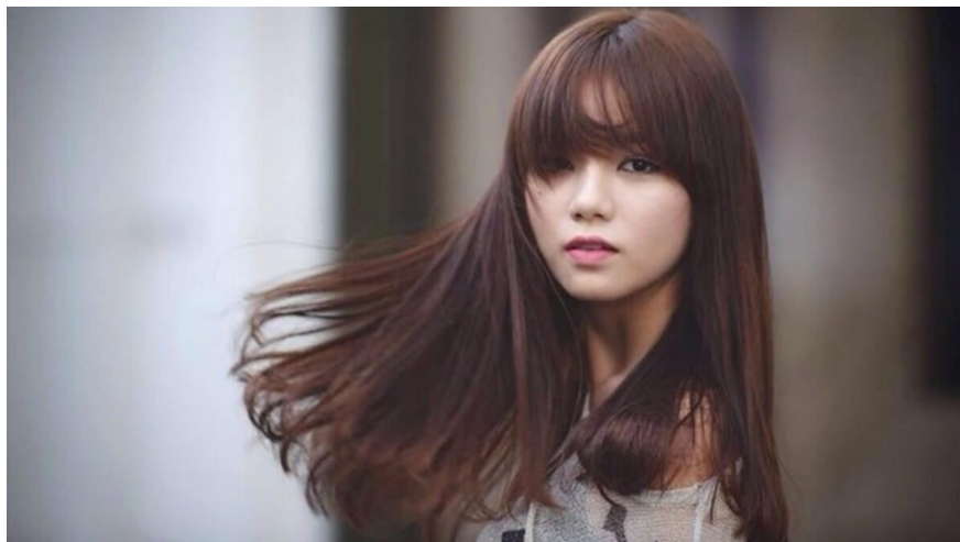
The hairstyle of the back stretched beautifully