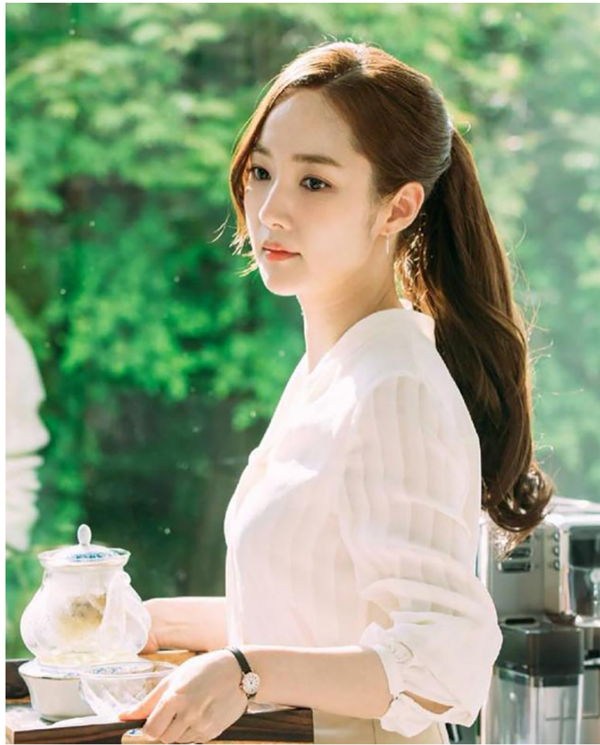
Beautiful straight back hairstyles