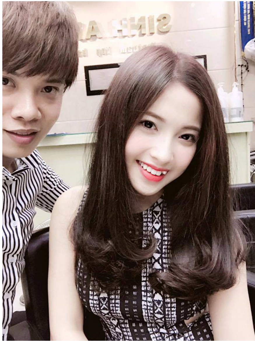
Flat back hair