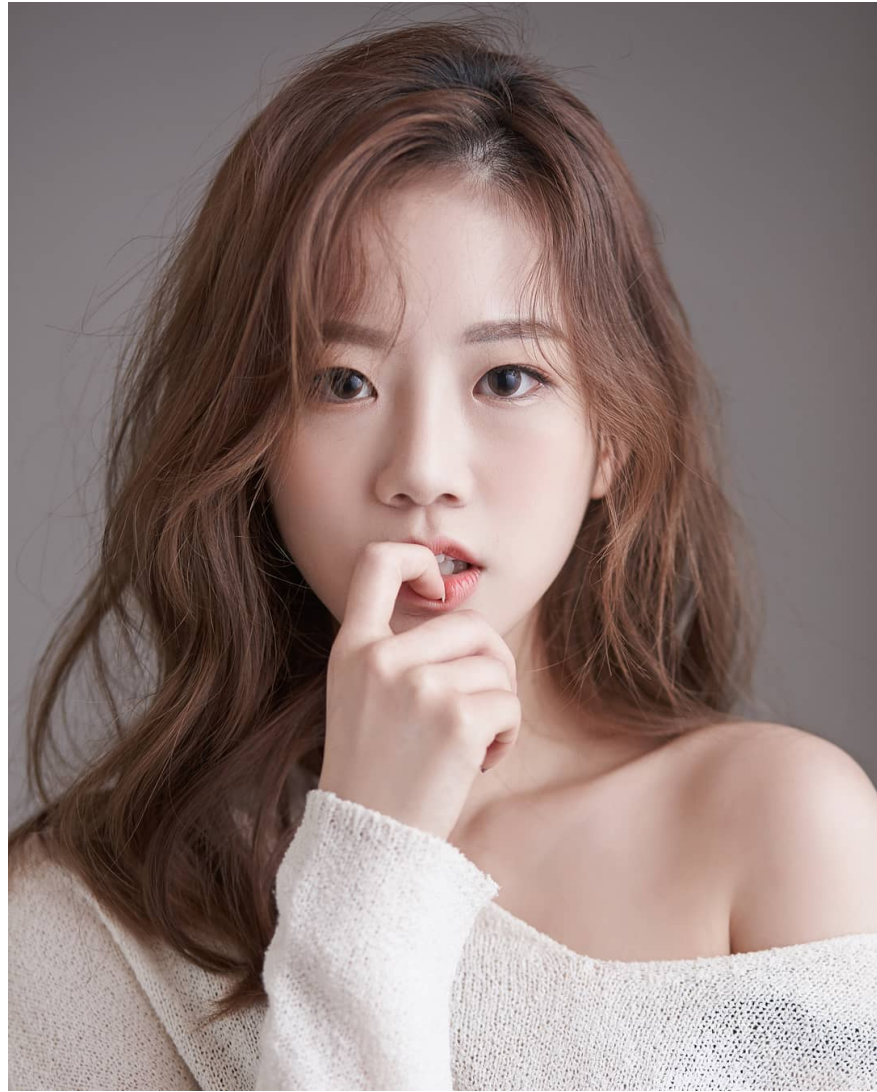
The most beautiful C-cut back hair