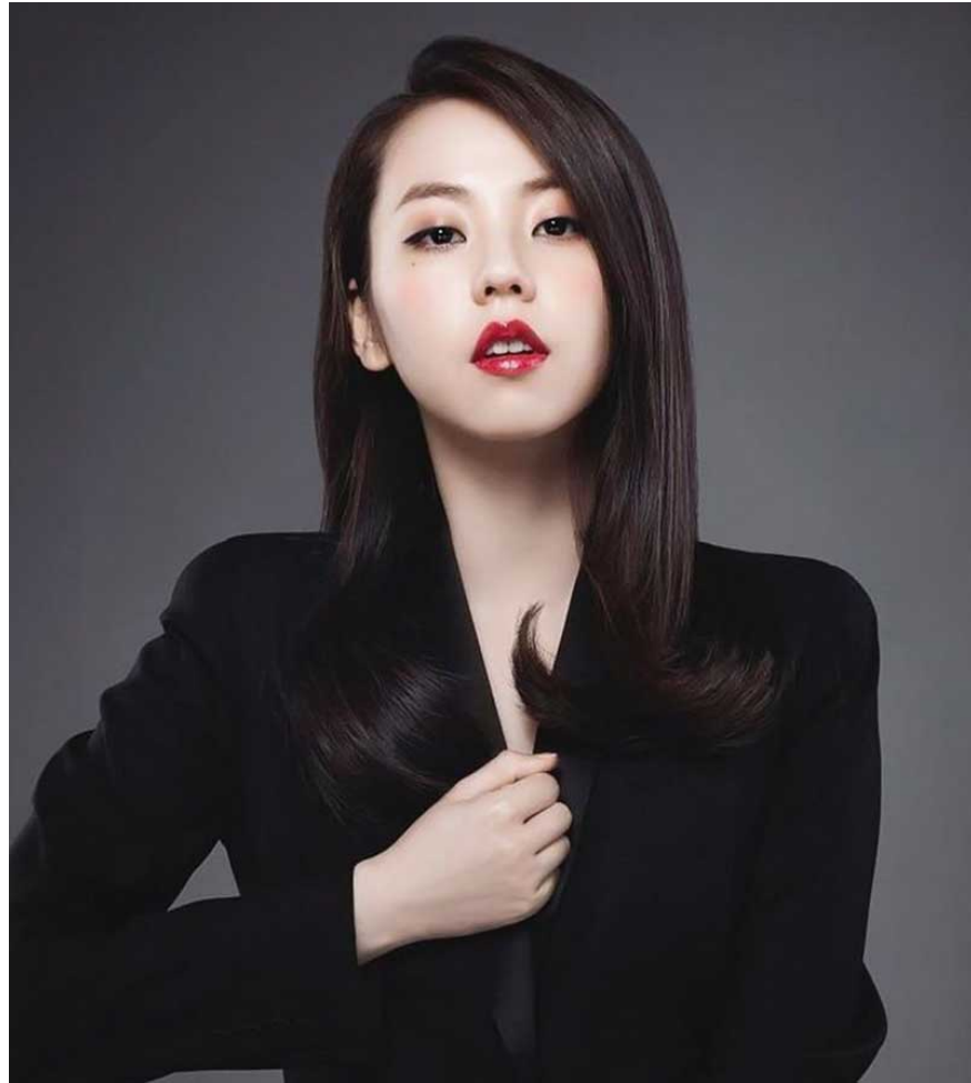
Oval hairstyle back