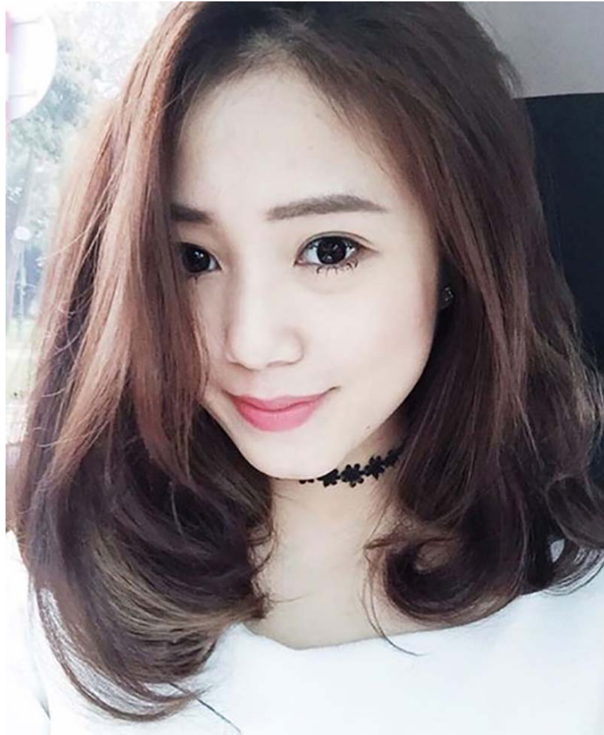
The most beautiful back-length curling hairstyle