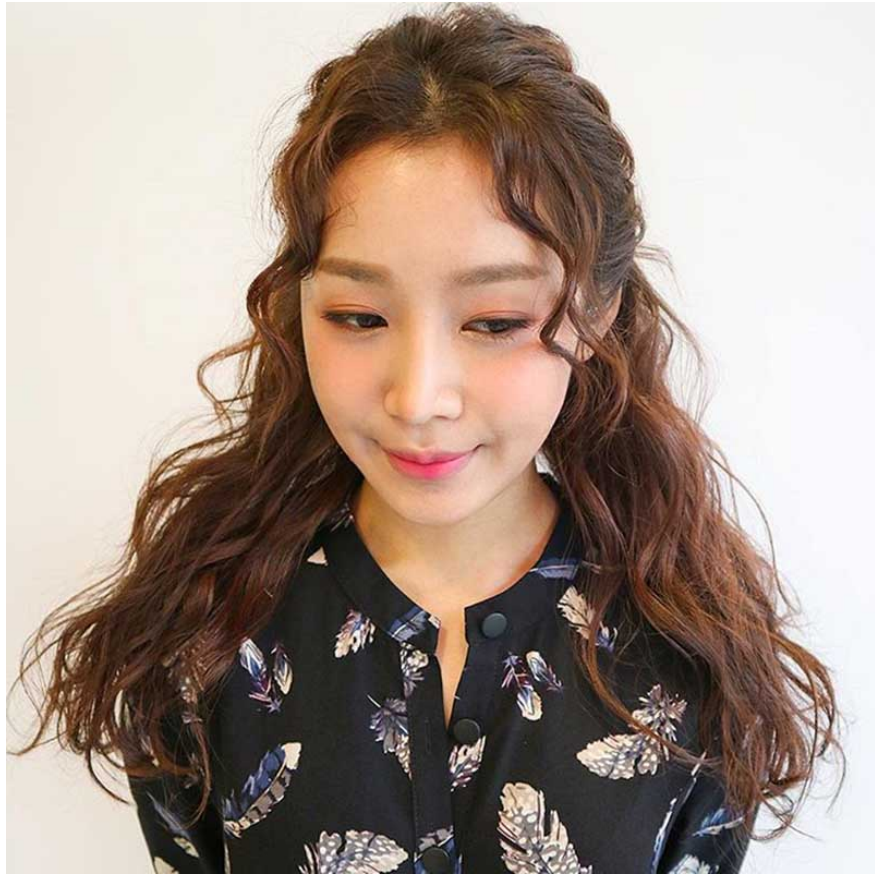
Young beautiful back hair