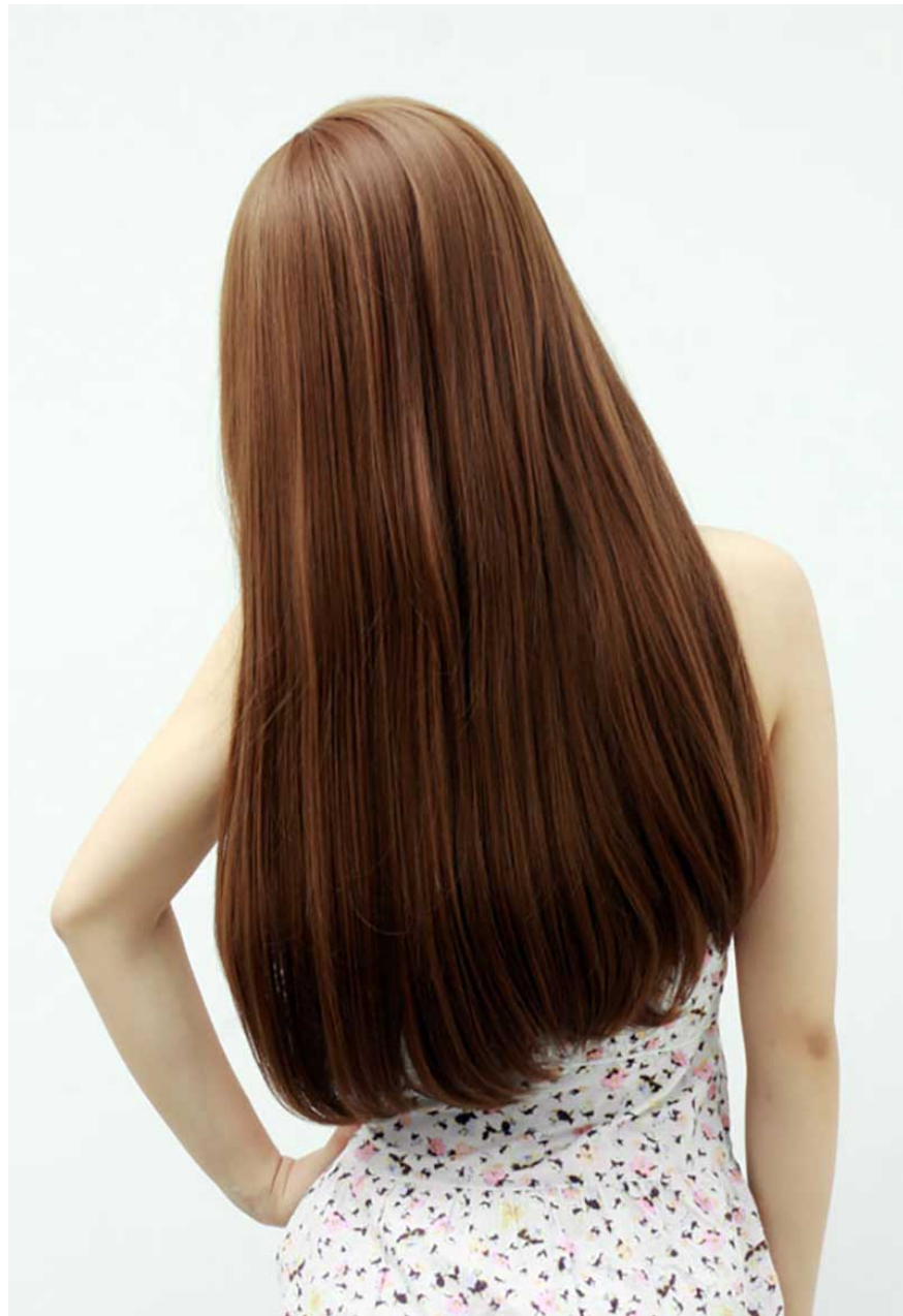
Straight back hairstyles