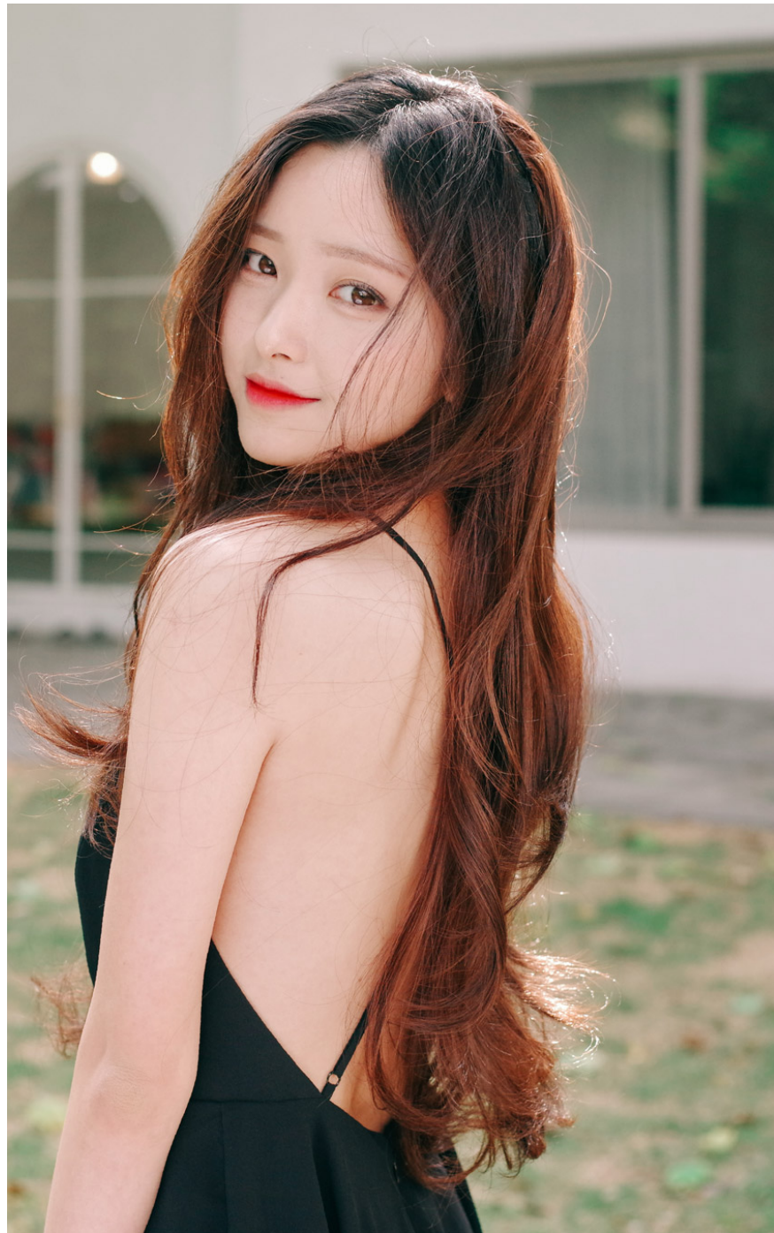
Back hairstyles for beautiful round face