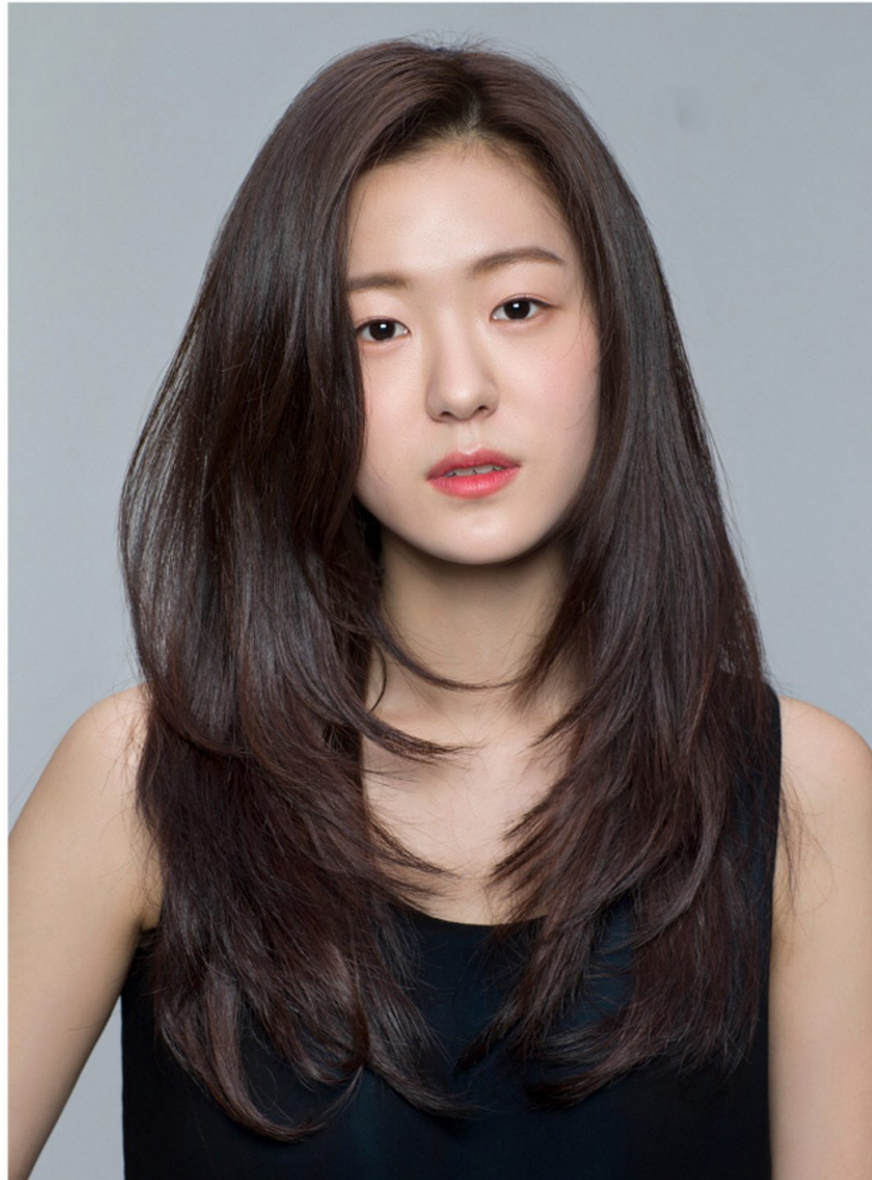
Beautiful straight back puffy hair