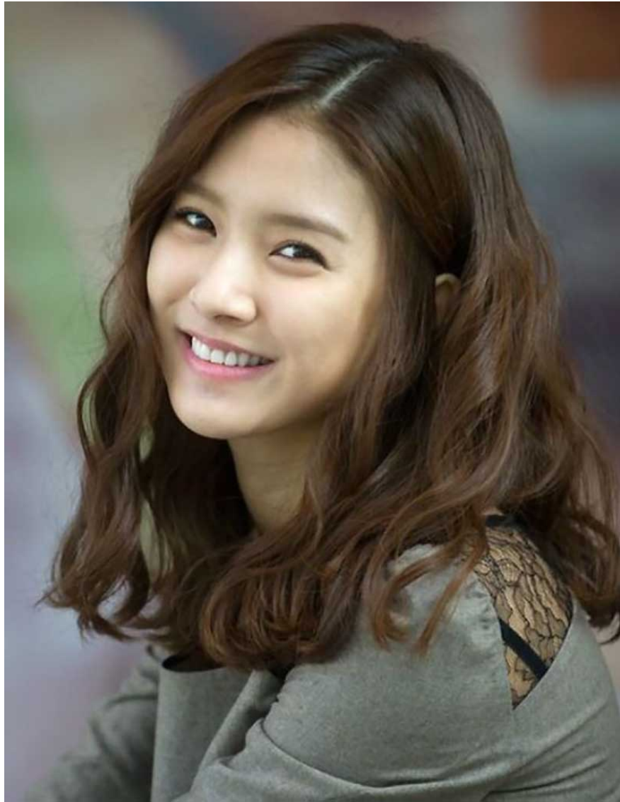
Lightly wavy curly hair