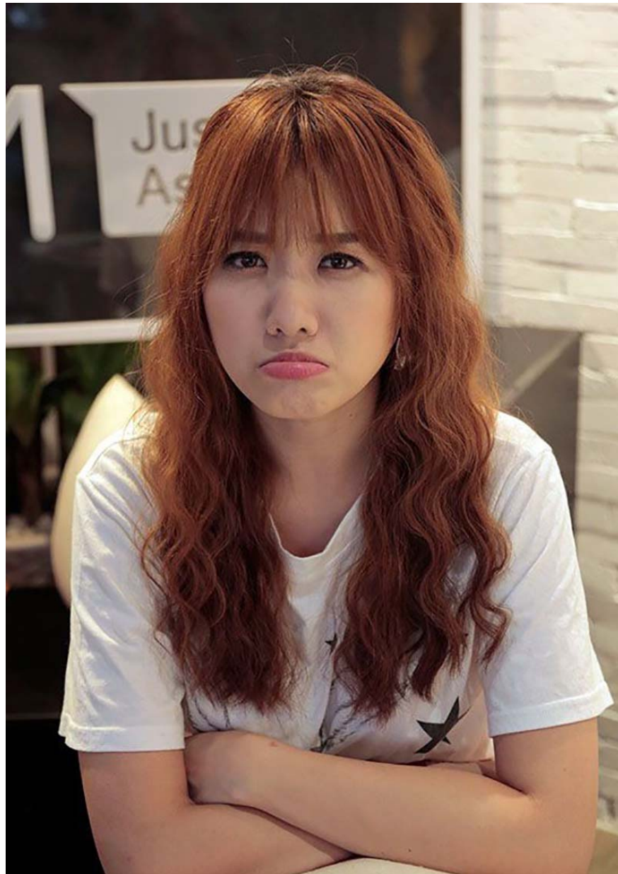
New and most beautiful back hair