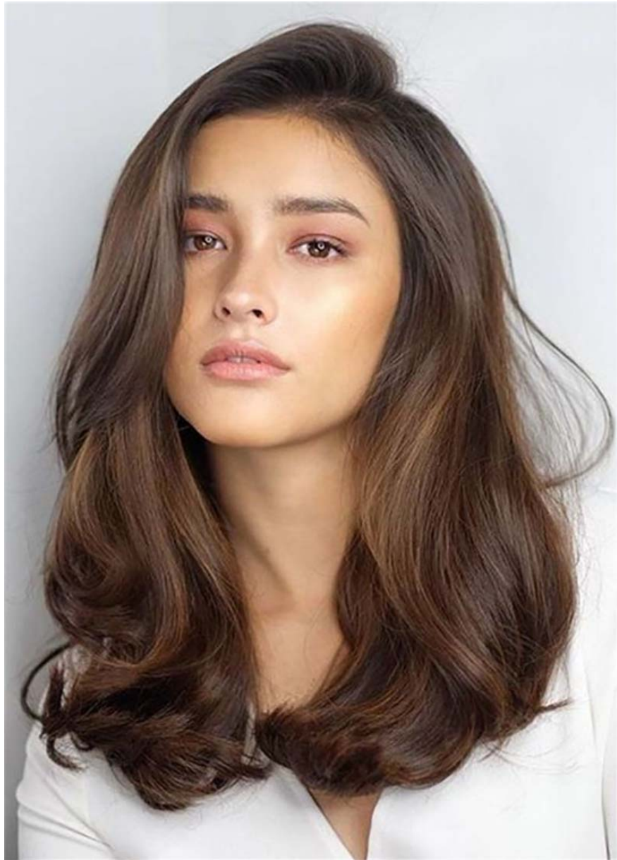
Waist hairstyle curled tail