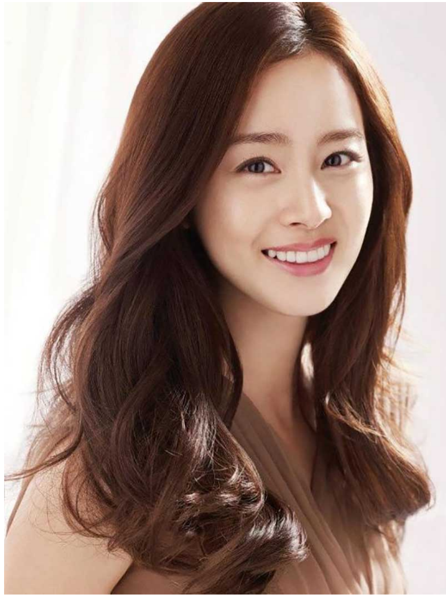
Hairstyles around the waist swelled