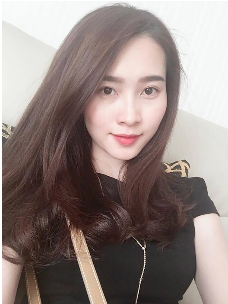
Beautiful back-length female hair