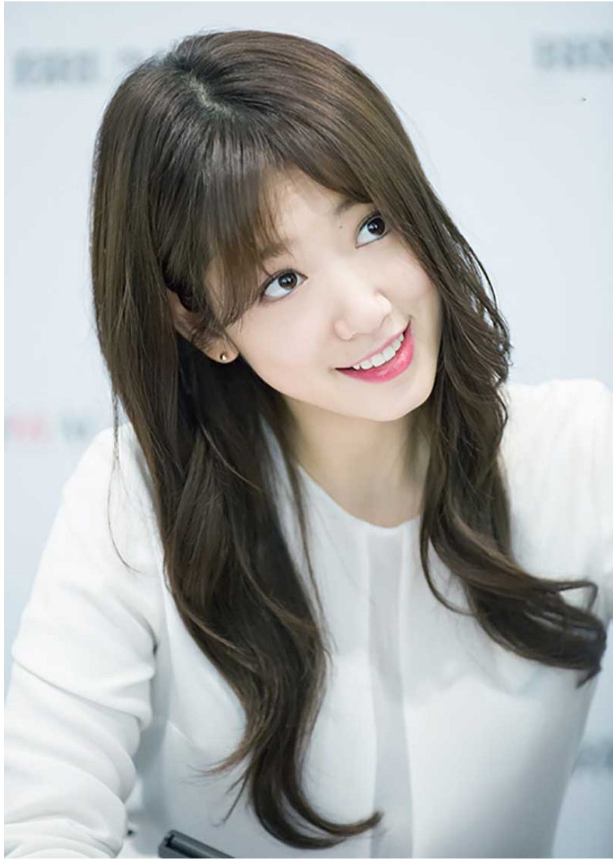
The most beautiful curly back hairstyle