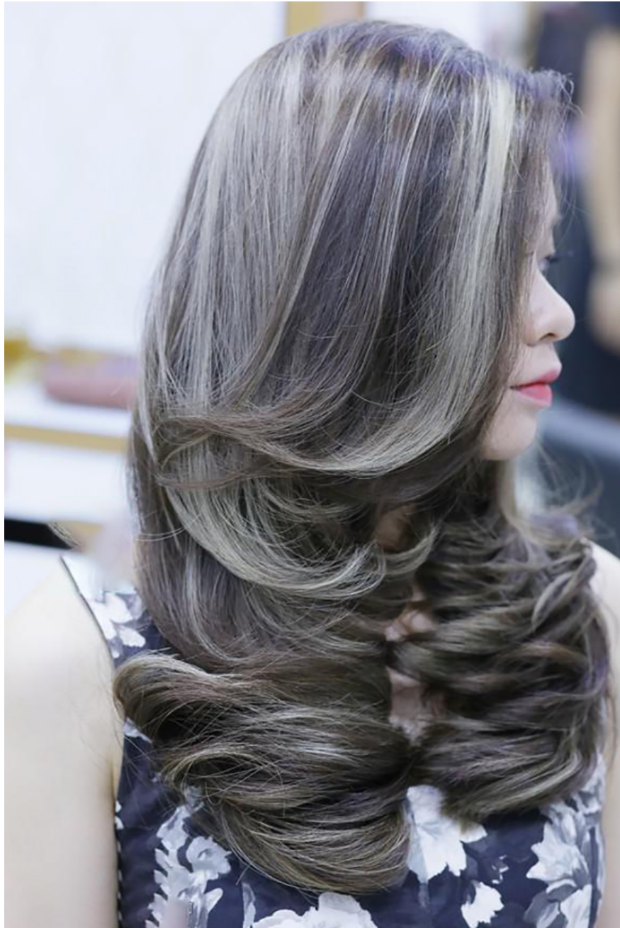
Straight back hair stretched out