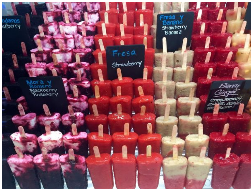
19. Looking to buy already, right?