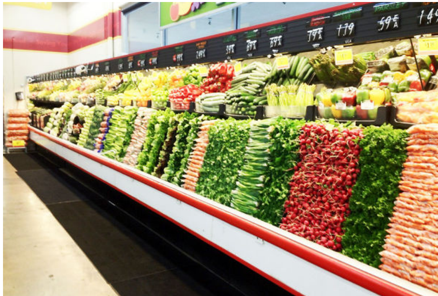
20. Supermarket . super neat!