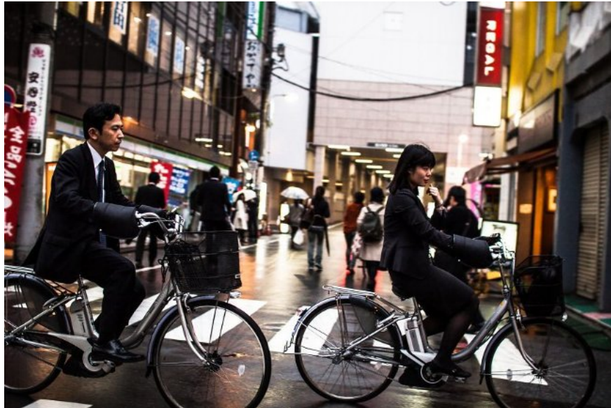
Sleep anytime, anywhere.