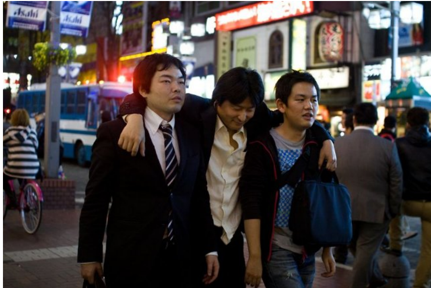
So tired that sitting down can sleep a good night.