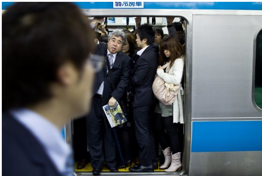
People are always in a hurry!