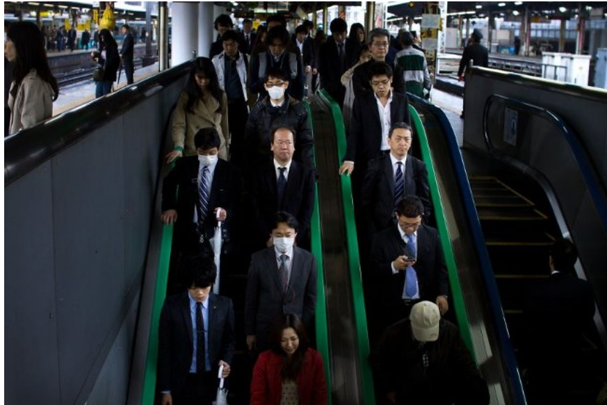
The subway is crowded with people who are seeing every day in Japan.