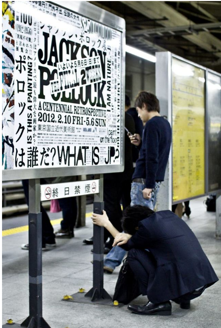
Entertainment after a hard working day.