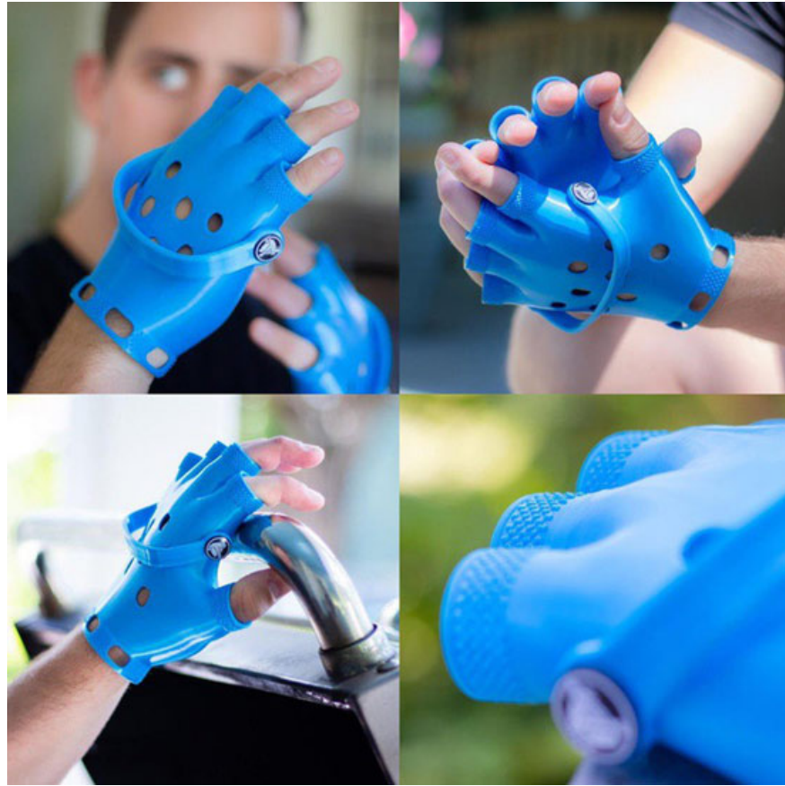
Accessories for those who shed tears, extremely convenient and stylish.