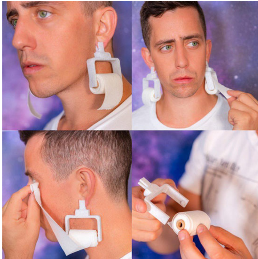
A nice little accessory for pizza lovers.