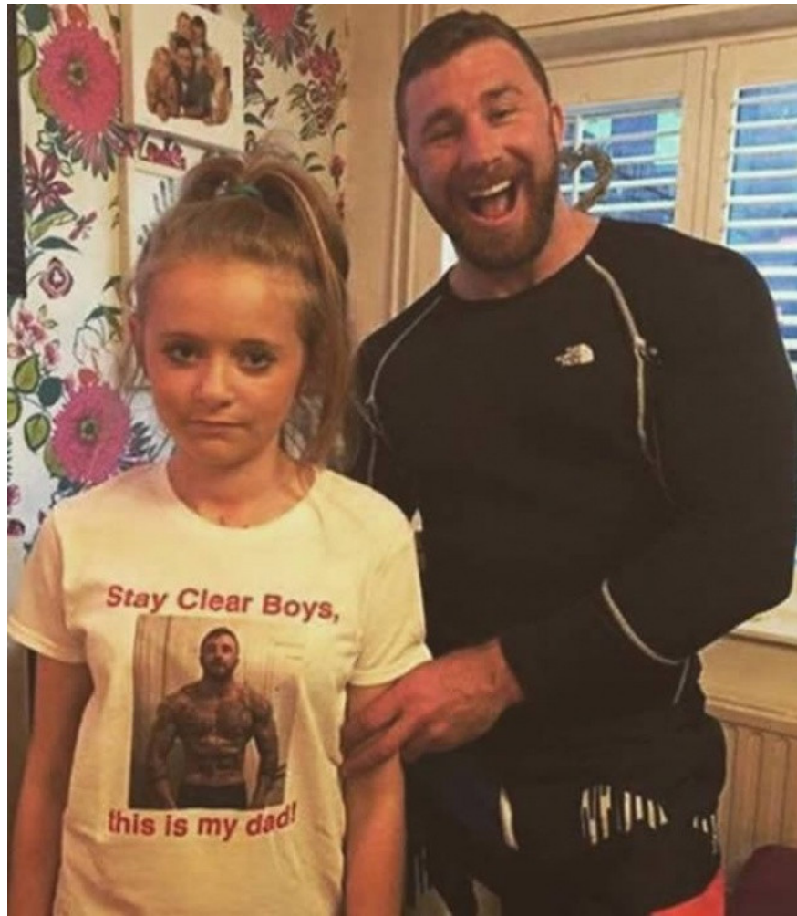
Rules are rules!