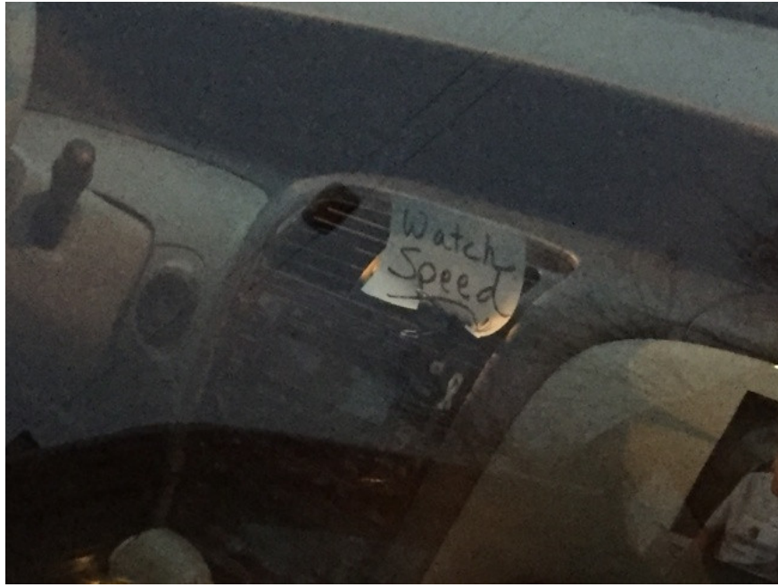
When you know your daughter's driving style is too good.