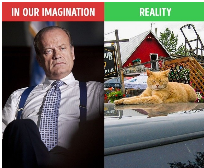
© Starz © Jenni Konrad On the right is the Mayor of Talkeetna, Alaska . Yes, it's a cat! Its name is Stubbs, and it worked for 19 years. But how to make policies for the people?