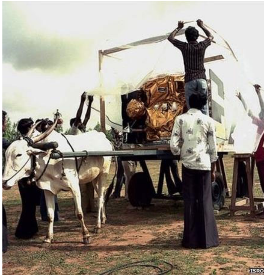
'Apple', India's first satellite, was transported by bullock cart in 1981.