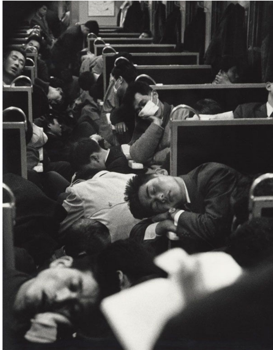
The train that carried workers to work early in the morning in Japan in 1964, everyone took advantage of a little more sleep.