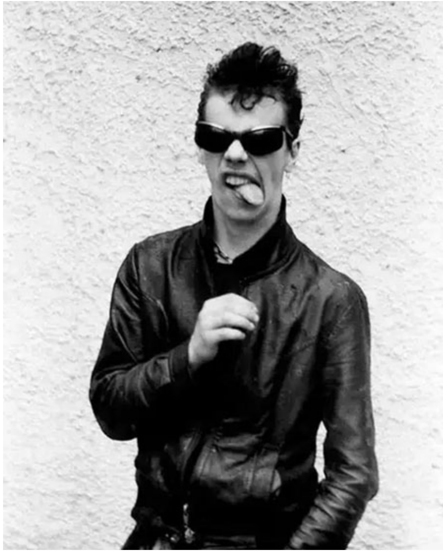
Photo of Russian Prime Minister Dmitry Medvedev in his youth, 1986, when he was only 21 years old.