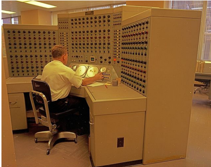
Man working on a fairly large early version of the computer, 1968.