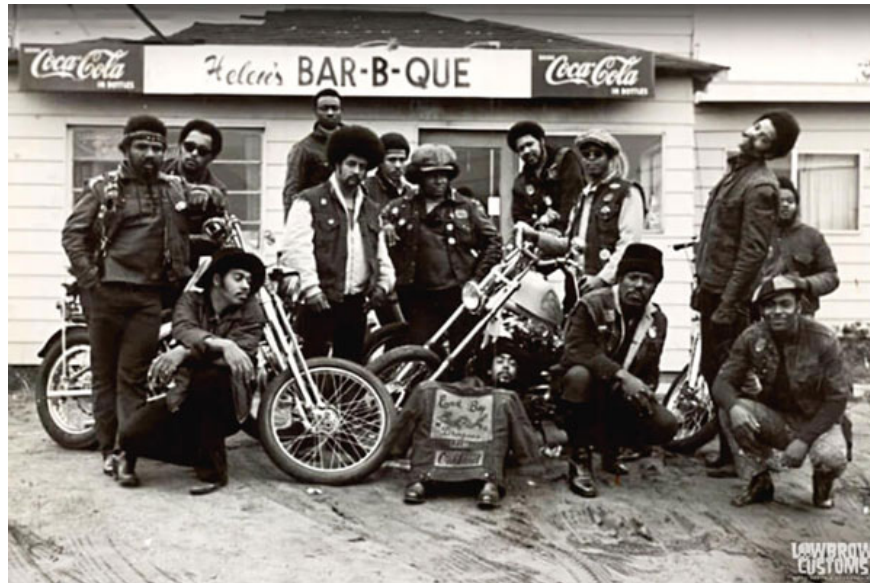
Pictured is the first biker gang in Oakland, California in the 1960s called the East Bay Dragons.