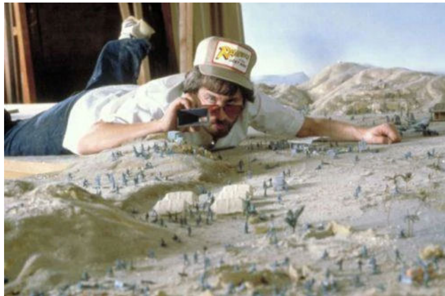
Director Steven Spielberg made the first Indiana Jones film in 1980 - an American series about the adventures of Dr. Henry Walton - a professor of archeology.