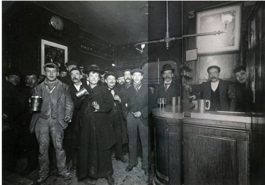
This photo shows a rather crowded interior at a London pub in 1898.