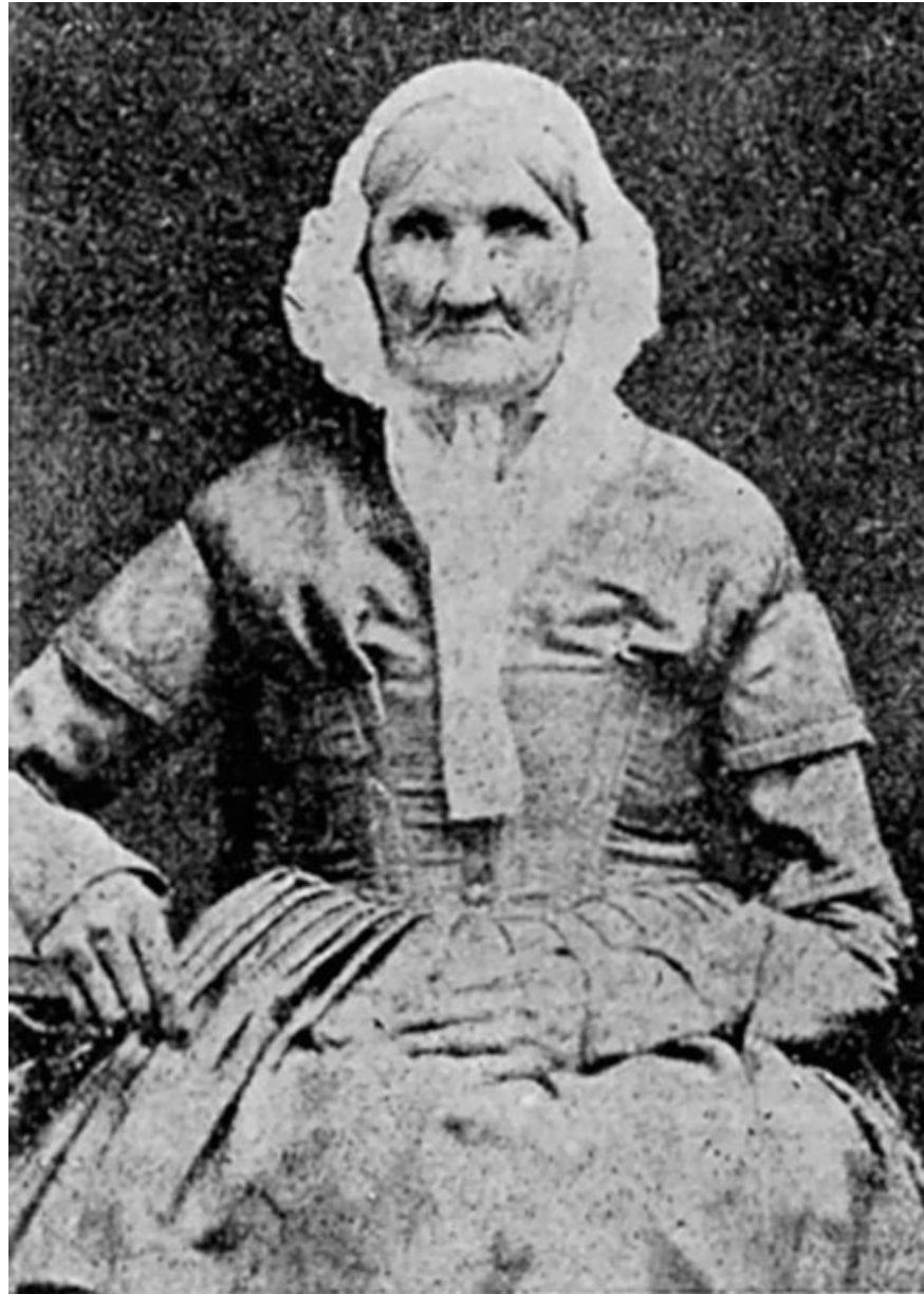
Hannah Stilley was born in 1746. The picture was taken in 1840, this is probably the first person to be photographed and possibly the first film photograph.