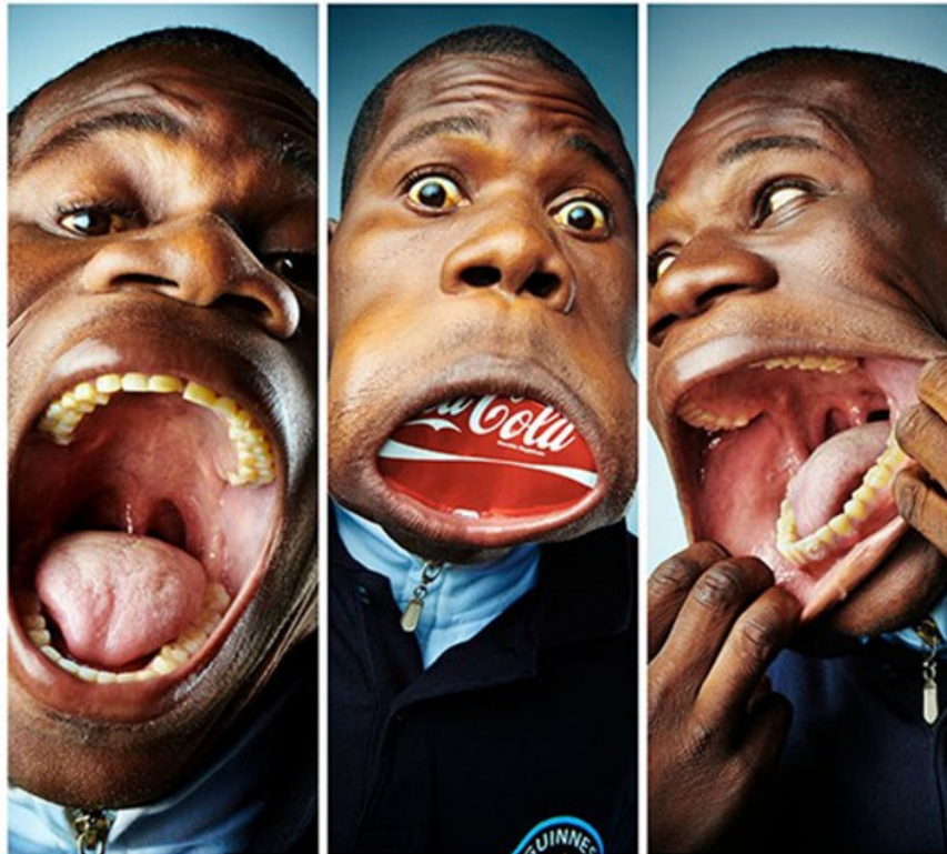
The world's largest mouth belongs to Francisco Domingos Joaquin from Angola with a size of nearly 18 cm - enough to level across a can of soda.