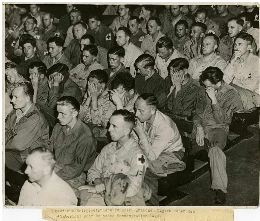
Shame, regret and fear of Nazi prisoners when they were shown the images of them slaughtering, torturing brutal prisoners in concentration camps.