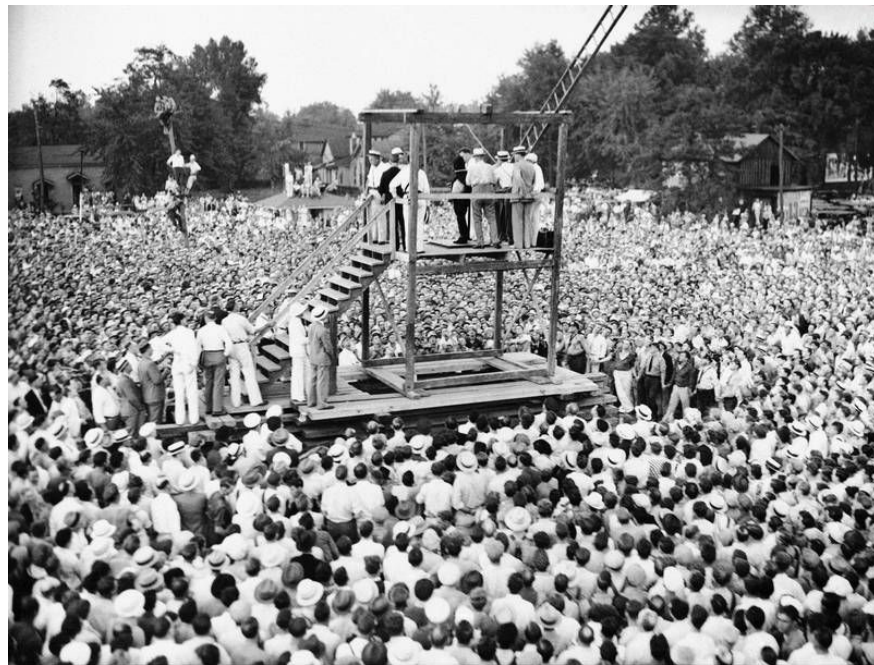
The world's last public death row prison action attracted a lot of people to watch.