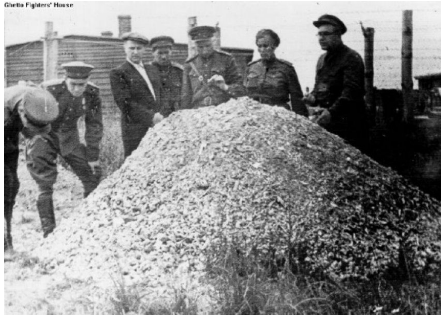
Soviet soldiers stood next to the ashes of the bones after cremating the prisoners killed by the Nazis.