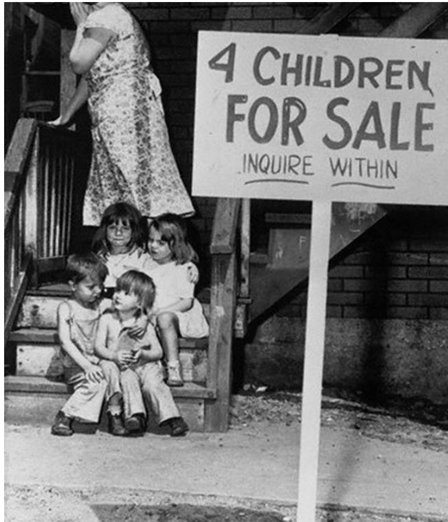
Due to her inability to support four children and a fifth pregnancy, the mother had to sell her children. The photo was taken in Chicago, USA in 1948.