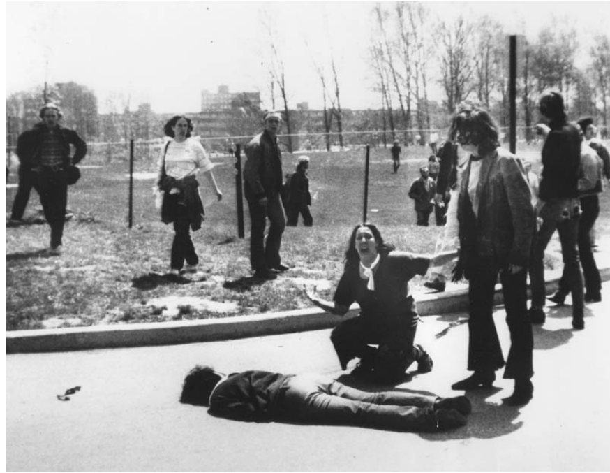
Mary Ann Vecchio burst into tears at Jeffrey Miller 's body - one of four young students shot dead by police during the 1970 protest of Kent State University student in Ohio, USA.