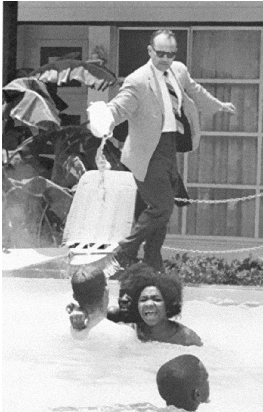
The picture shows the owner of the hotel pouring acid into the pool when colored people are swimming in it. The photo was taken in 1964, haunting many people about racism.